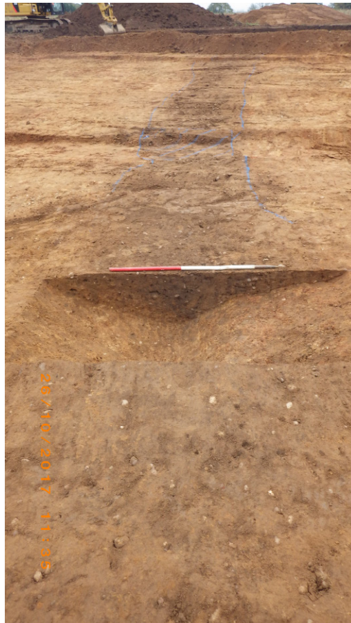
Plate 2: View along ditch 43, looking north