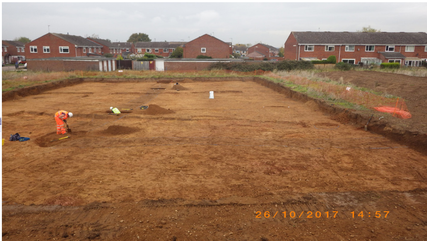
Plate 1: The site during excavation, looking north