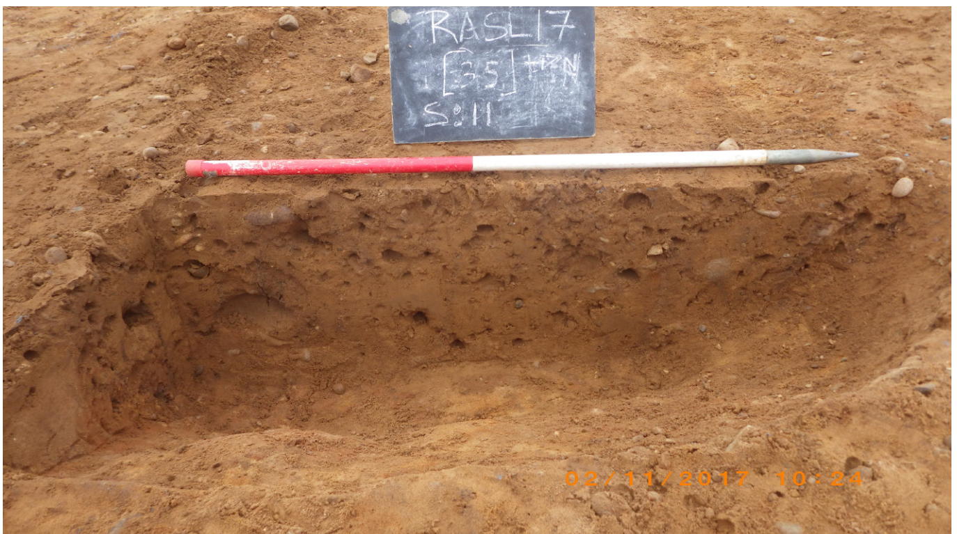
Plate 4: Northern terminus of ditch 44, looking west