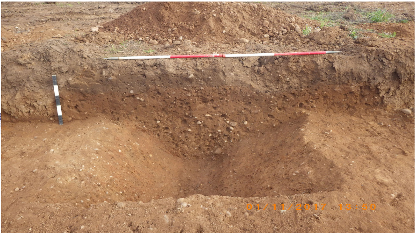
Plate 3: Section 10, ditch 43, looking east