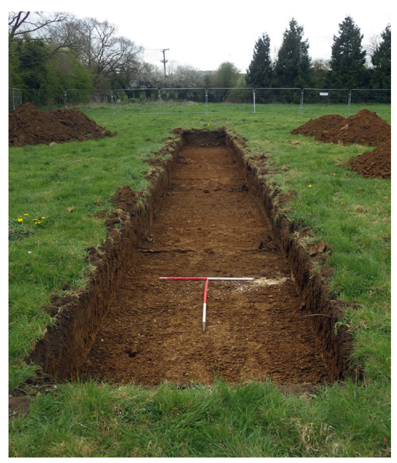
Plate 2: Trench 2 view to NE