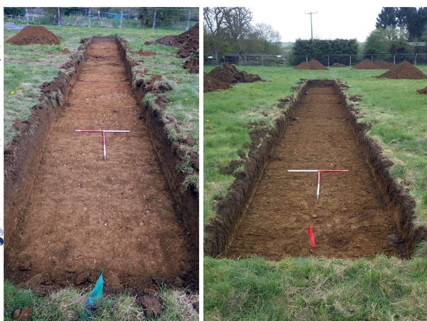
Plate 1: Trench 1 view to NW