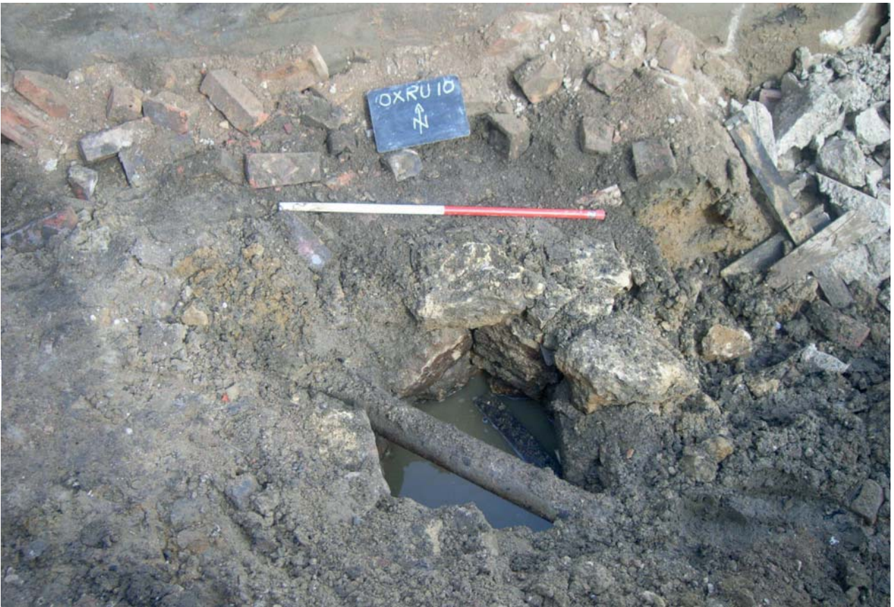
Plate 1: Well 63