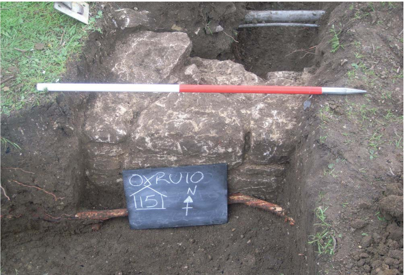
Plate 2: Wall 15