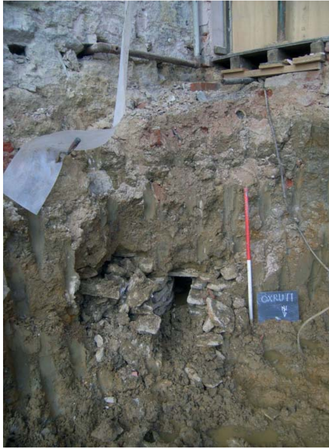
Plate 3: Culvert 55