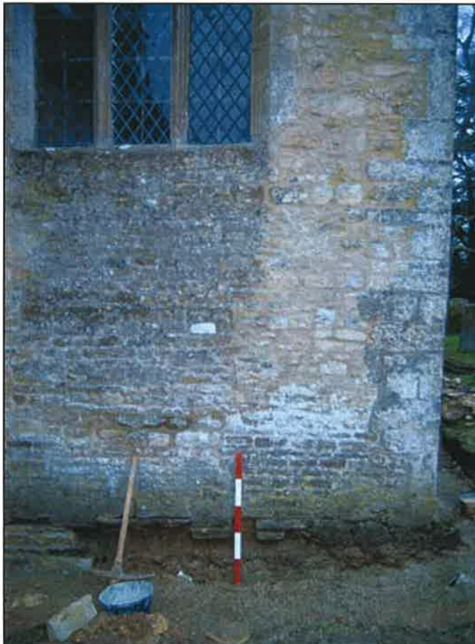
Plate 6: External view of blocked doorway?