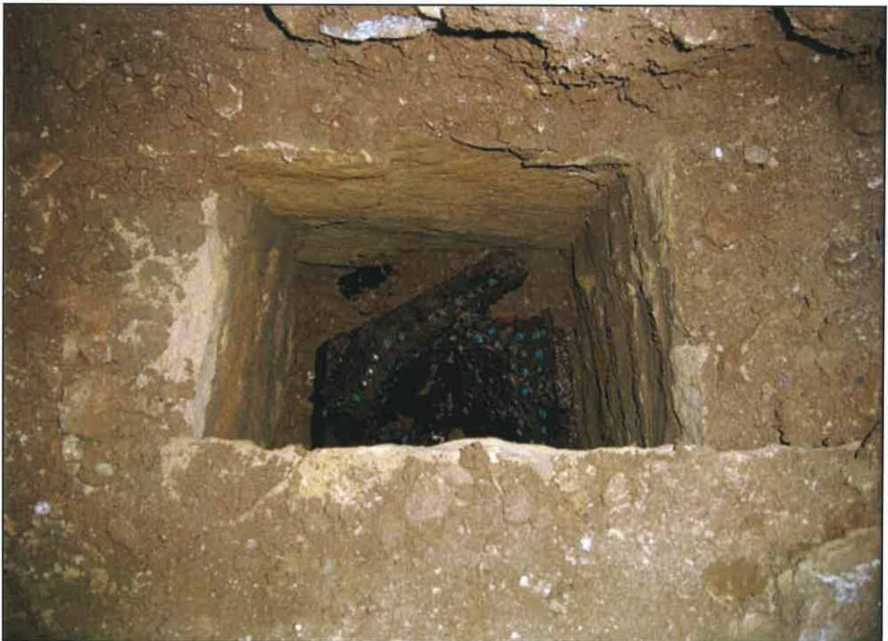
Plate 4: Detail of coffin end