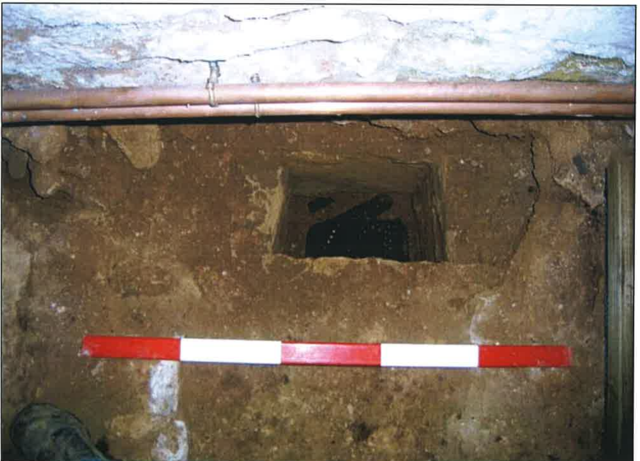
Plate 2: End of coffin exposed after stone removed