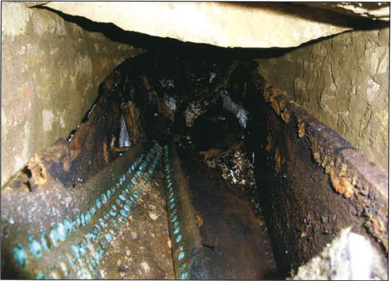
Plate 3: View of coffin down length of grave