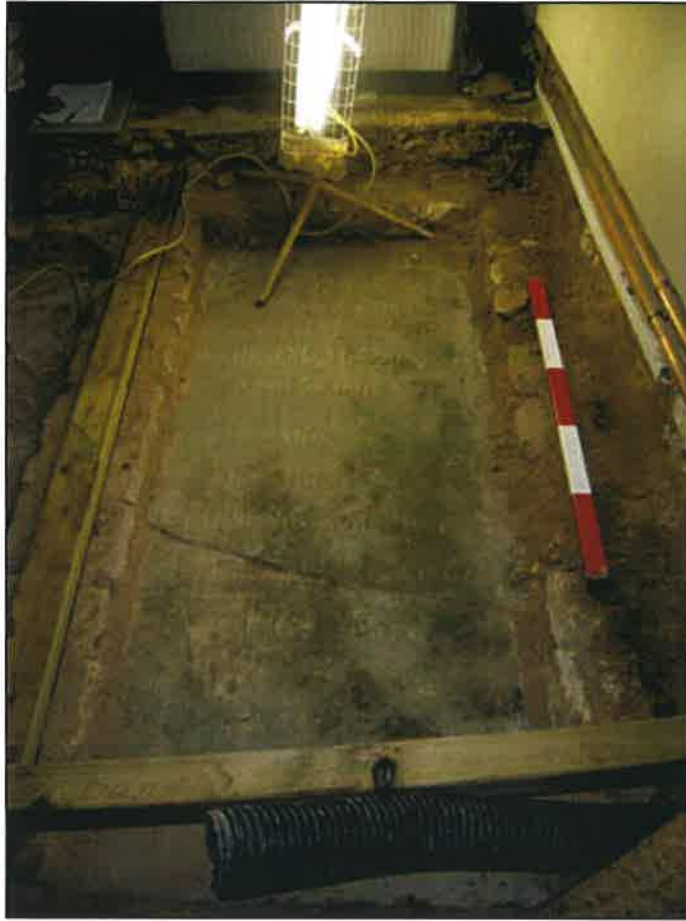
Plate 5: View of memorial slab