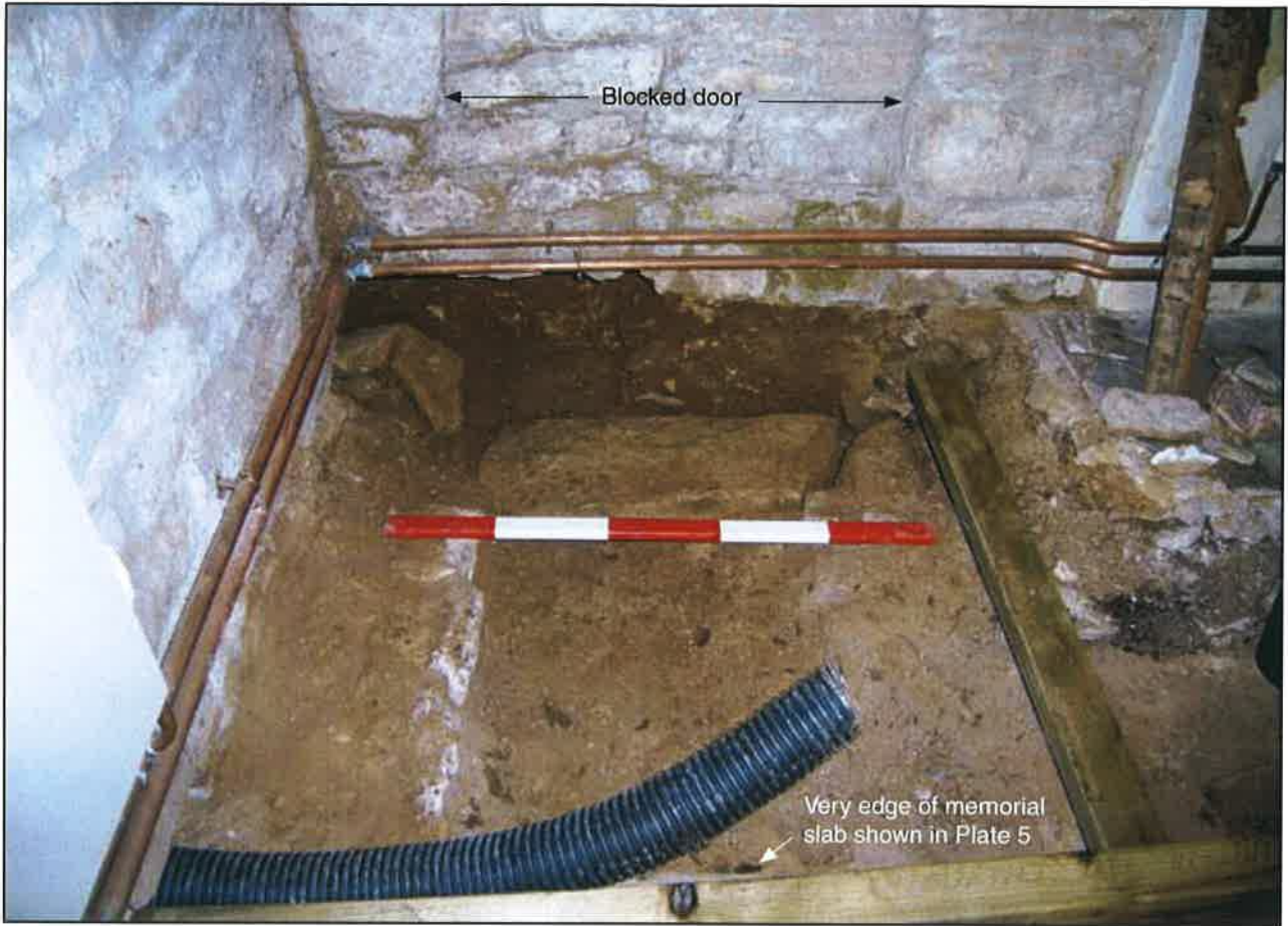
Plate 1: View of capping stones on grave