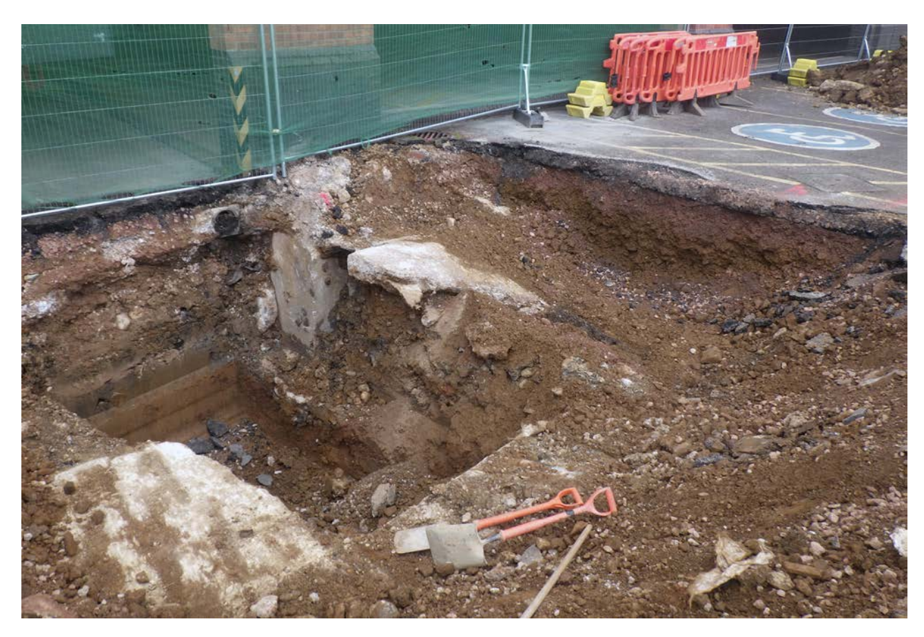
Plate 2: Lift shaft pit excavation, looking west