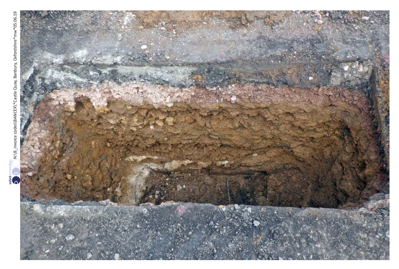
Plate 3: Test pit, looking north-west