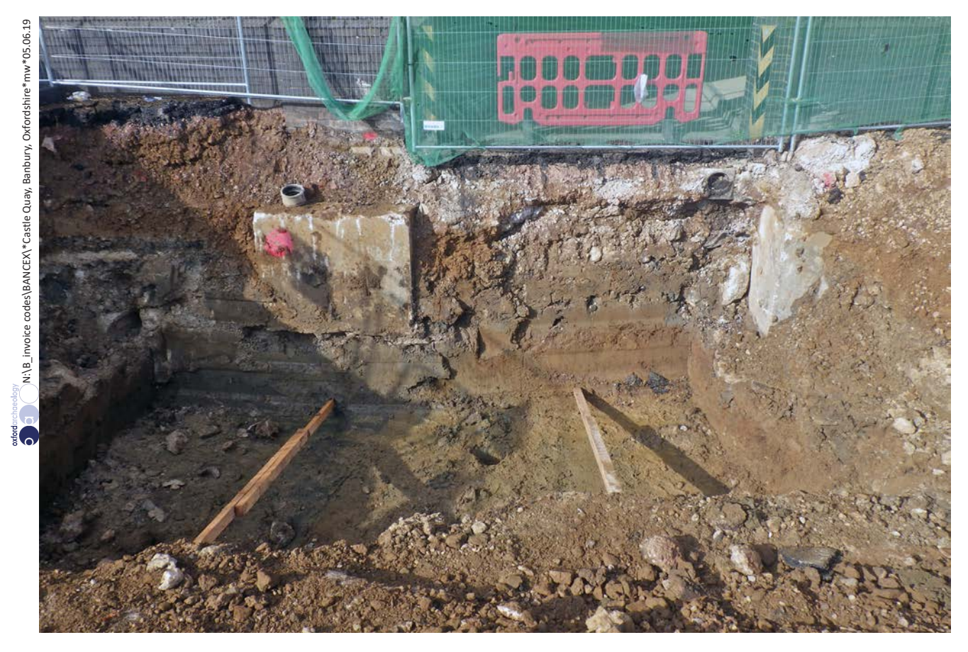
Plate 1: Lift shaft pit excavation, looking south-west