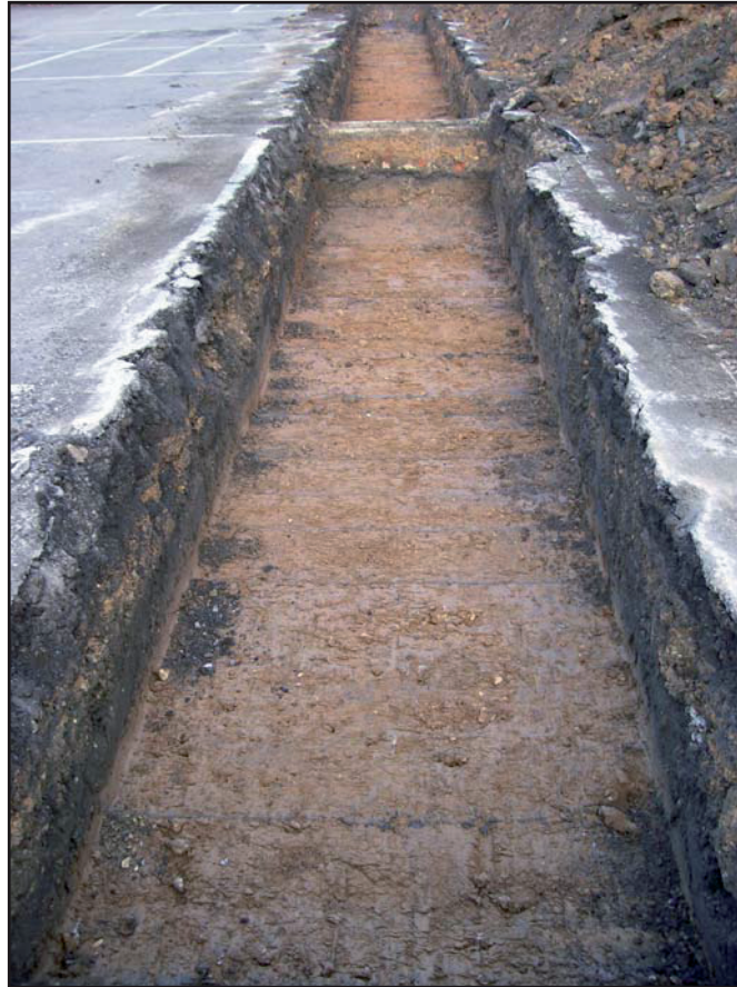
Plate 2: Trench 4, looking south-west