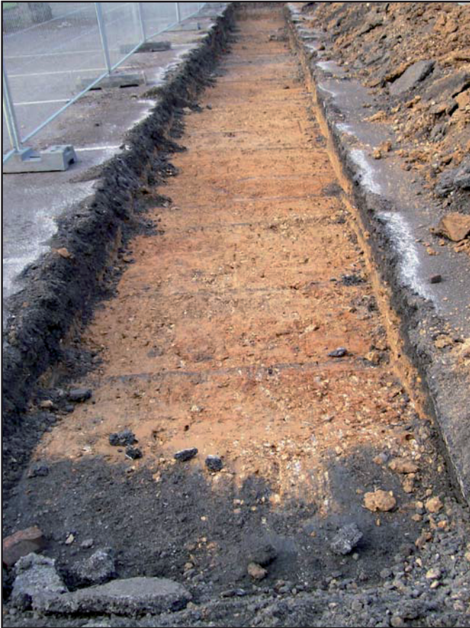
Plate 1: Trench 1, looking south