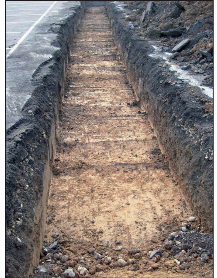
Plate 3: Trench 5, looking south-west