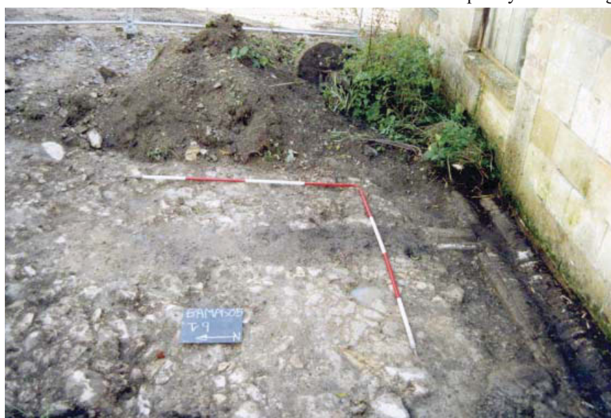
Plate 5: Trench 9 from the west showing robbed out course of gutter 904 and its junction with gutter 403