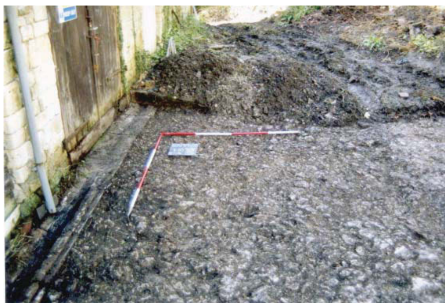
Plate 4: Trench 10 from the east showing wear in gutter in front of wagon store and quality of cobbling