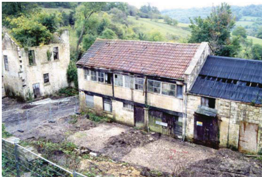
Plate 3: Trenches 9 and 10 from the north west