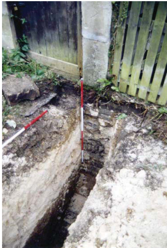
Plate 2: Trench 2 excavated, showing footings of Building 1c and quarry waste make-up, 206