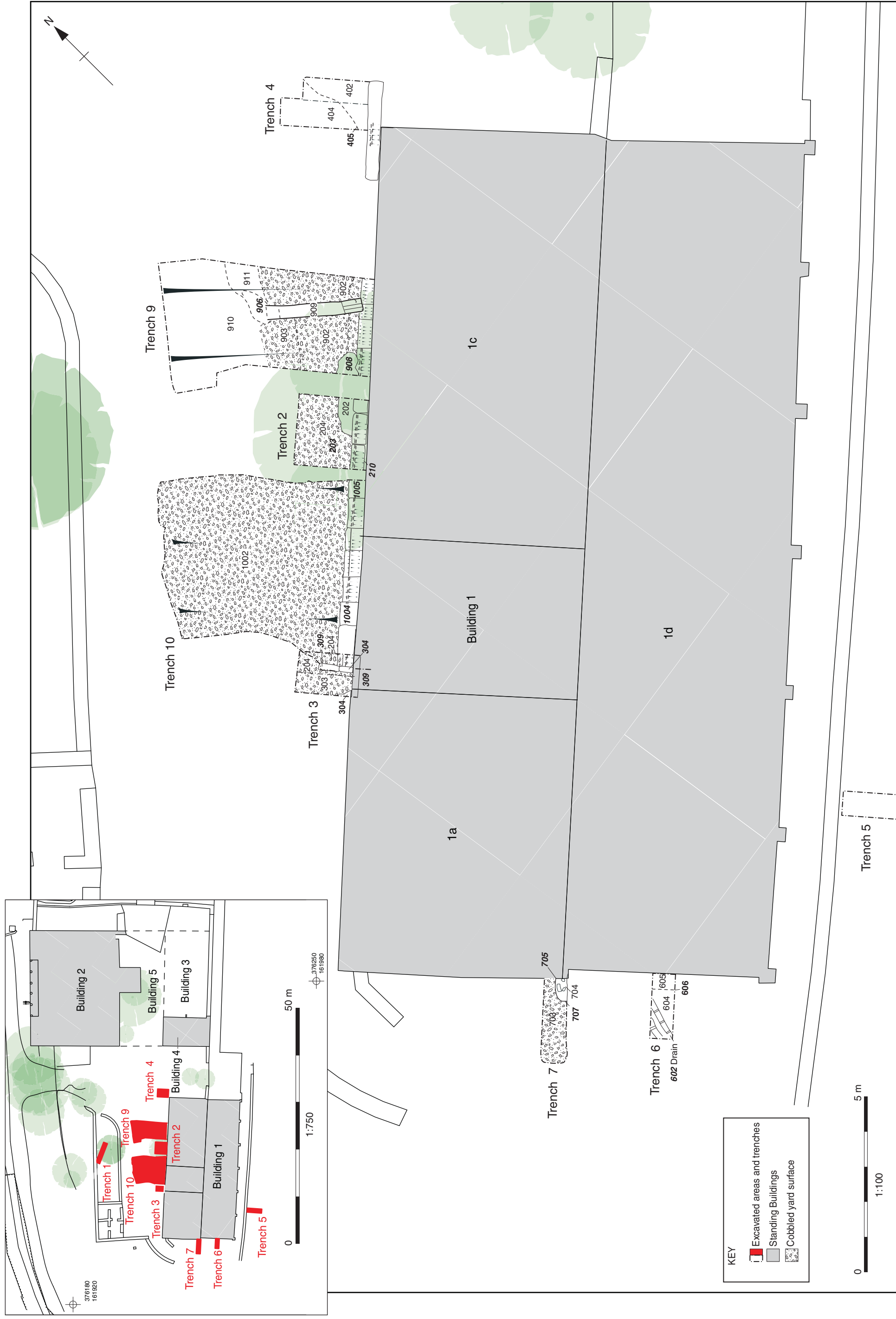
Figure 2: Site plan of De Montalt Mill, Combe Down, Bath (based on a survey by H.J. Rees & Company Ltd, Chartered Land Surveyors)