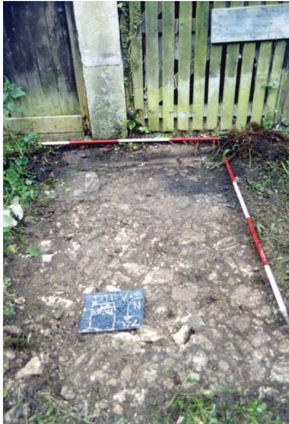
Plate 1: Trench 2 before excavation, showing cobbled surface 204