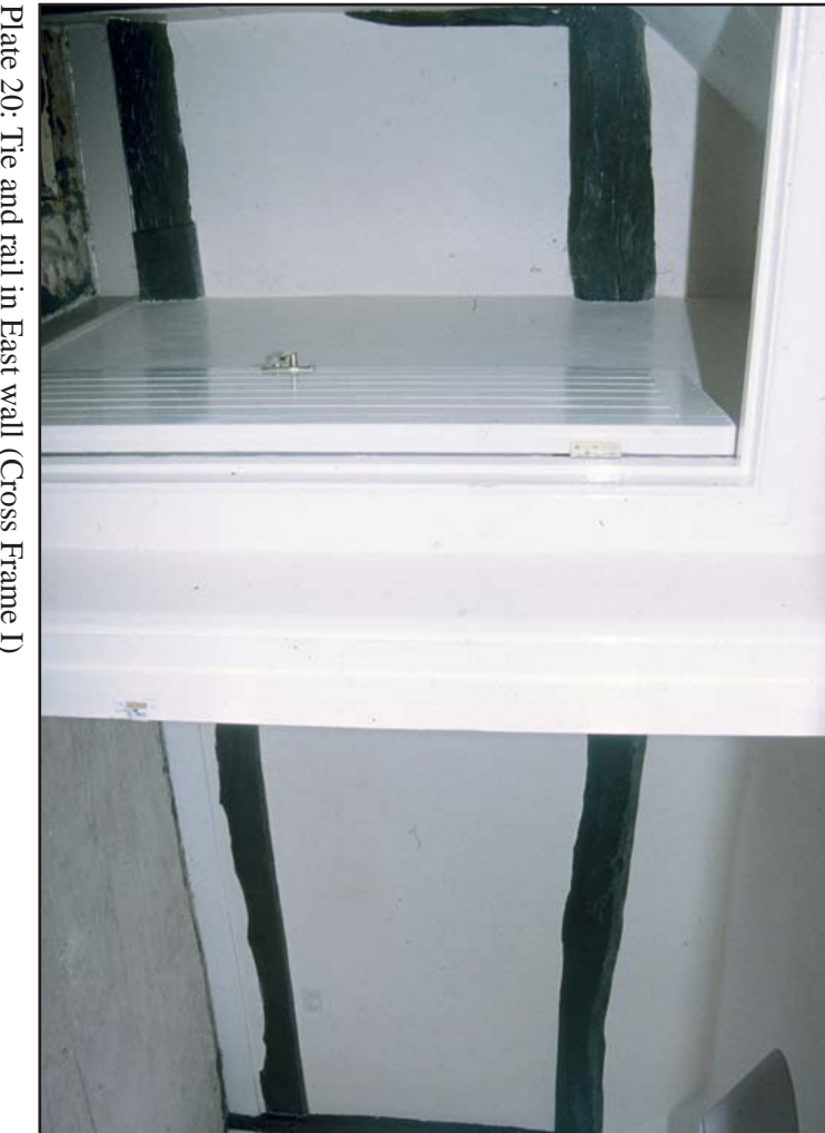
Plate 20: Tie and rail in East wall (Cross Frame I)