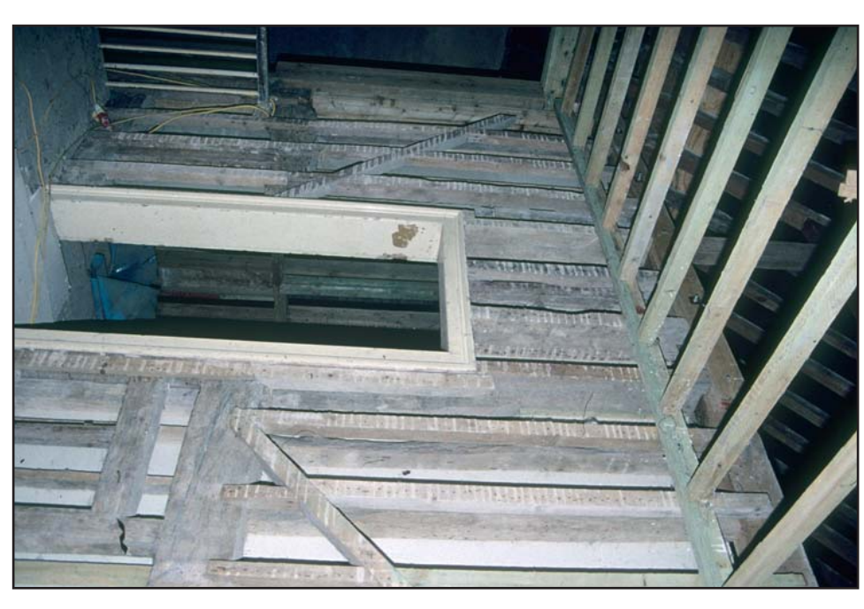
Plate 21: Secondary door between F3 and F4. Truncates primary tie-beam