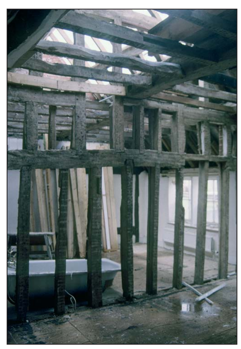
Plate 17: Cross Frame II at first floor looking east