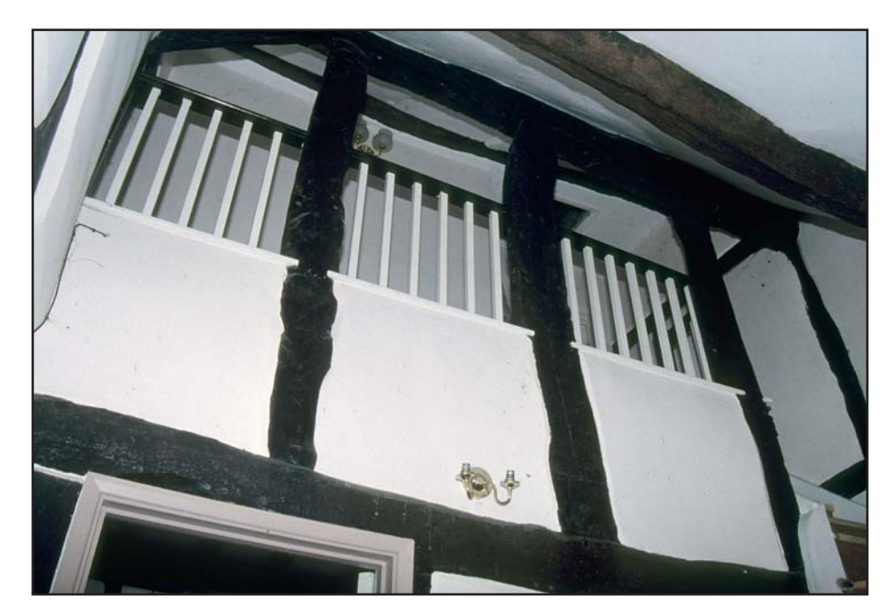
Plate 14: Primary studs in north wall of house (G8)