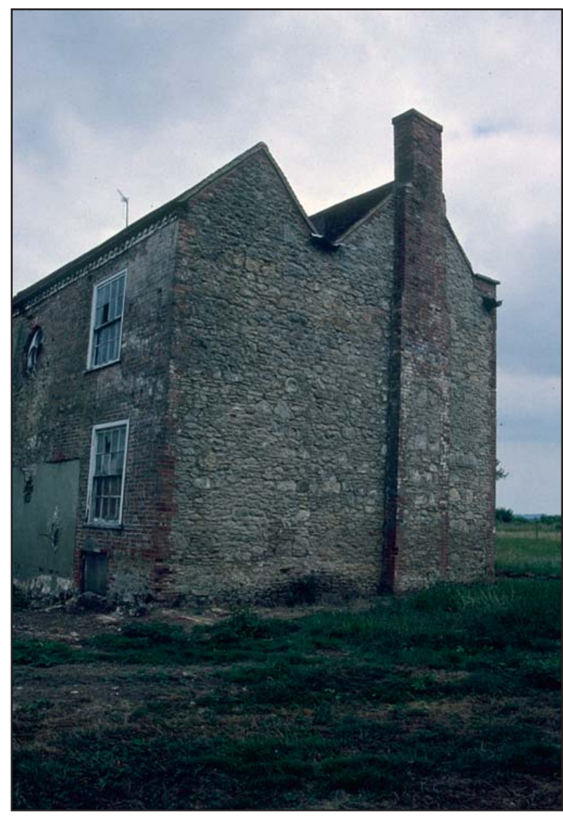
Plate 11: West elevation