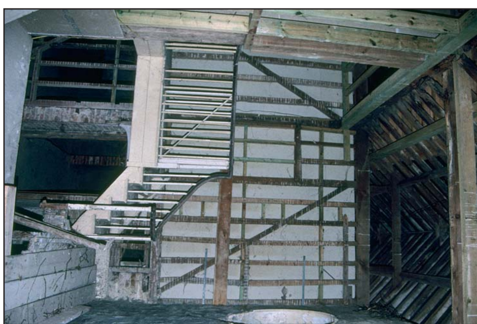
Plate 22: Westward view in Phase III extension (F4)