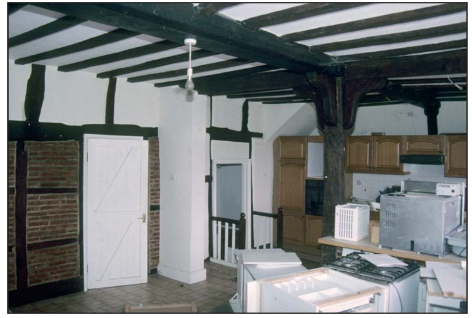
Plate 13: Kitchen (G7) in primary house