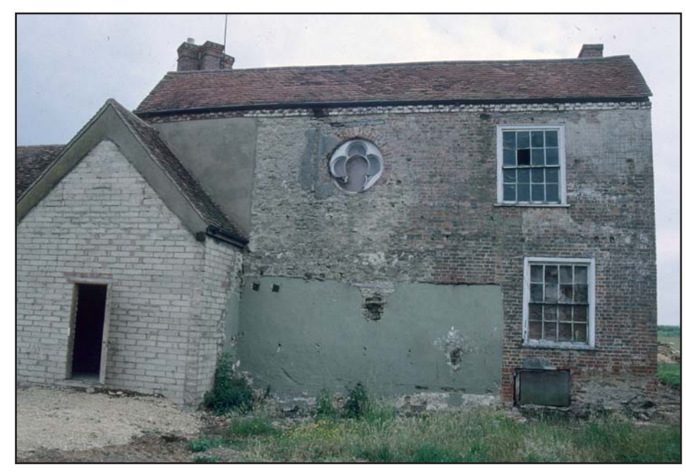
Plate 9: Rear (north) elevation