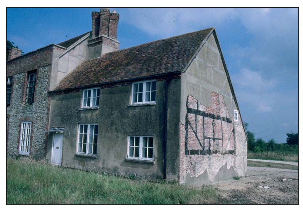
Plate 8: Primary building from south-east