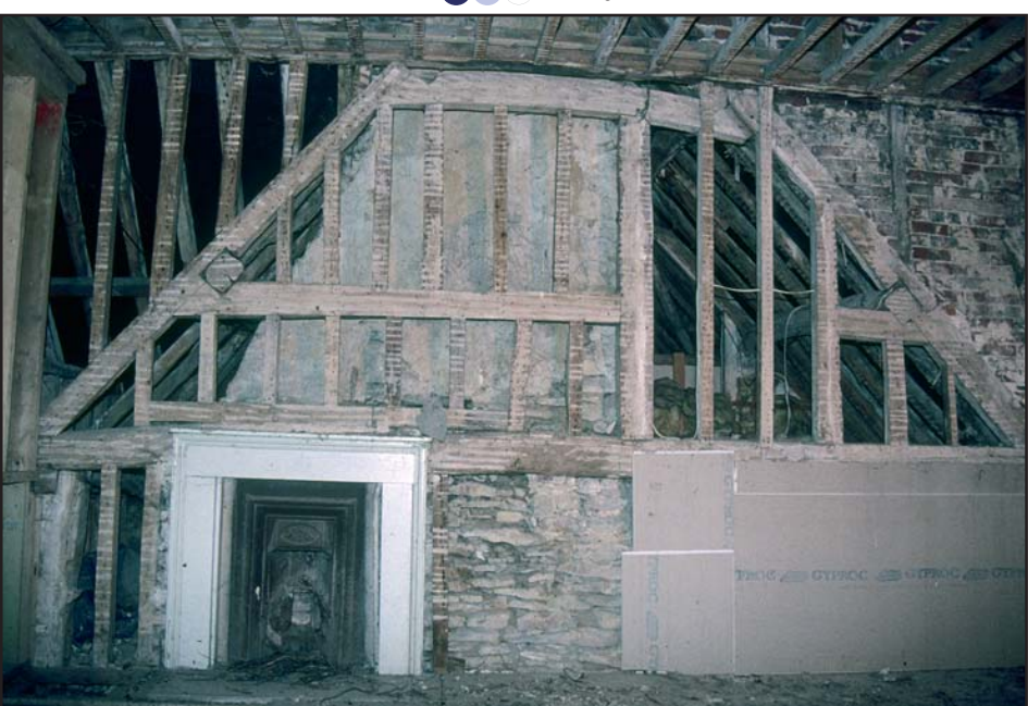
Plate 18: Primary truss and chimney in east wall of F5