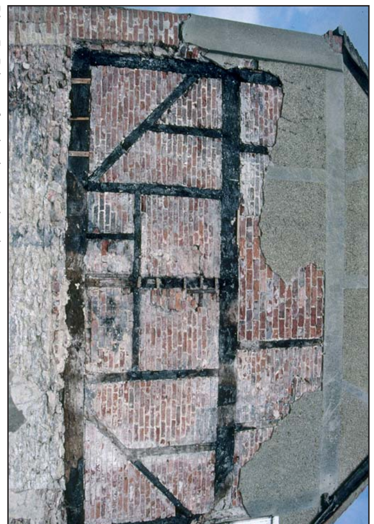
Plate 7: Primary framing in east elevation