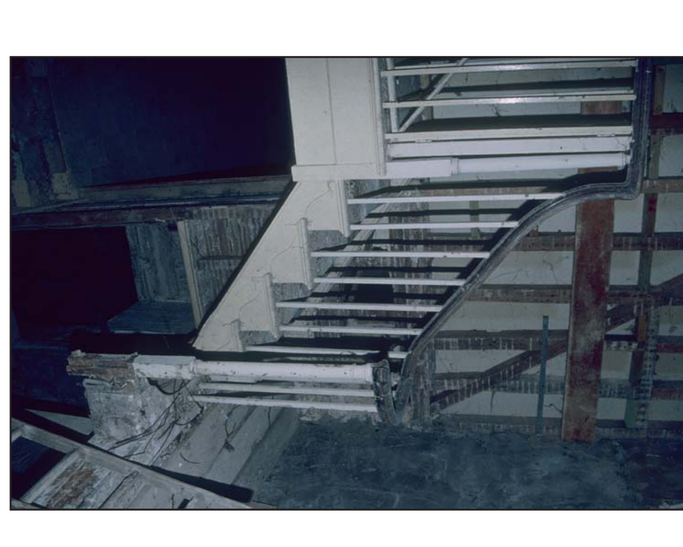
Plate 23: Staircase in Georgian extension (F4)