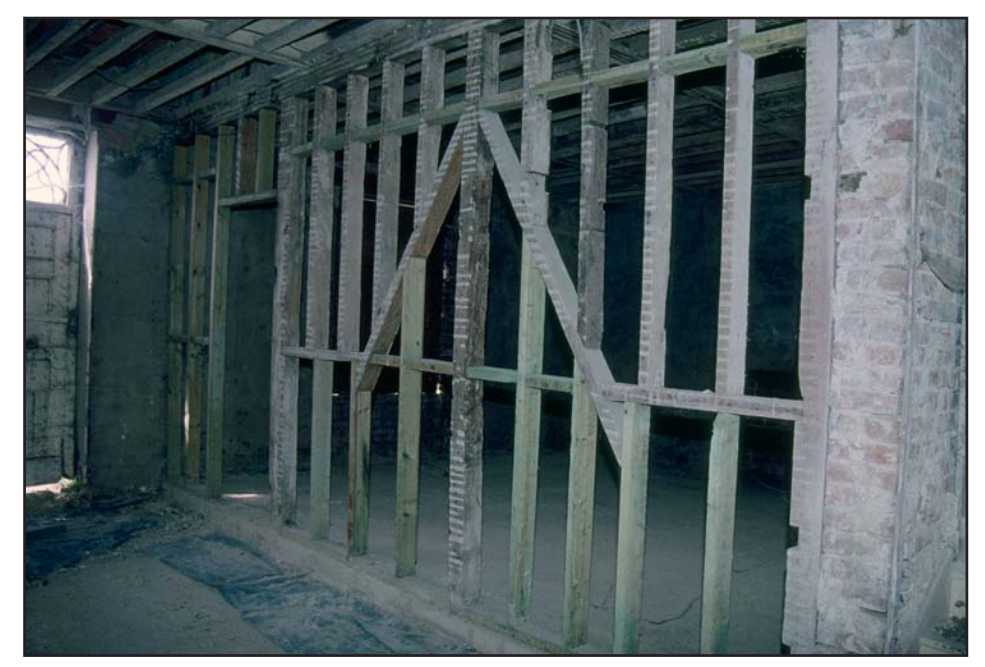
Plate 16: Georgian partition between G1 and G3