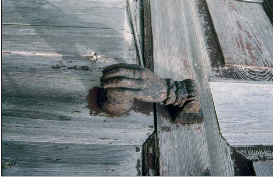
Plate 6: Front door in Georgian extension