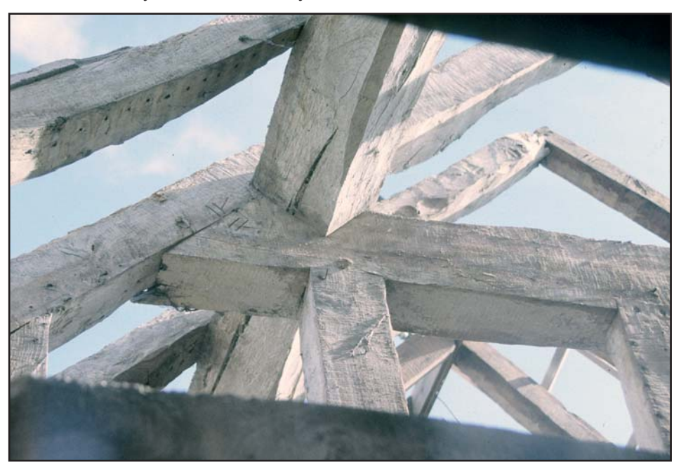
Plate 19: Truss detail in Cross Frame II