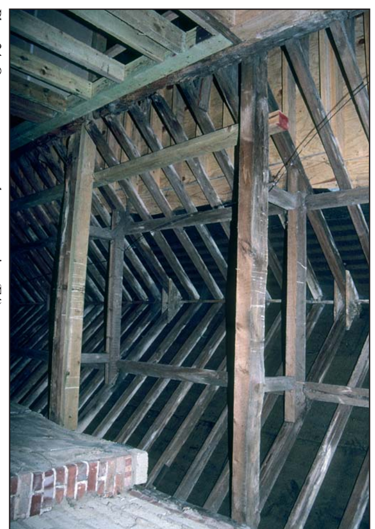
Plate 24: Queen post trusses above extension (F4)