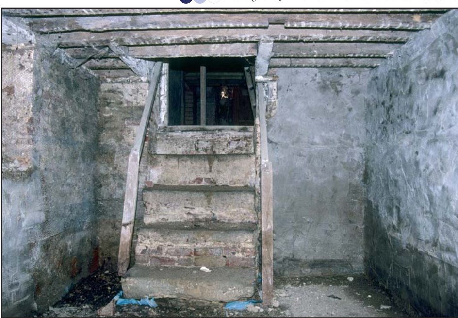
Plate 12: Cellar beneath Phase III house