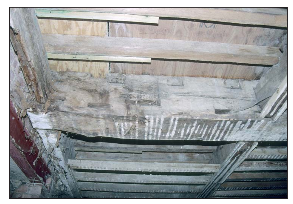
Plate 15: Very large reused joist in G1