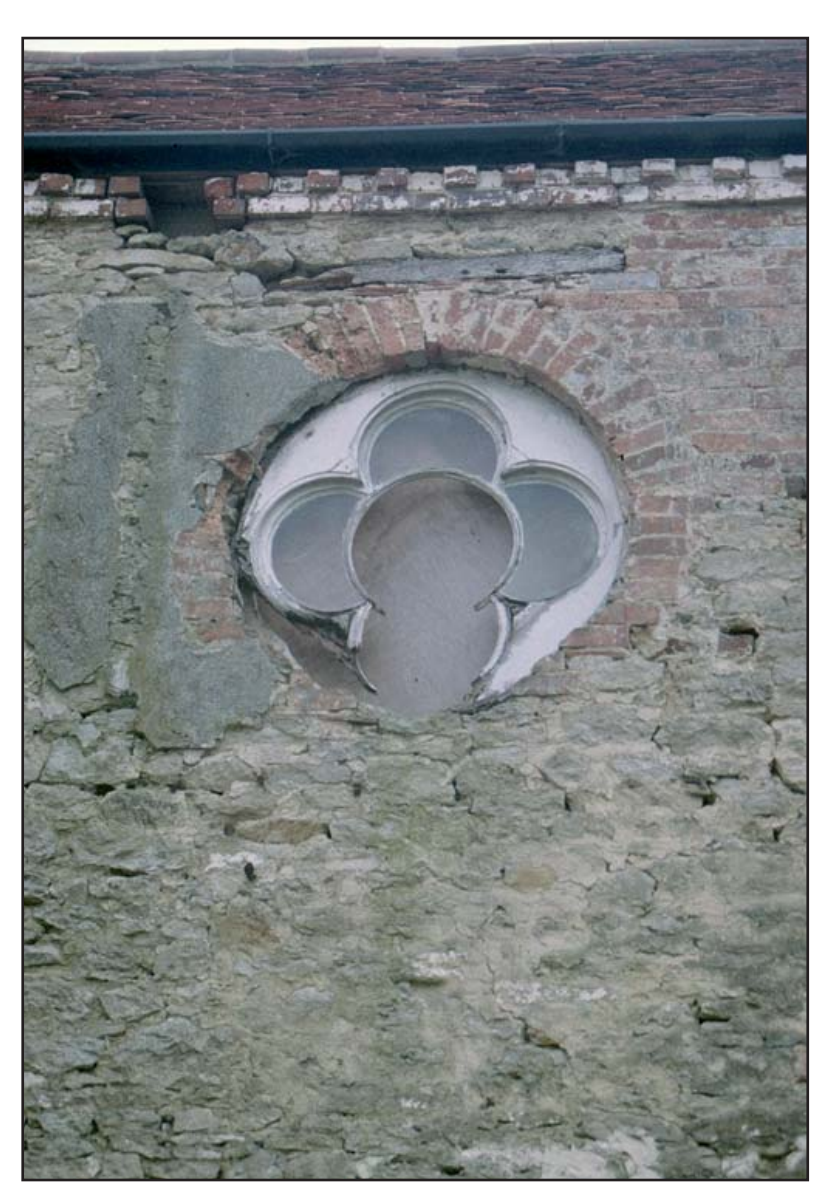
Plate 10: Bulls eye window in north elevation