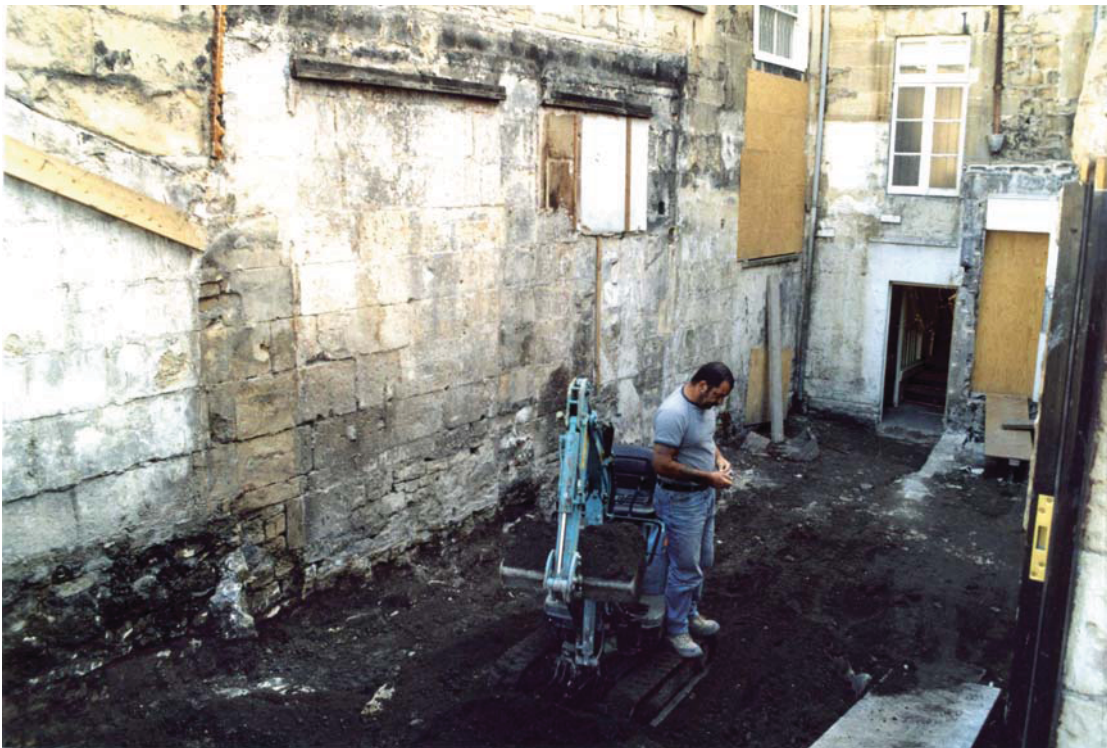
Plate 2: Looking eastwards during clearance of the post-medieval garden soil, before the discovery of pit 11, near the back door.