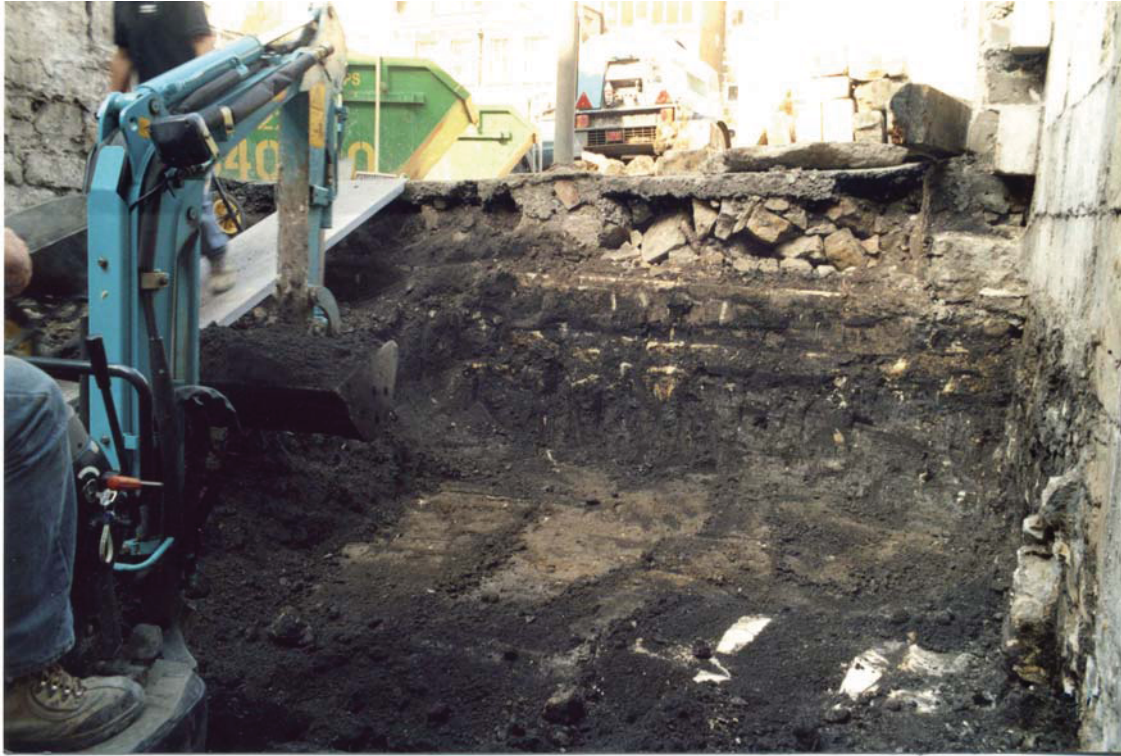
Plate 1: View westwards towards section. The ochre earth at the base is the medieval pit group fill.