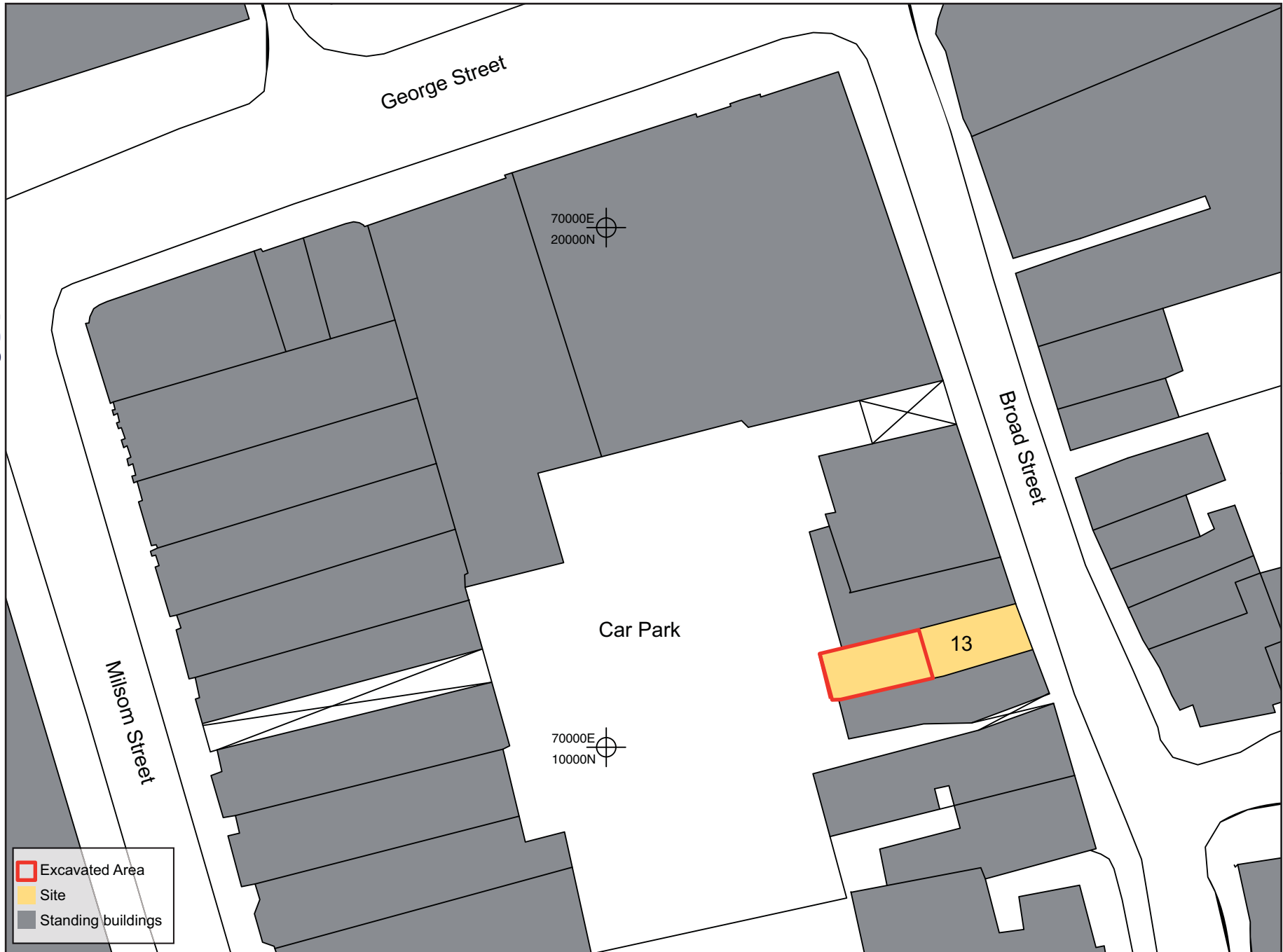
Figure 2: Location of excavation