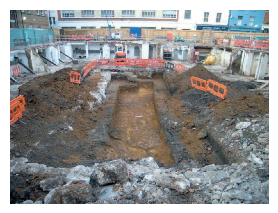
Plate 1: Uneven nature of the quarrying, looking west