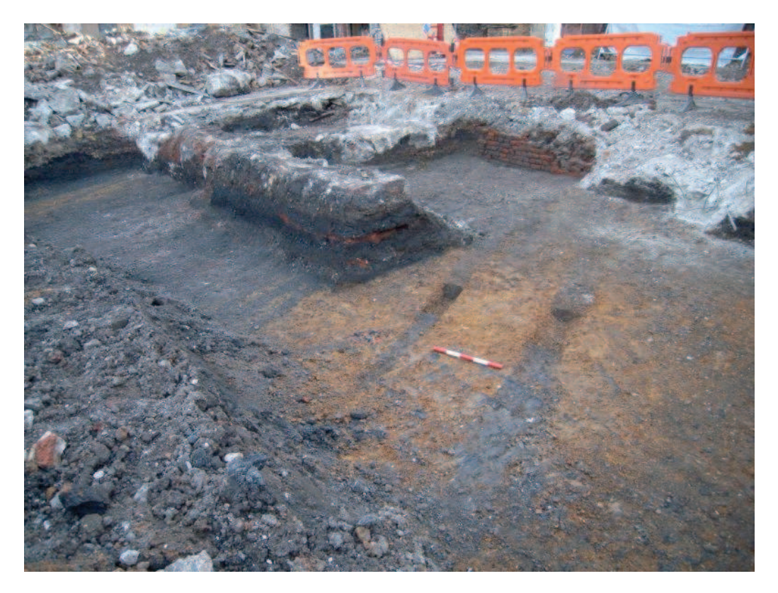
Plate 3: Evidence of wheel ruts in surfaces prior to construction of the brick wall in the background, looking south-east