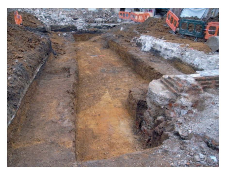
Plate 2: Clearly distinct quarry areas, 5376 and 5377, looking east

Archaeological Excavation at Tottenham Court Road Southern Block Interim Report.