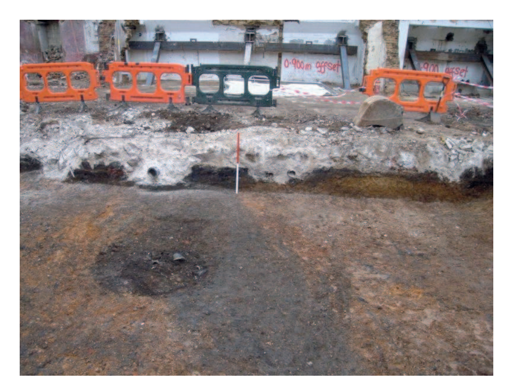
Plate 4: Pit 5360 cutting ditch 5361, looking south

2.1.8 Along the western limit of the visible surviving wheel ruts was a ditch (context 5361) on the same north-west/south-east alignment as the wheel ruts. The ditch was approximately 1.4m wide, 0.8m deep and extended beyond the limits of the excavation. There were several fills within it, the lower ones appearing consistent with displaced quarry backfill being re-deposited back into the ditch. The upper fills were darker and contained more industrial and organic traces, although none was well preserved. In theory, the ditch may be of a slightly later phase than the wheel ruts but it should be noted that the modern disturbances may have obscured the stratigraphy somewhat. The ditch was cut by later pit 5360 (Plate 4).