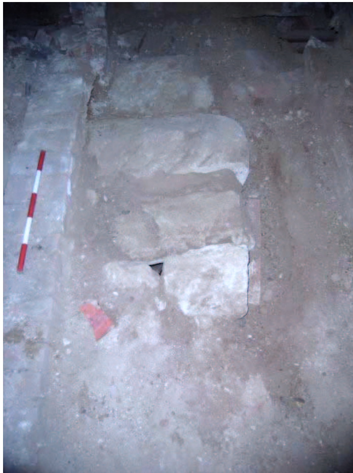
Plate 6: Burial, east end of north side of nave , facing east