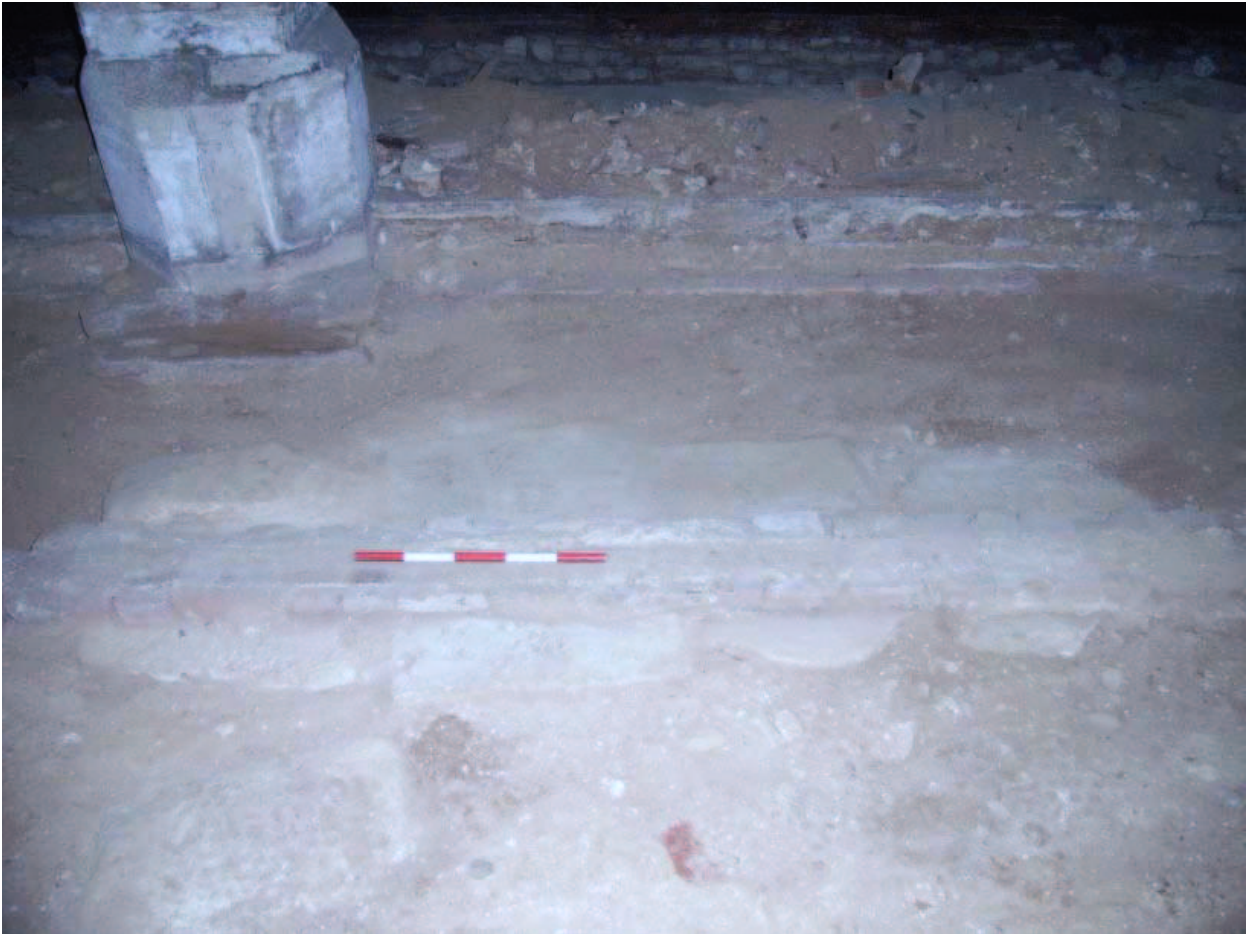
Plate 5: Central slabs in north side of nave, facing north