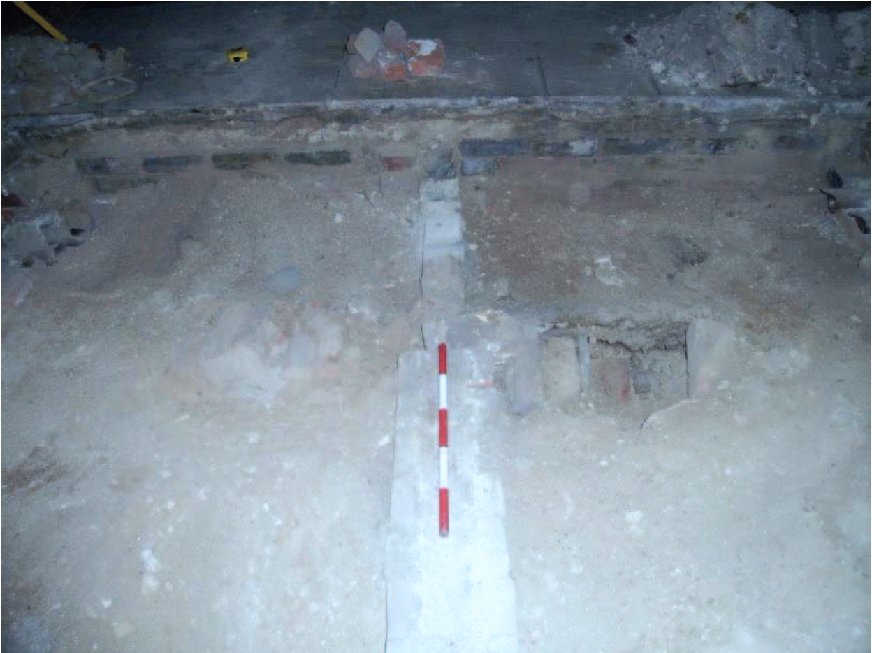
Plate 7: Possible collapsed vault at east end of south side of nave, facing east