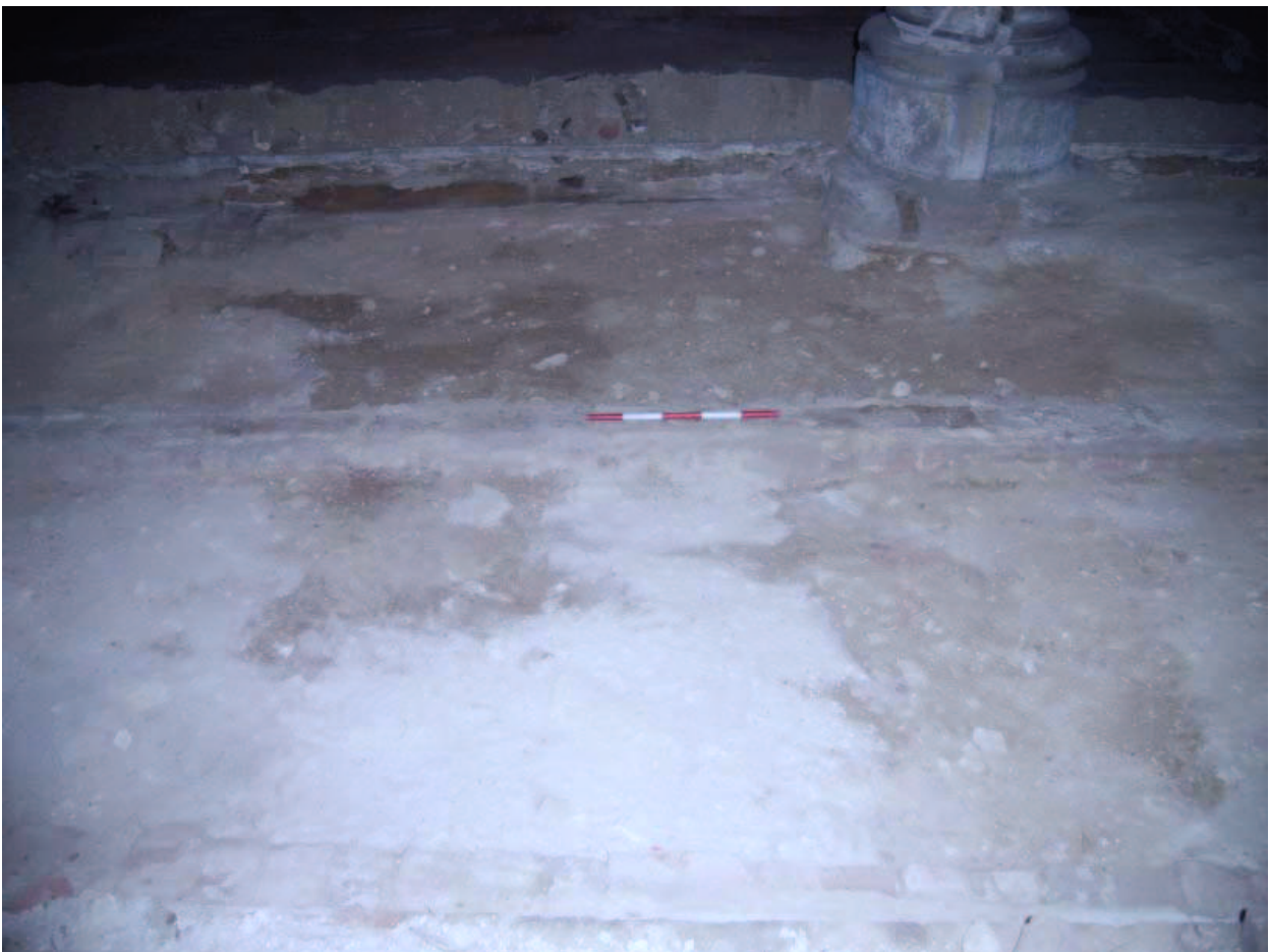
Plate 8: Possible burials in south side of nave, facing south