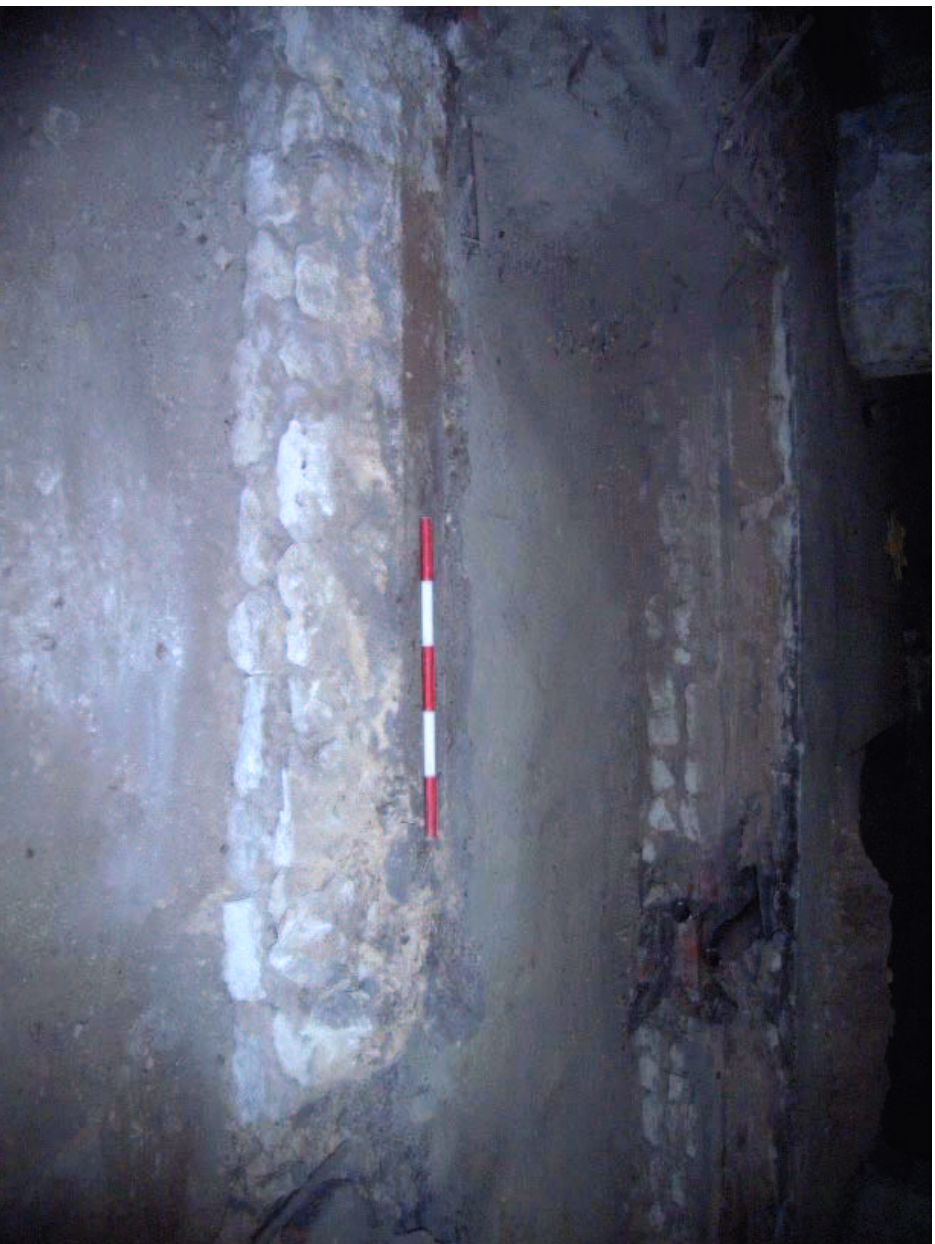
Plate 2: Sleeper wall of north aisle, facing south