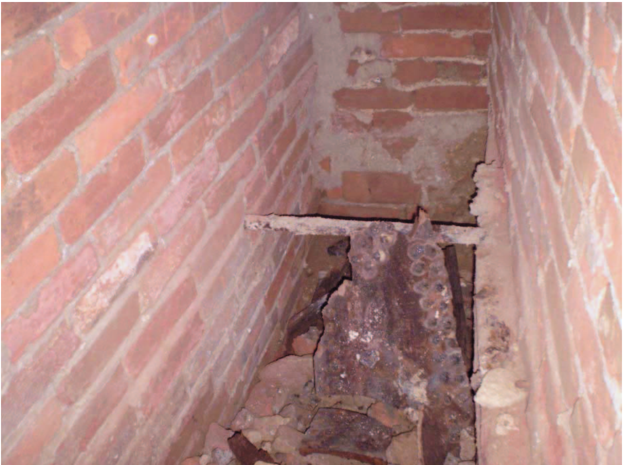
Plate 4: Interior of shaft grave, west end of north side of nave