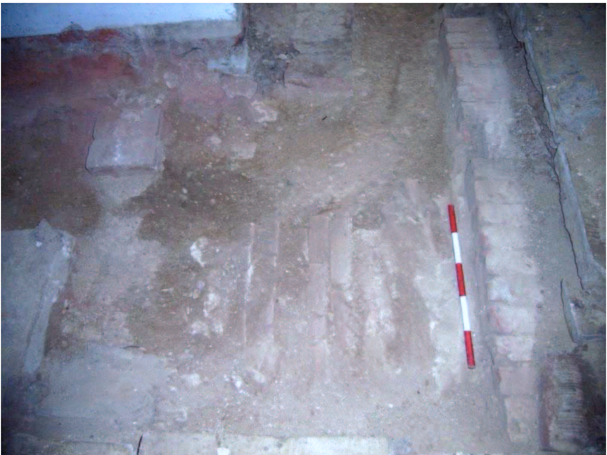
Plate 10: Possible vault at west end of south side of nave, facing west