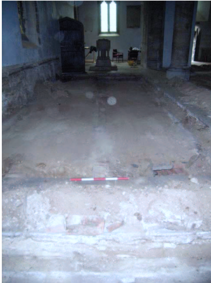
Plate 3: Possible shaft grave in south aisle