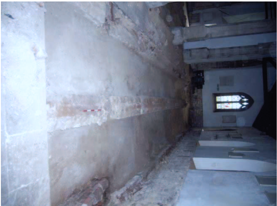
Plate 1: North aisle facing west