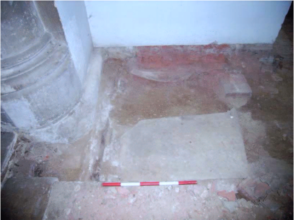
Plate 9: Inscribed slab at west end of south side of nave, facing west