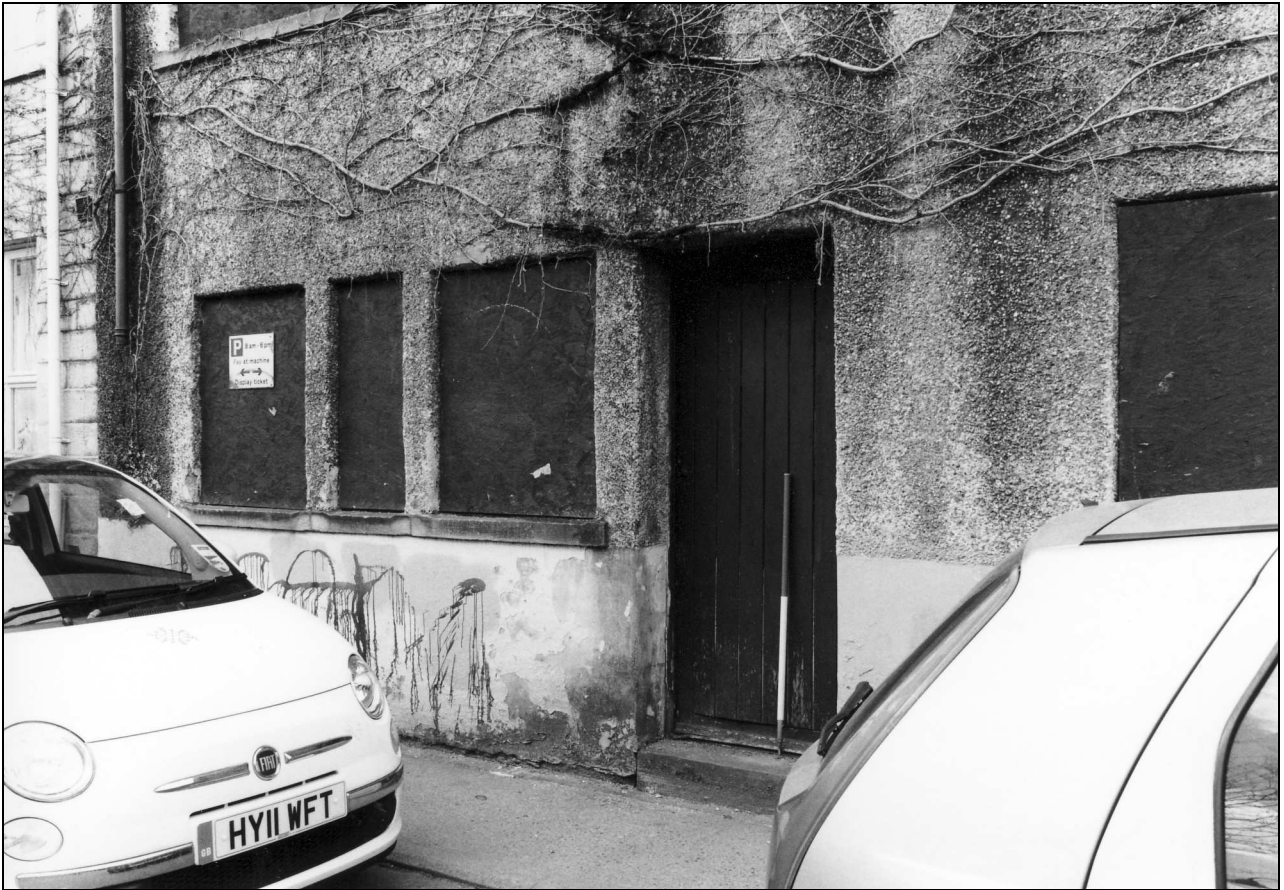
Photo 8: Cottage 1: ground floor openings in front elevation (film 1, film 17)