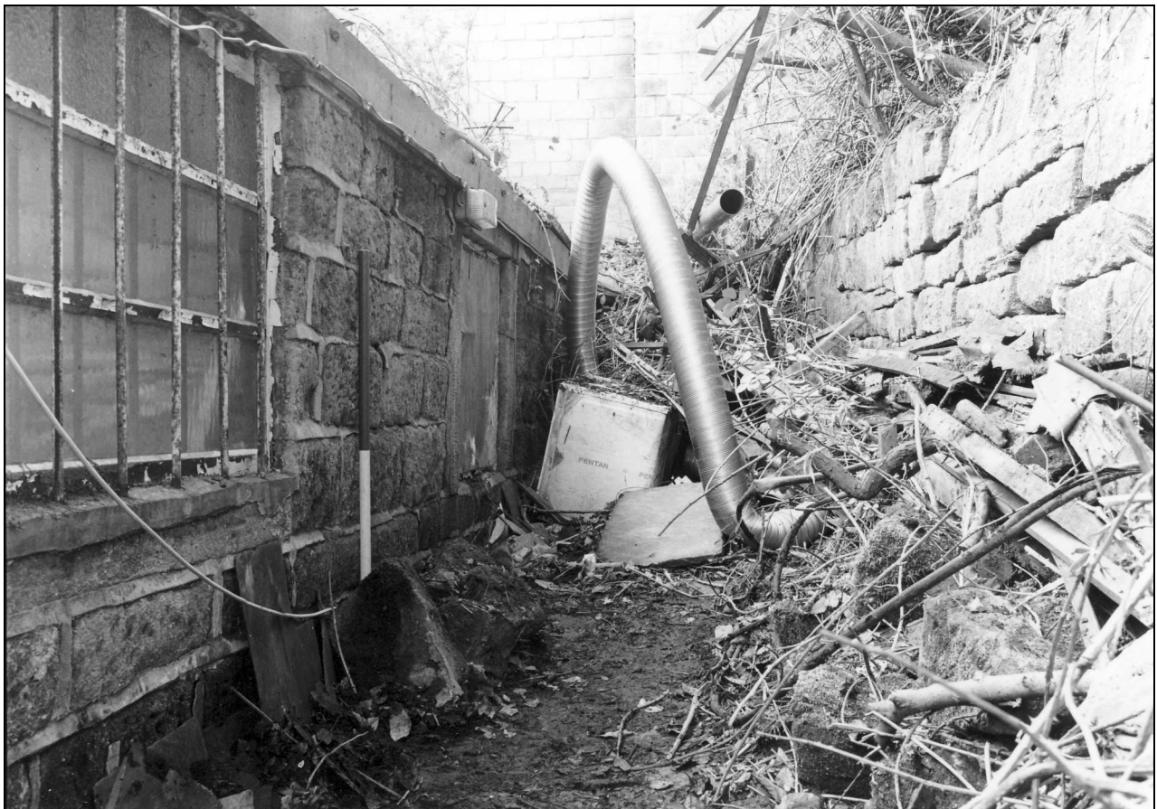
Photo 19: The narrow rear yard behind cottage 2, from the north-east (film 3, film 7)