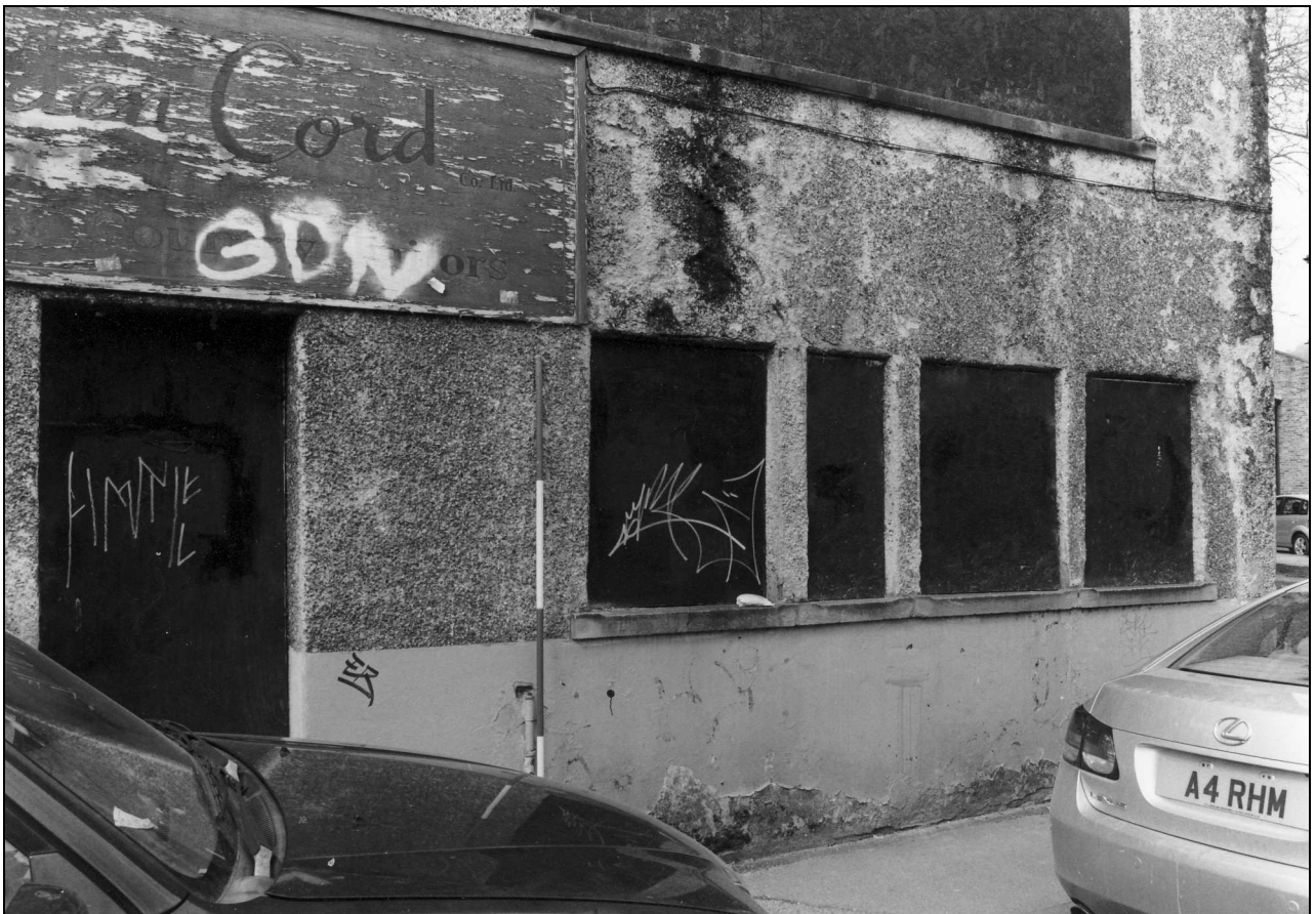
Photo 9: Cottage 4: ground floor openings in front elevation (film 2, film 1)