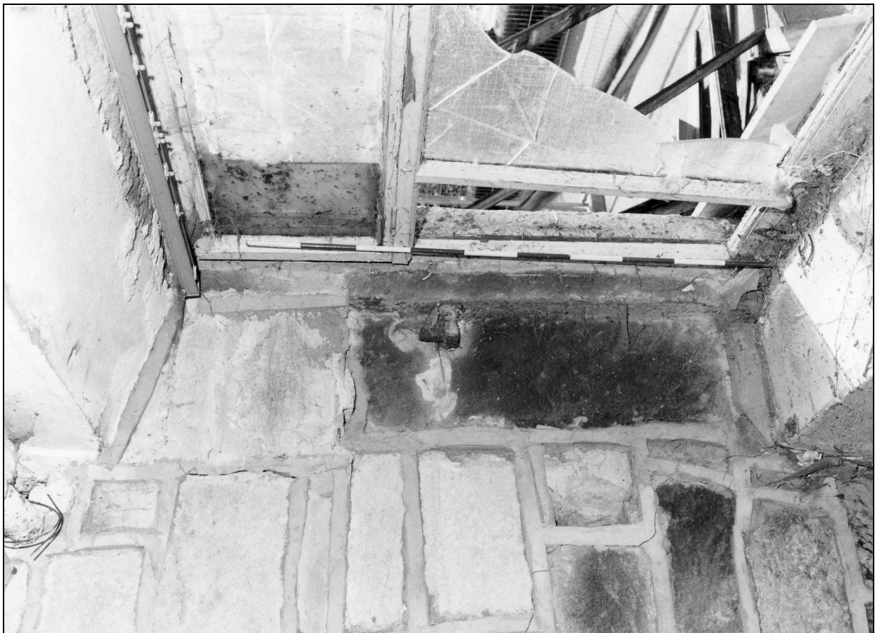
Photo 11: Cottage 2: hinge pintle of former front doorway (film 4, film 6)