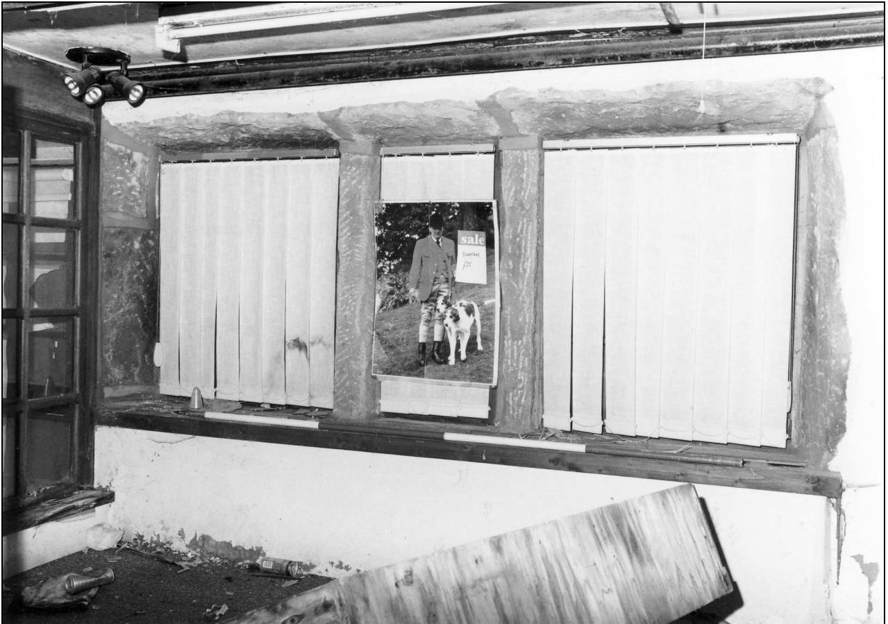
Photo 12: Cottage 2: interior of front ground floor window (film 1, film 3)