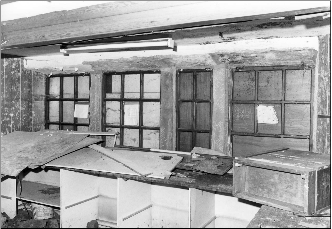
Photo 14: Cottage 4: interior of front ground floor window and former doorway (at left) (film 1, film 9)