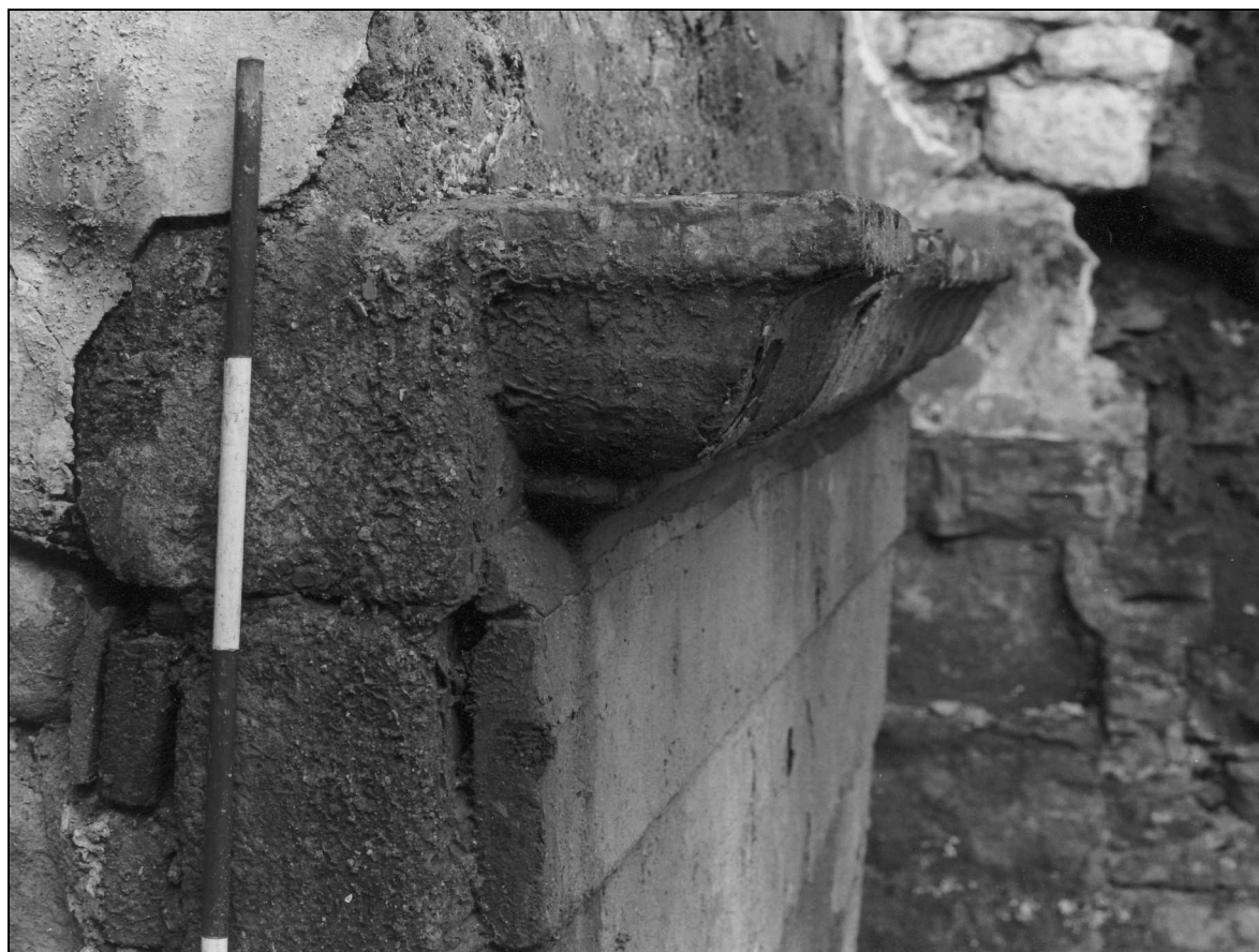
Photo 28: Cottage 1: detail of mantelshelf to ground floor fireplace (film 6, film 8)