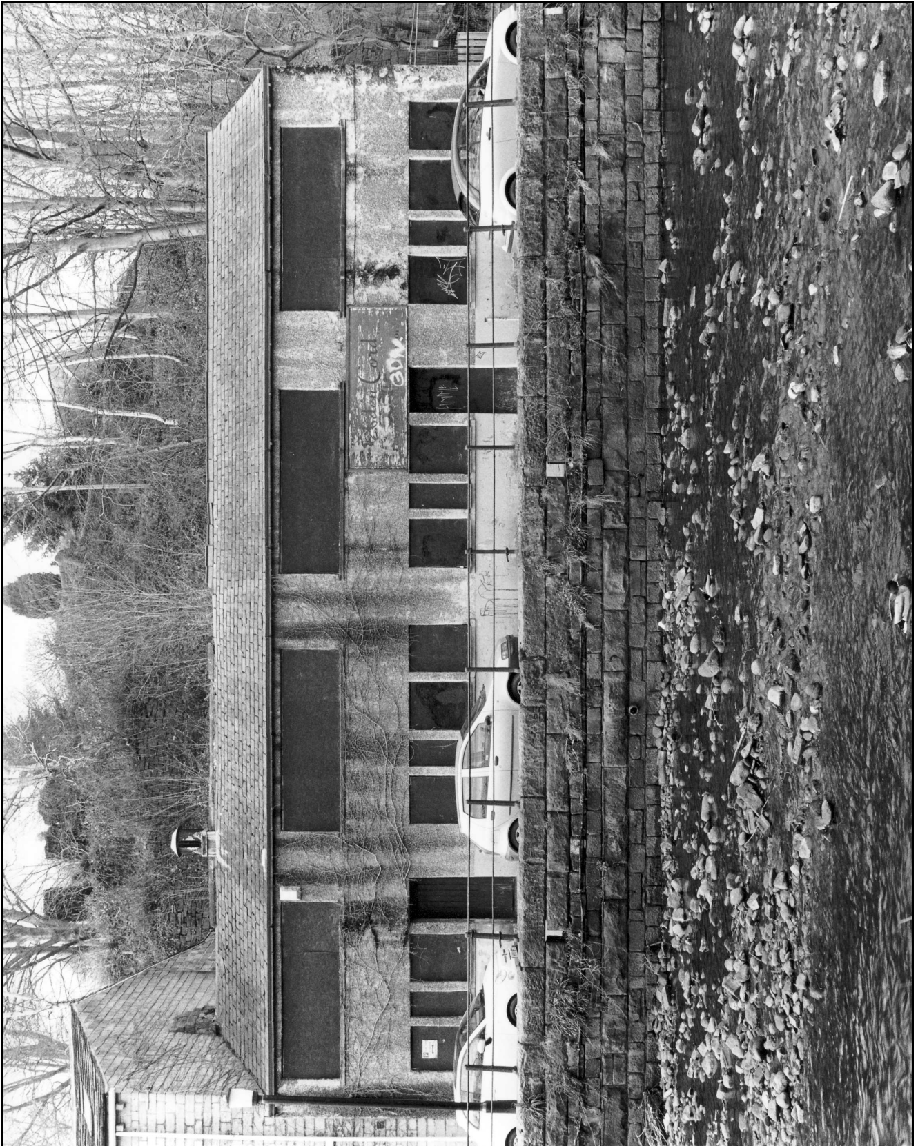
Photo 3: The group of former cottages, from the south-east across the Hebden Water (film 2, film 5)