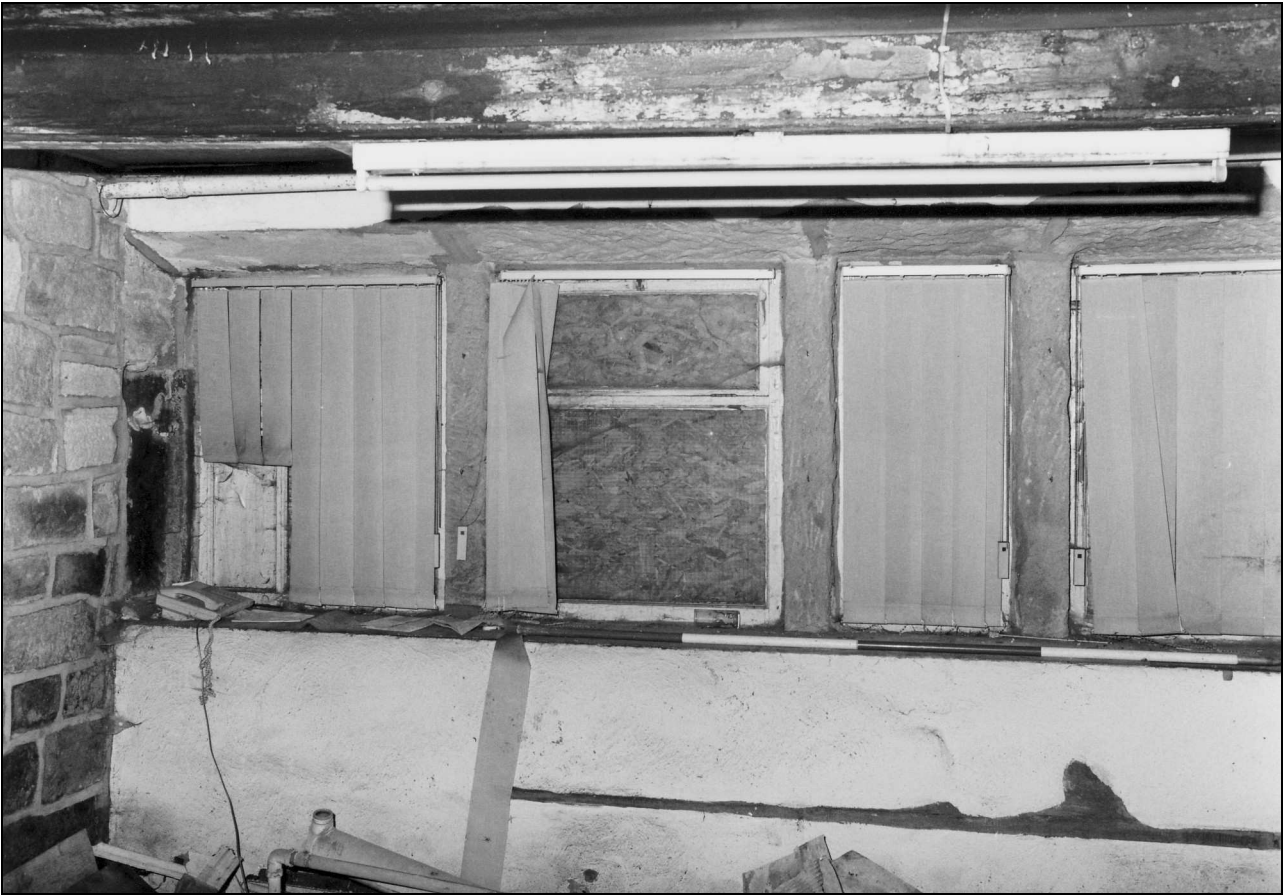
Photo 10: Cottage 2: interior of front ground floor window and former doorway (at left) (film 1, film 1)