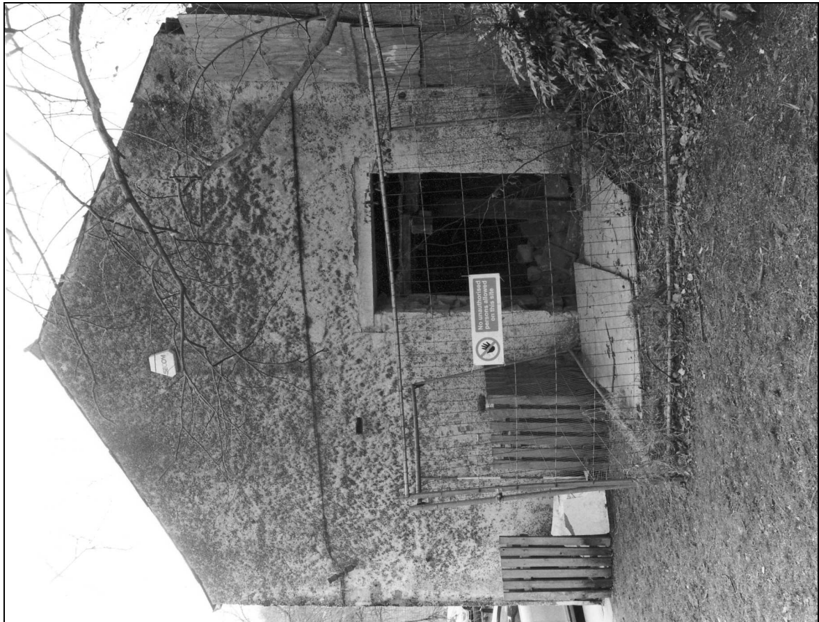
Photo 11: Cottage 2: hinge pintle of former front doorway (film 4, film 6)