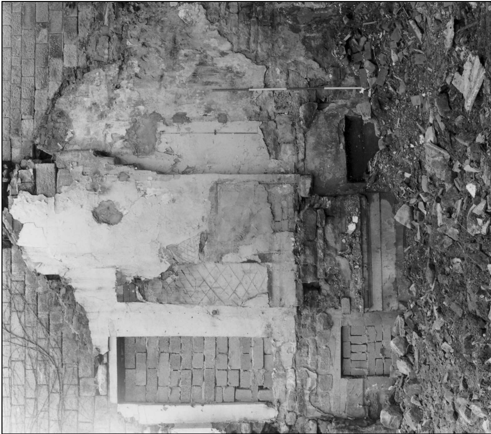
Photo 24: Cottage 1: south-west gable interior, during demolition (film 5, film 4)