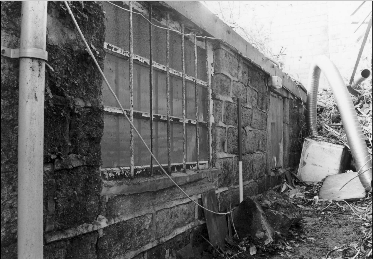
Photo 22: Cottage 3: rear first floor window, inserted 1938 (film 3, film 9)