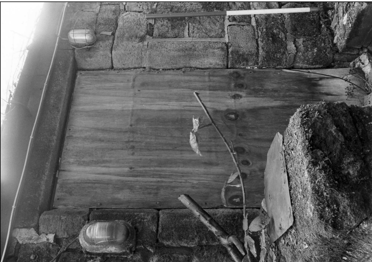
Photo 20: Cottage 3: rear first floor window, altered to doorway (film 3, film 6)