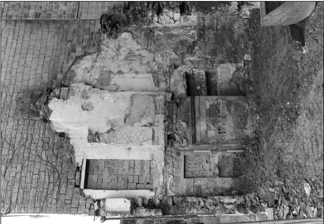
Photo 23: Cottage 1: south-west gable interior, during demolition (film 6, film 1)