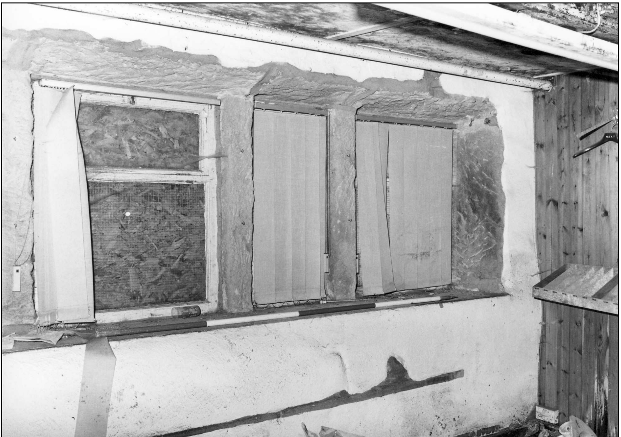
Photo 13: Cottage 3: interior of front ground floor window (film 1, film 5)