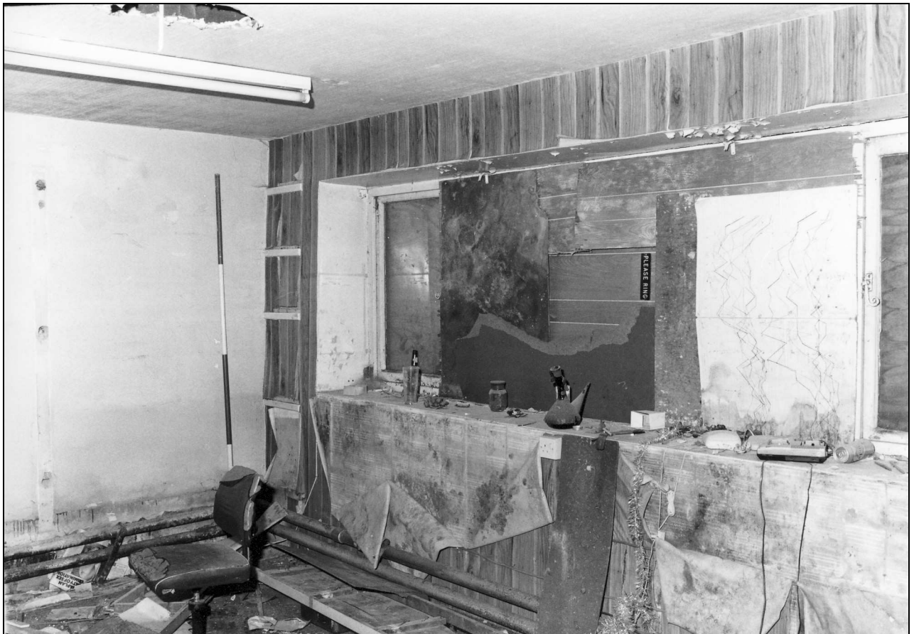
Photo 15: Cottage 4: interior of front first floor window (film 1, film 13)