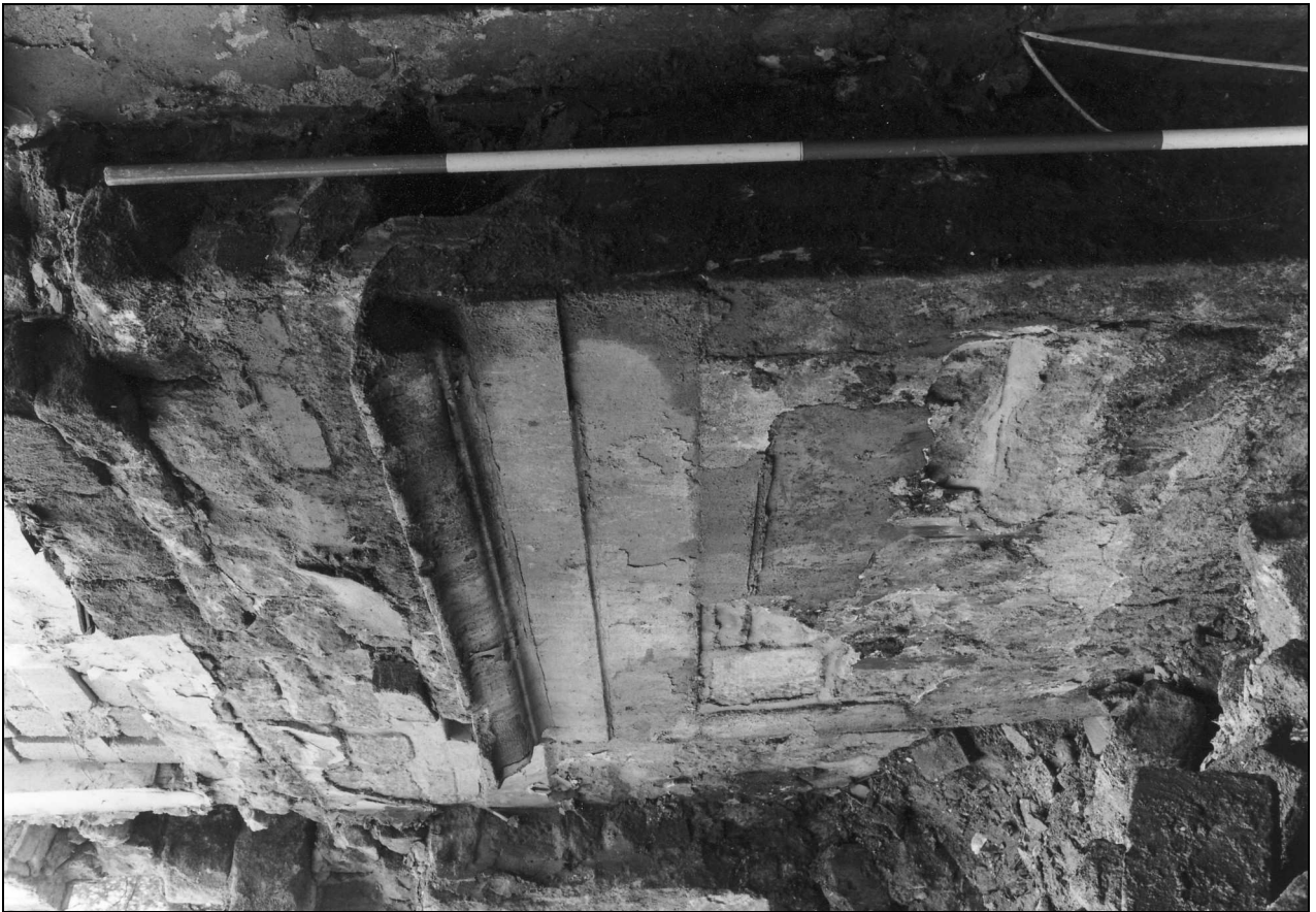
Photo 29: Cottage 1: ground floor fireplace, in south-west gable (film 5, film 15)