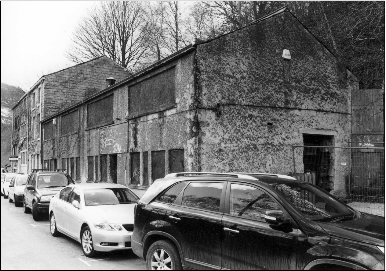
Photo 16: The former cottages, from the north-east (film 1, film 18)