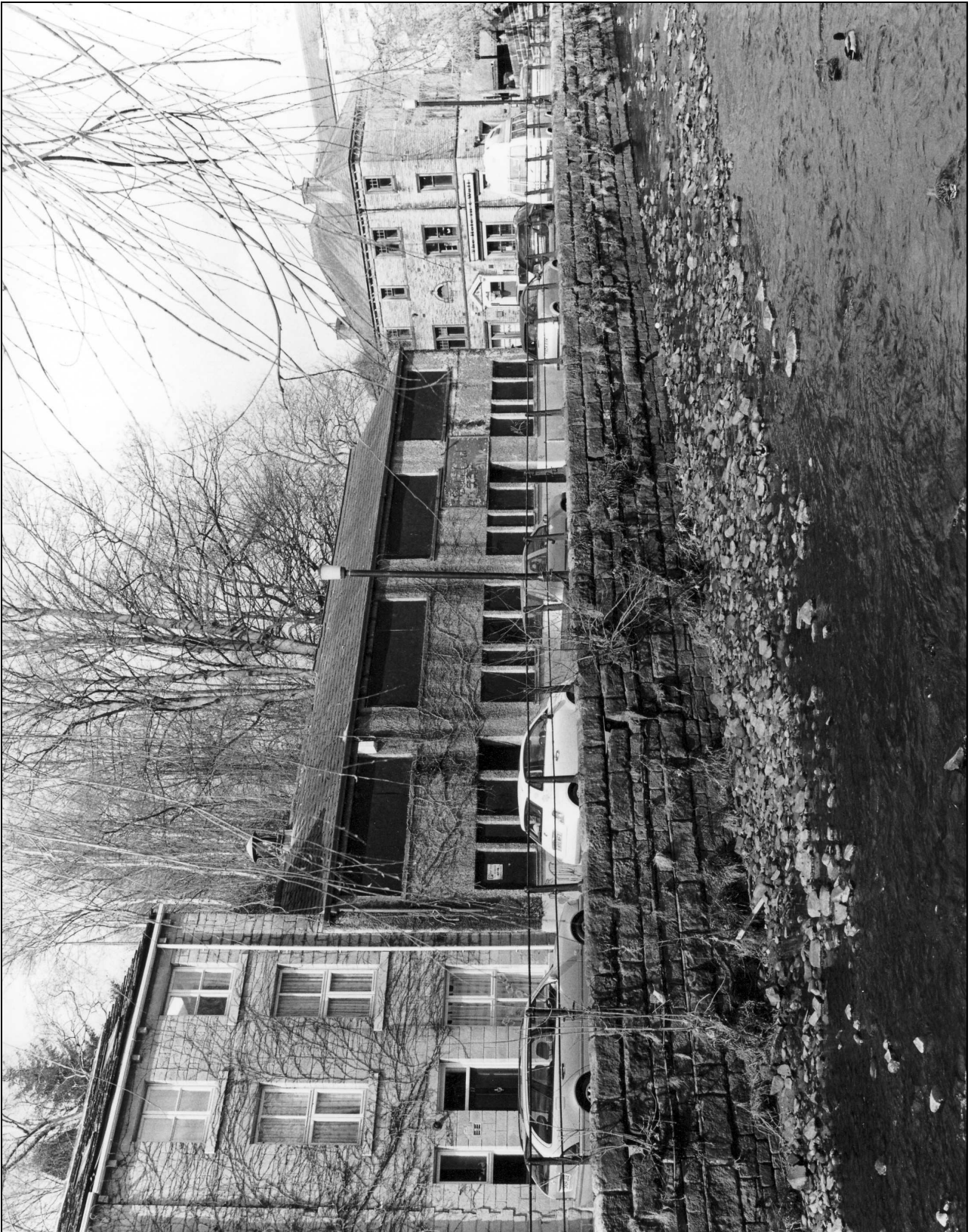
Photo 2: View of the site from the south-east, across the Hebden Water (film 2, film 4)