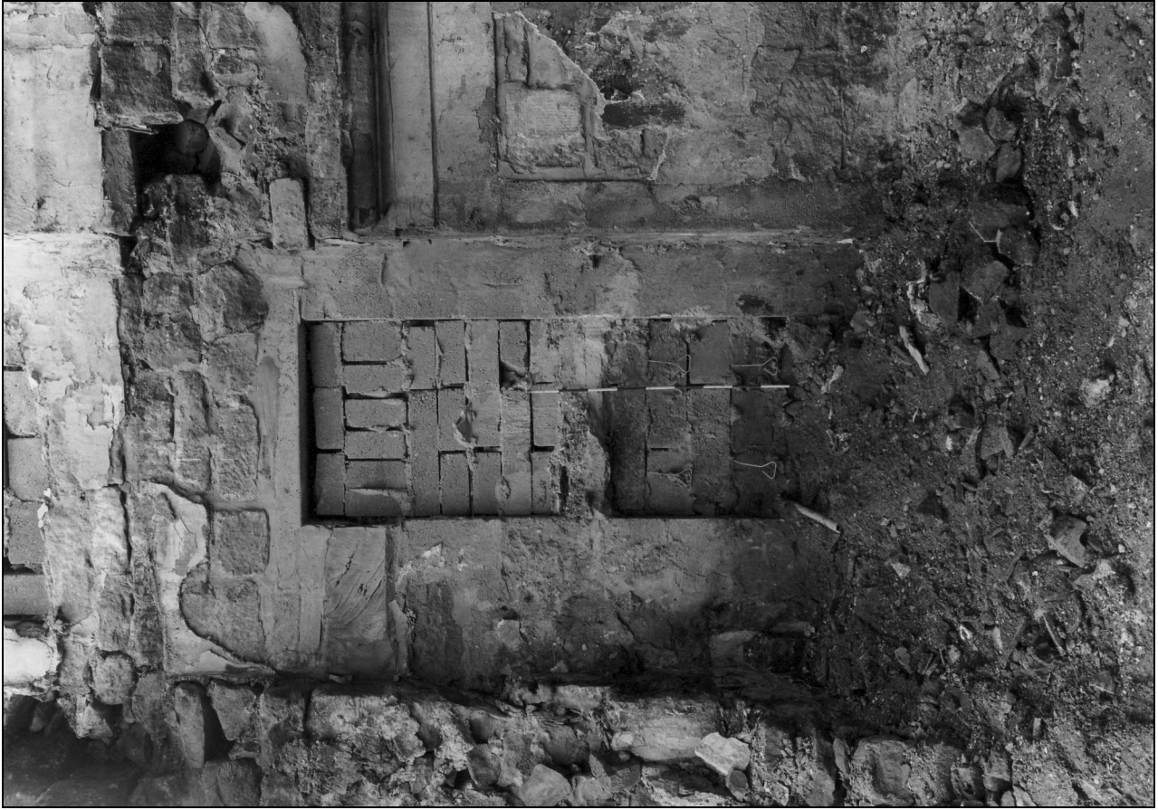
Photo 30: Cottage 1: south-west gable on ground floor, showing remains of oak timber, cut by modern doorway (film 6, film 4)