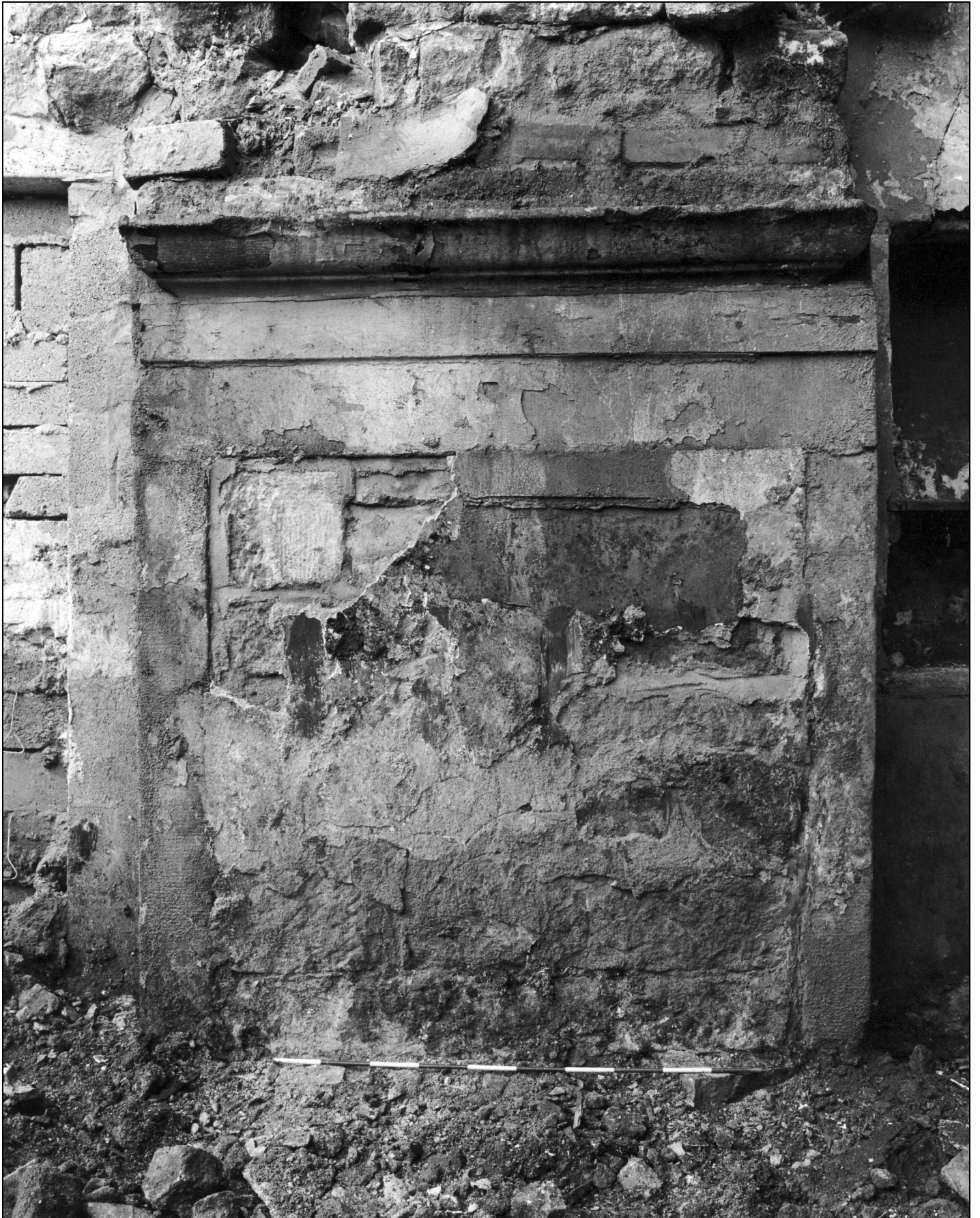
Photo 26: Cottage 1: ground floor fireplace, in south-west gable (film 6, film 2)