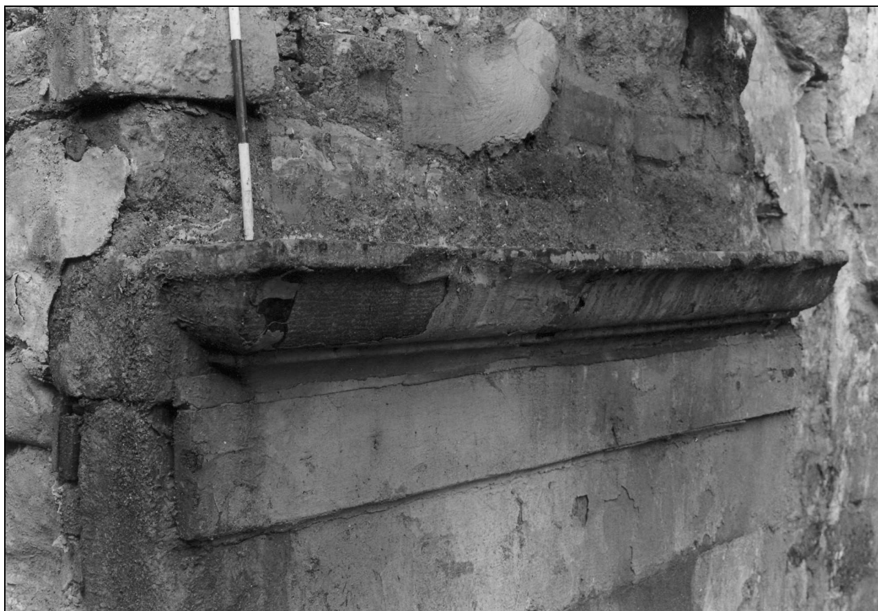
Photo 27: Cottage 1: detail of mantelshelf to ground floor fireplace (film 6, film 7)