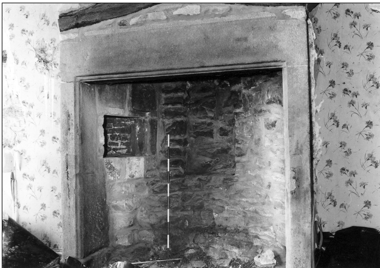
Photo 20: Moulded stone fireplace in west part of house, from the south-west (room 1)