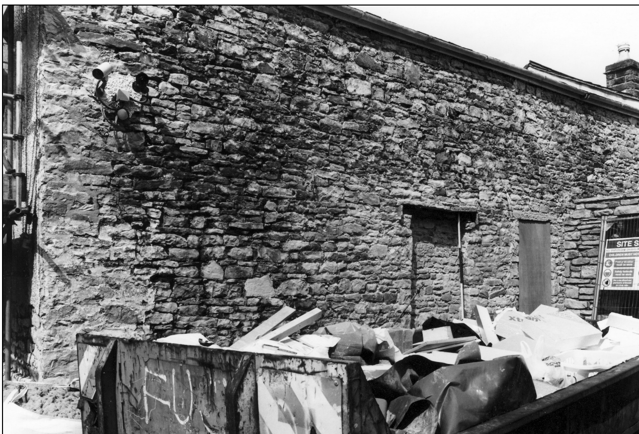
Photo 6: Front elevation of the barn, from the south-west, after removal of render, showing blocked doorway