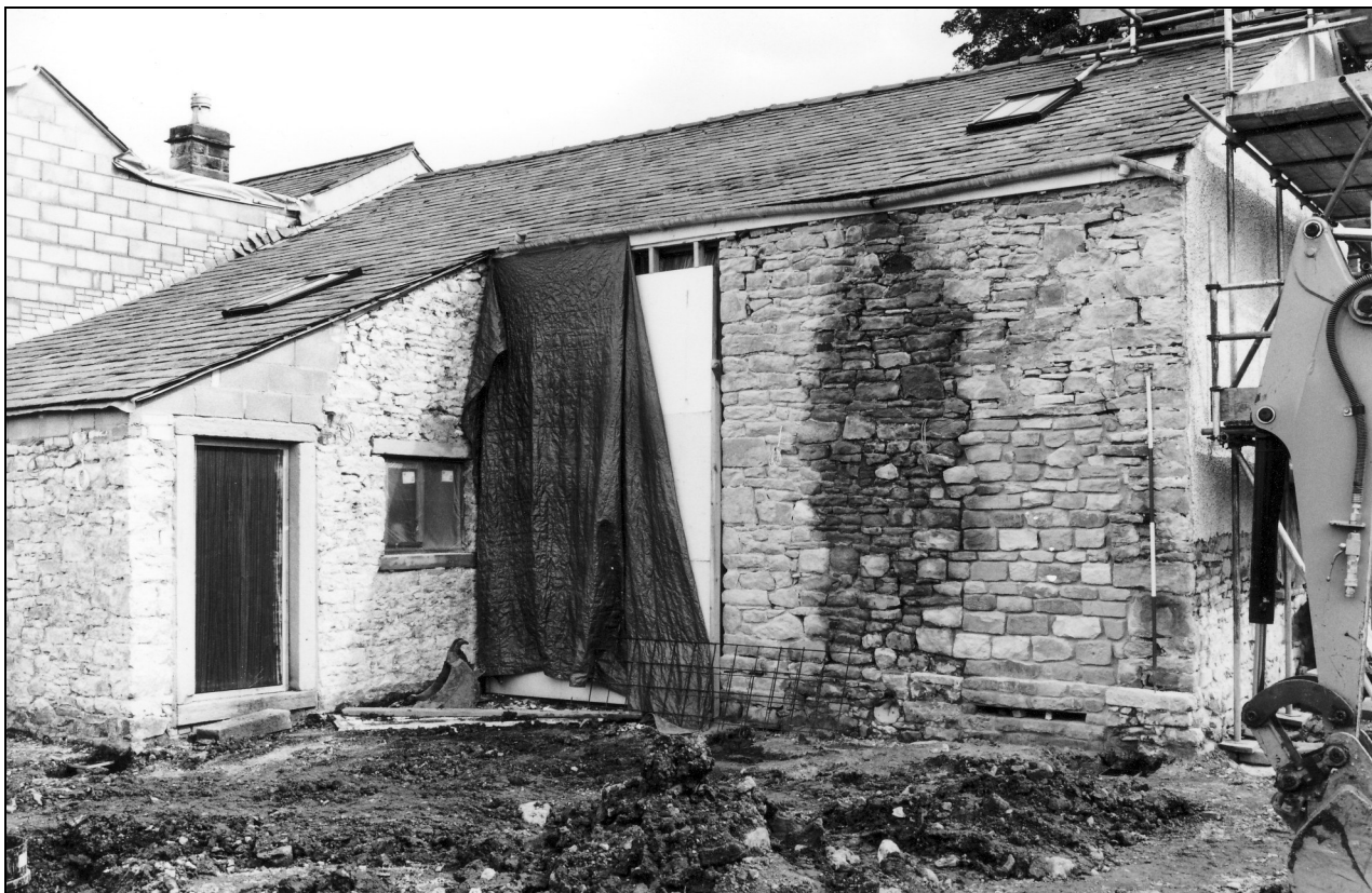
Photo 4: Rear of barn and added shippon, from the north-west, after removal of render