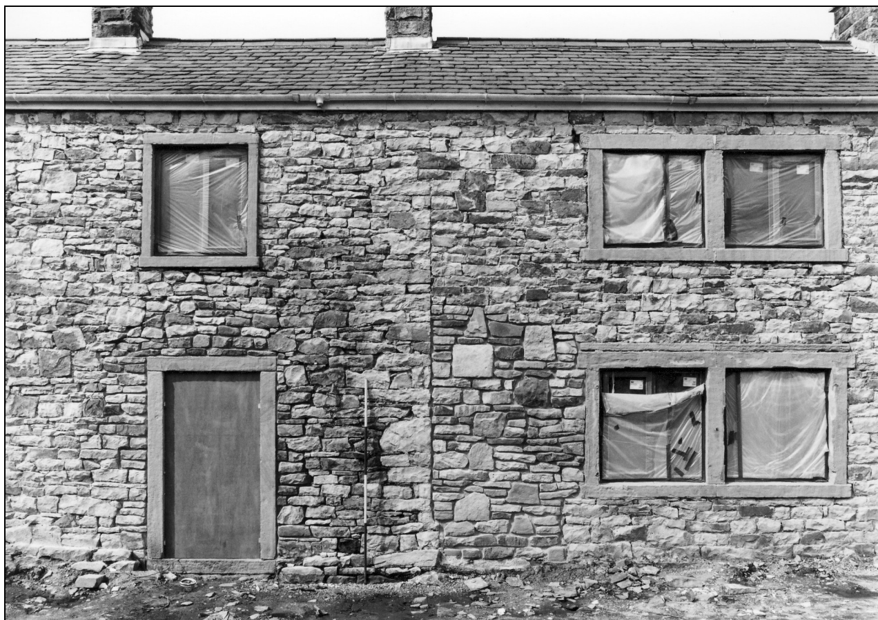
Photo 17: Straight joint in front elevation of house, after removal of render