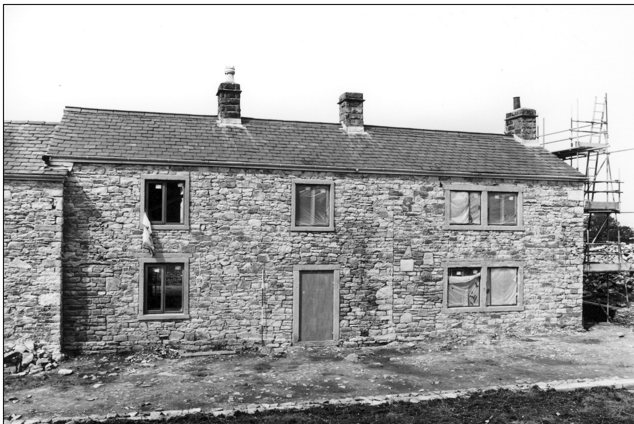
Photo 15: Front elevation of the house, from the south, after removal of render