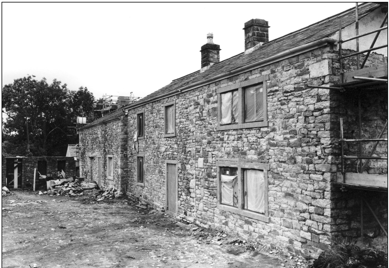
Photo 26: Front elevation of the range, from the south-east, after removal of render