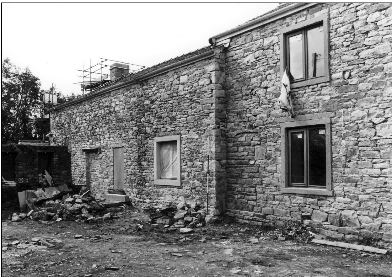
Photo 8: Front elevation of the barn and adjoining earlier part of house, from the south-east, after removal of render