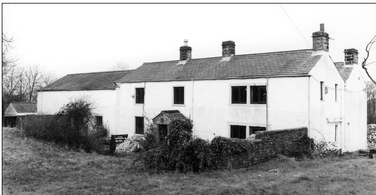
Photo 16: The buildings, from the south-east, before removal of render