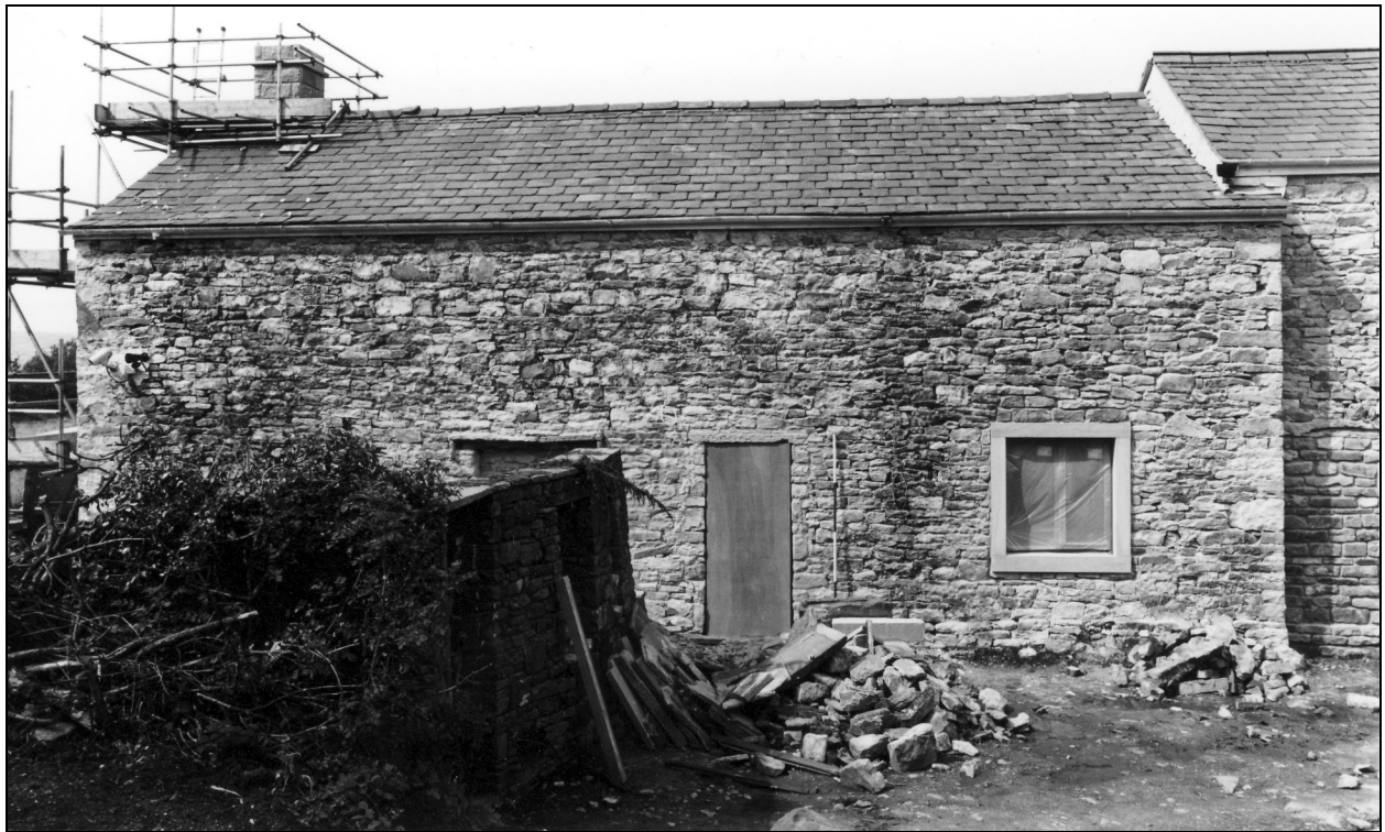
Photo 2: Front elevation of the barn, from the south, after removal of render