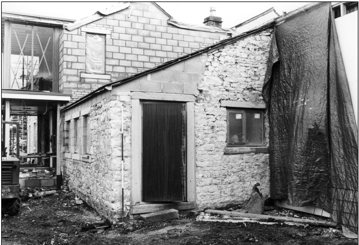
Photo 35: Added shippon at rear, from the north-west, after removal of render etc