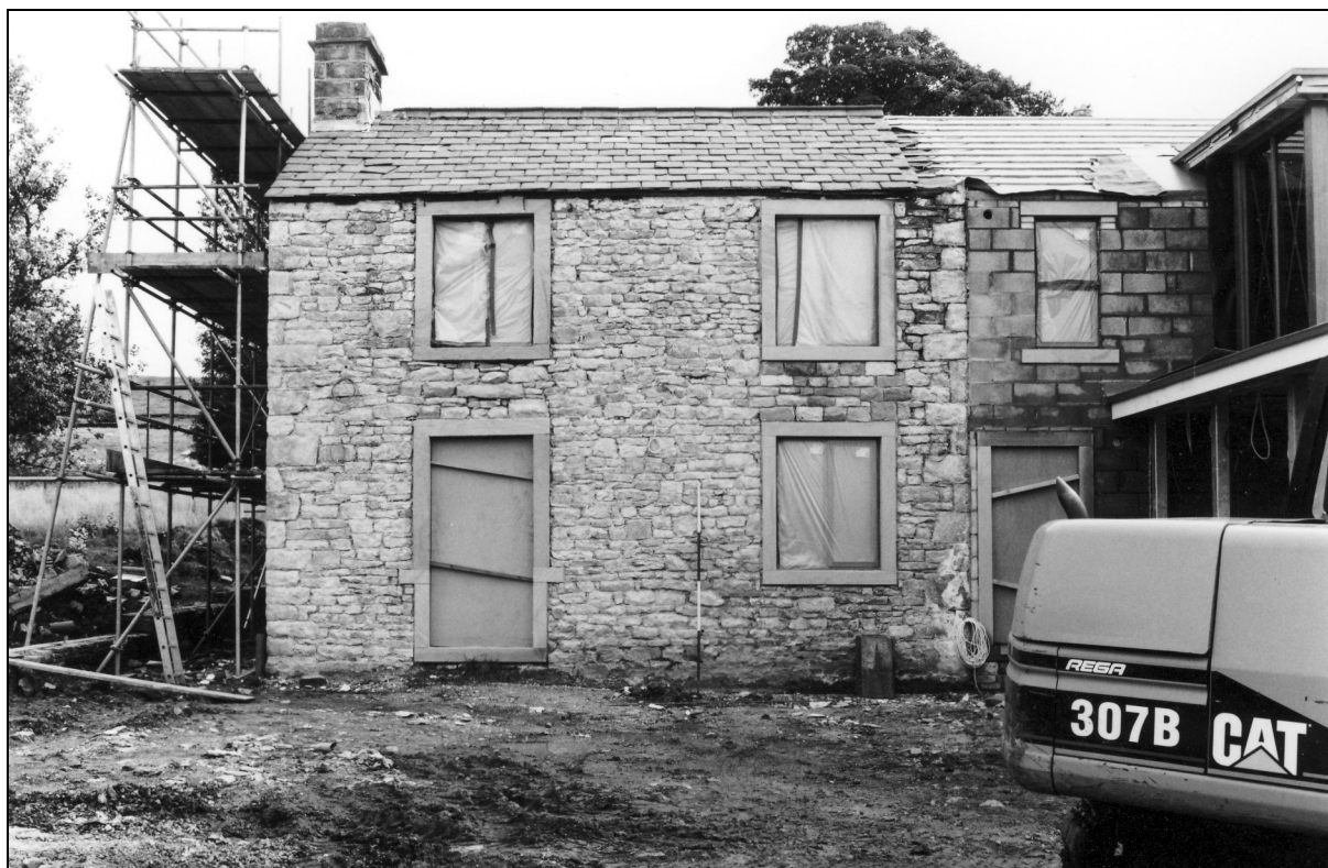
Photo 31: Rear elevation of 19th century rear part of house, after removal of render