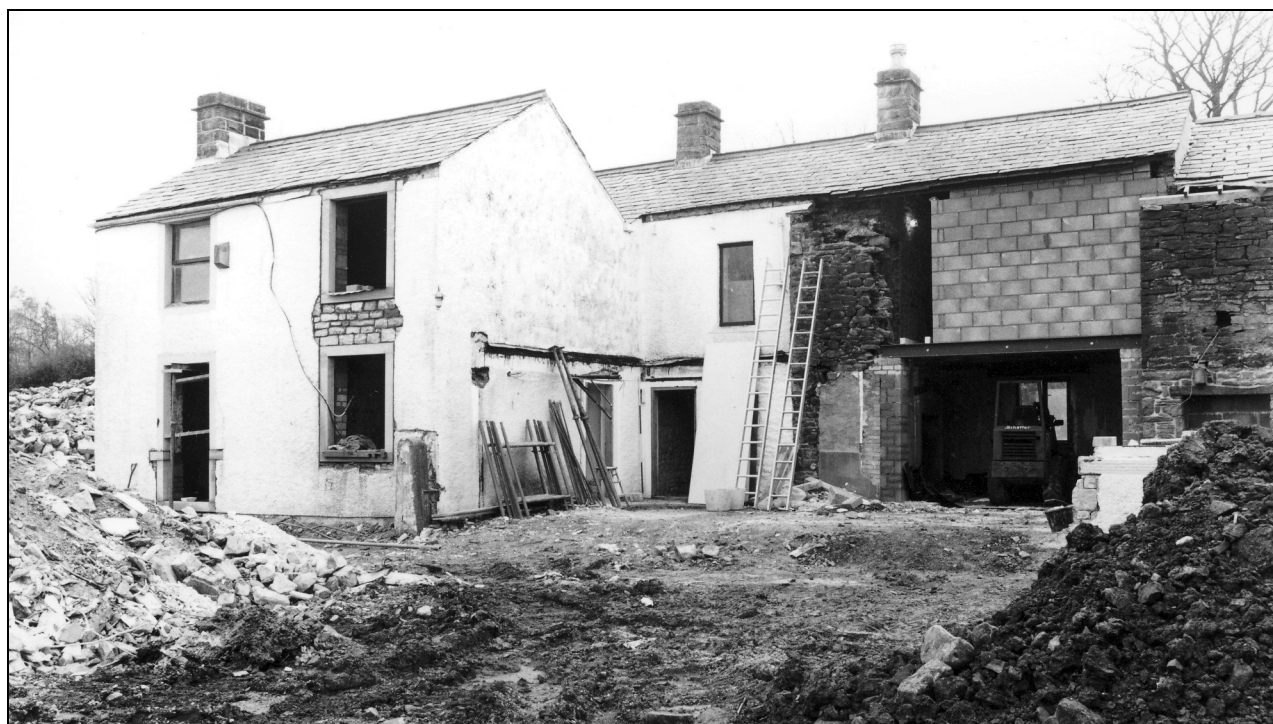
Photo 30: Rear elevation of house etc, from the north-west, before removal of render