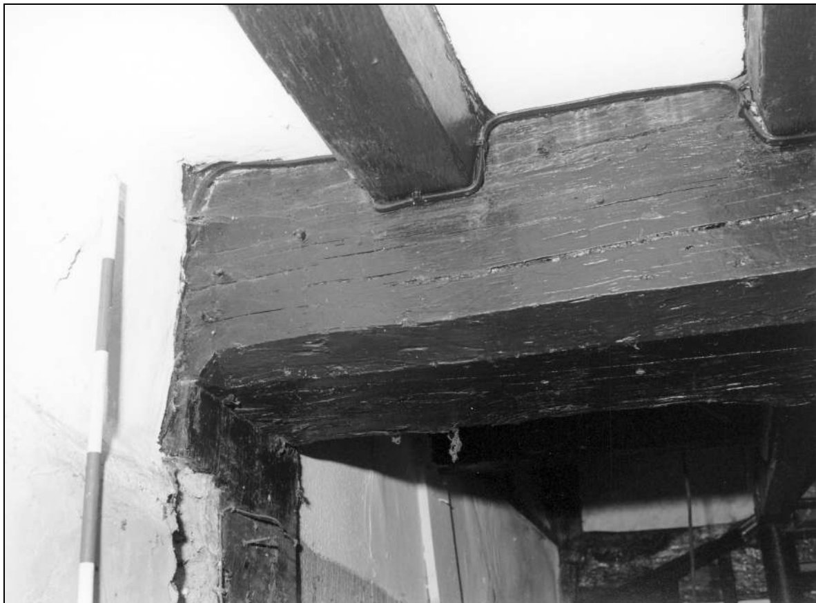
Photo 18: Detail of chamfer and stop, to west end of cross beam over ground floor