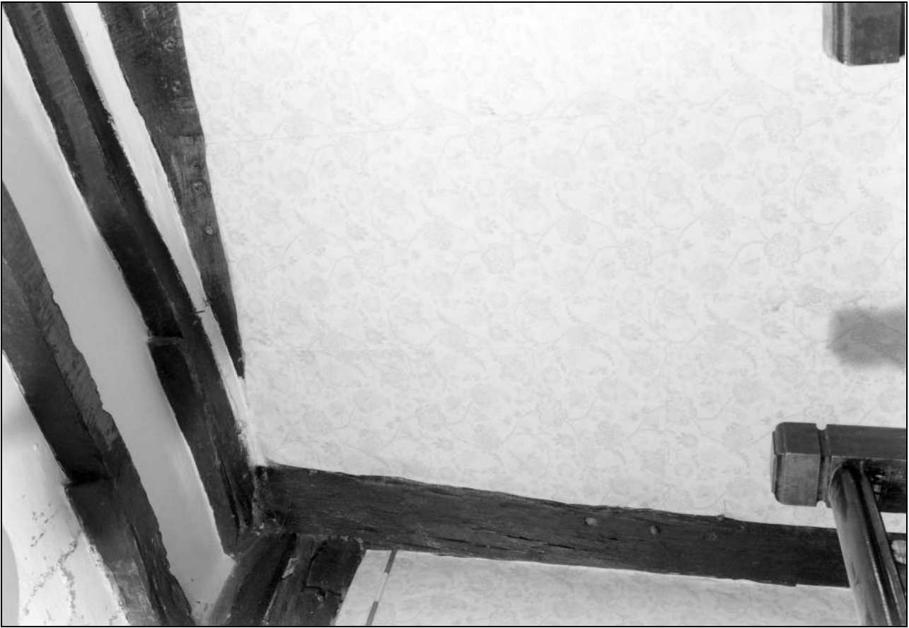
Photo 24: First floor: north-west wall post and tie beam with brace pegs, to right