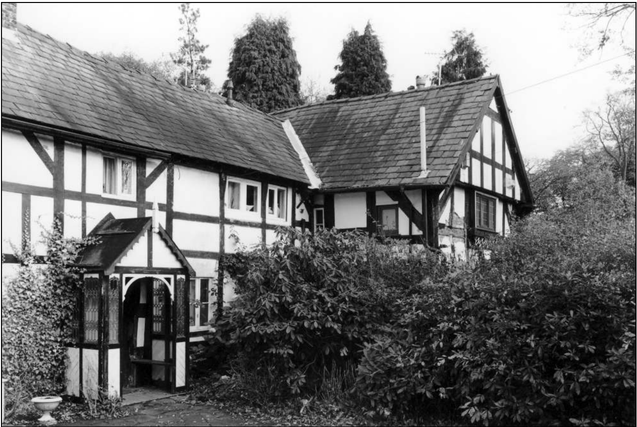
Photo 5: The east part of the Hall, and the east wing, from the south-west