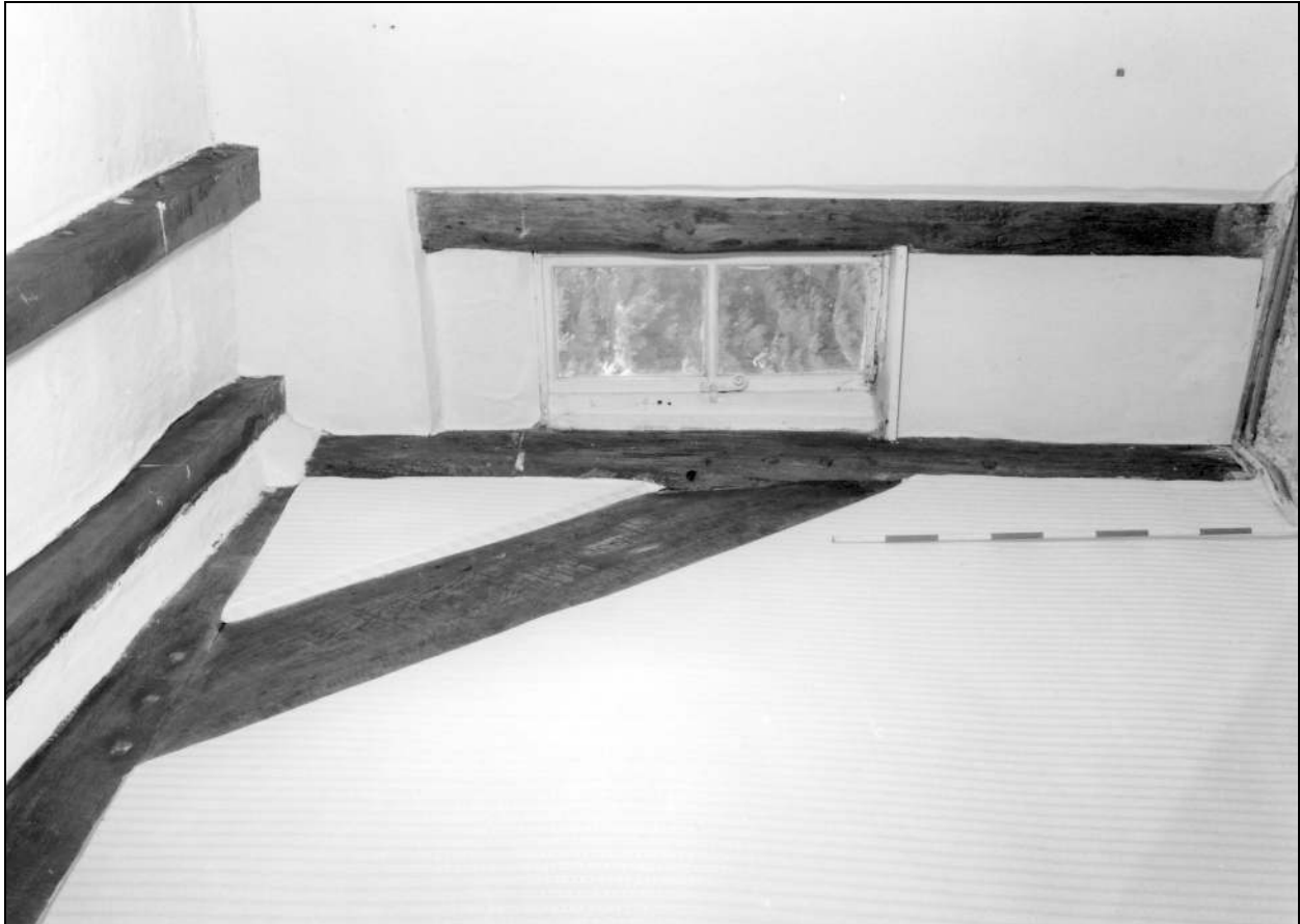
Photo 23: First floor: north-east wall post and brace, with stud and 19th century window to right