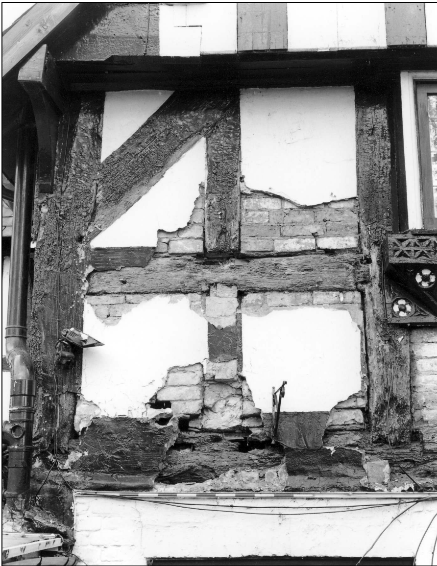
Photo 11: Detail of timber framing on front elevation of east wing