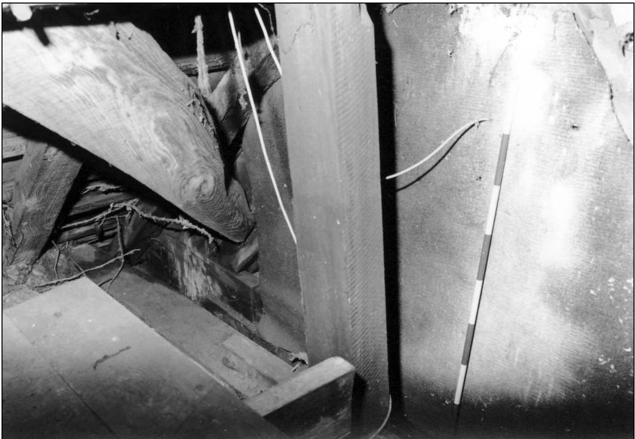
Photo 14: Wind brace at south-east corner, with modern timbers beyond (nothing of the original south truss appears to survive)