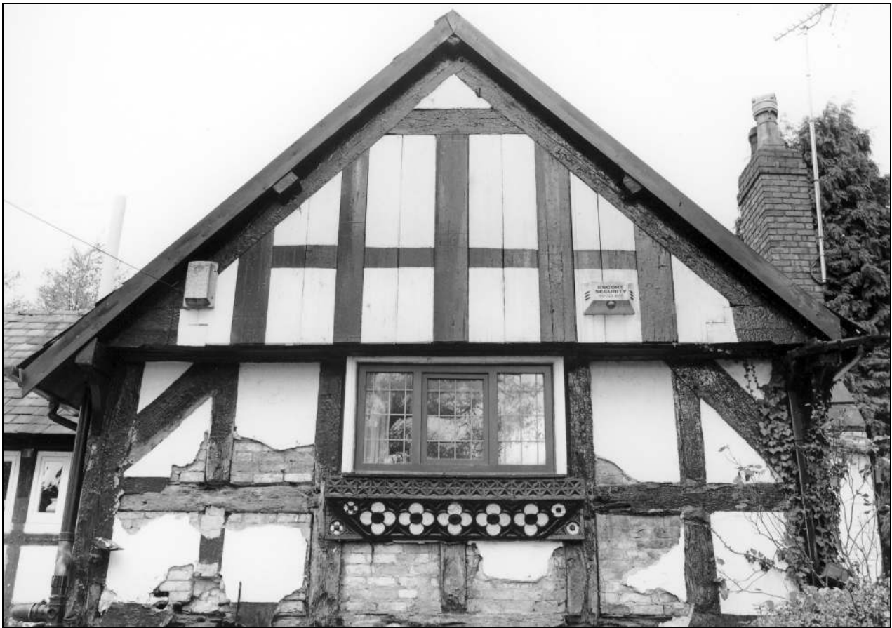
Photo 13: East wing: upper part of front elevation: the projecting gable is mostly of modern timber