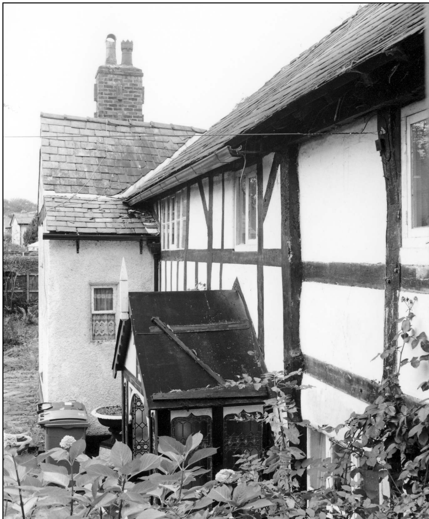
Photo 6: The front elevation of the main range, from the east wing