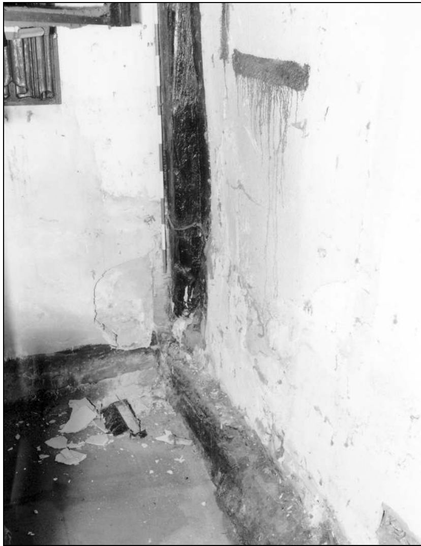
Photo 21: Detail of stone plinth and remnant of sill beam (on which the scale rests), at north-west corner of ground floor