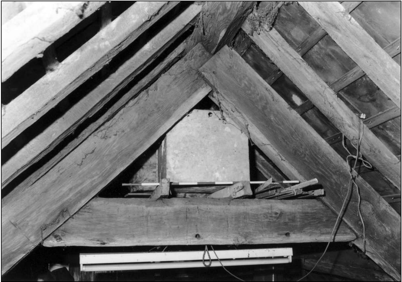
Photo 19: Collar and ridge of truss over middle of no.247, from the north