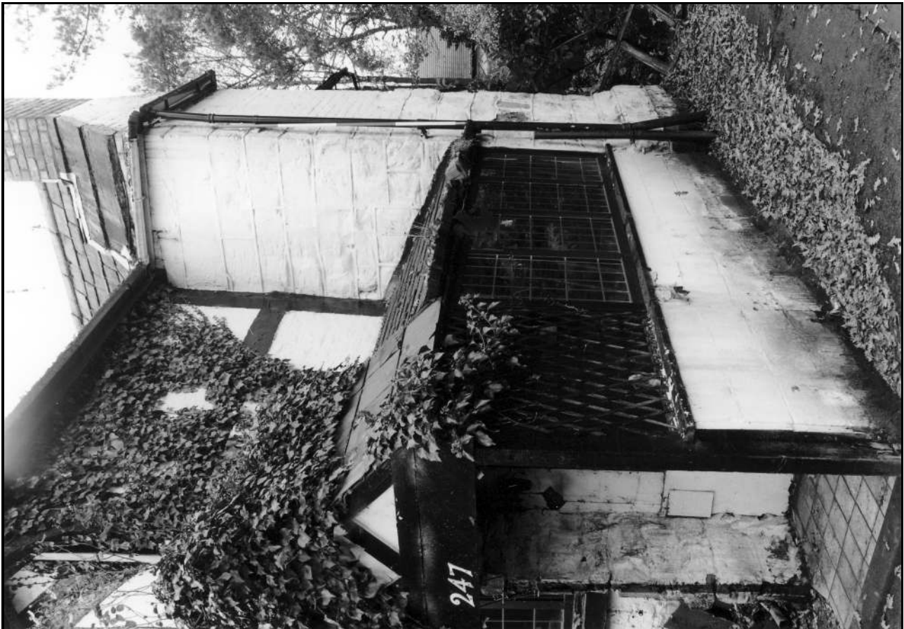
Photo 15: East wing: south part of east elevation and chimney stack. from the south-east