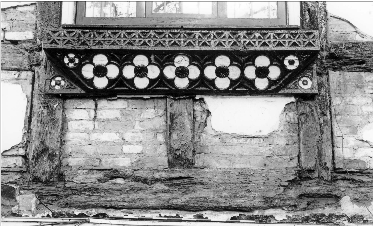
Photo 12: Detail of carved timber frieze on front elevation of east wing