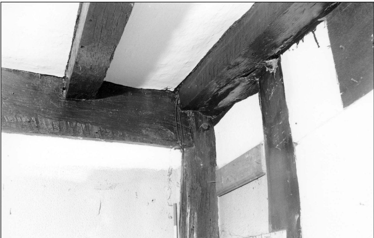
Photo 22: Detail of joint of first floor beam with post, at north-east corner of ground floor