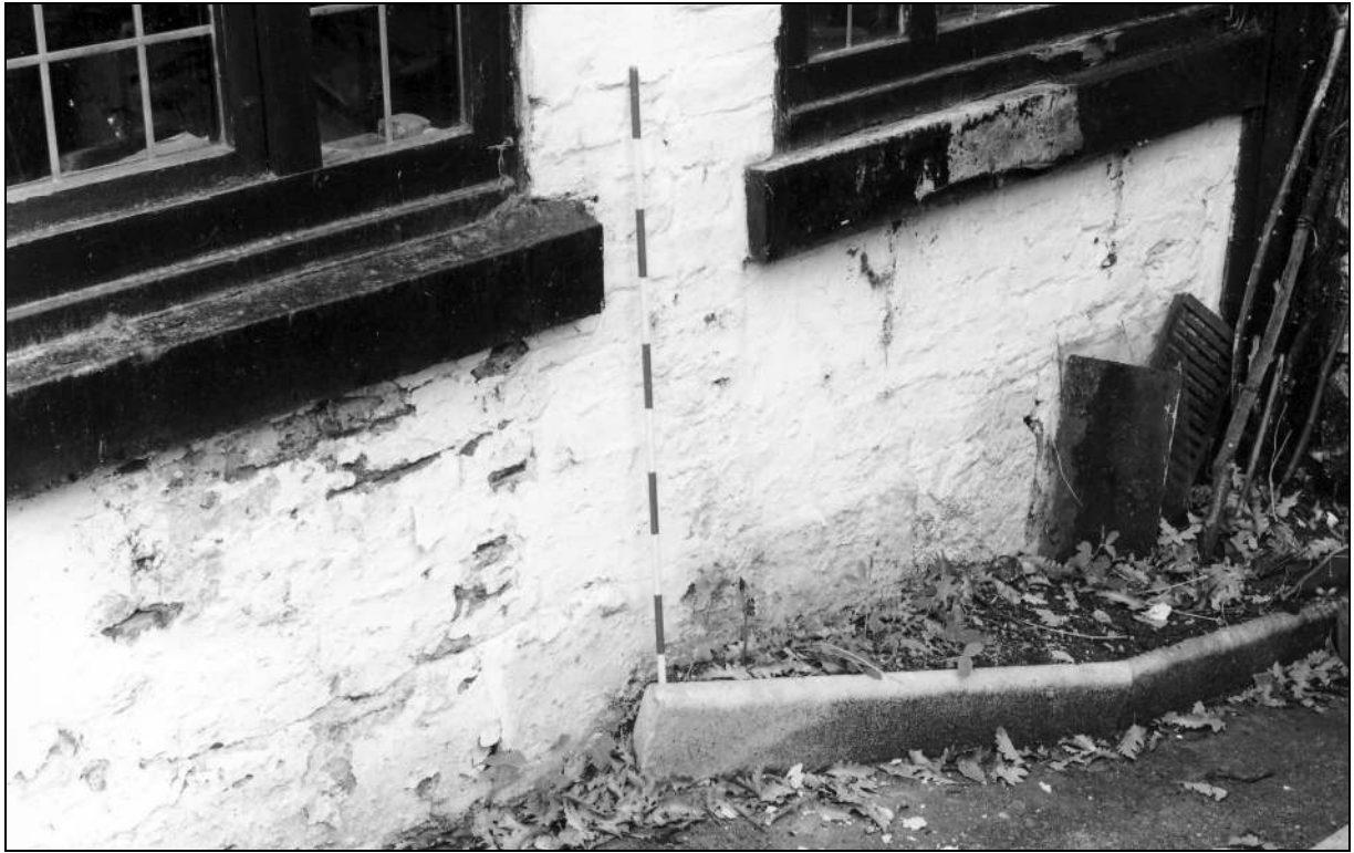
Photo 7: Detail of stone plinth at foot of east wing, front elevation