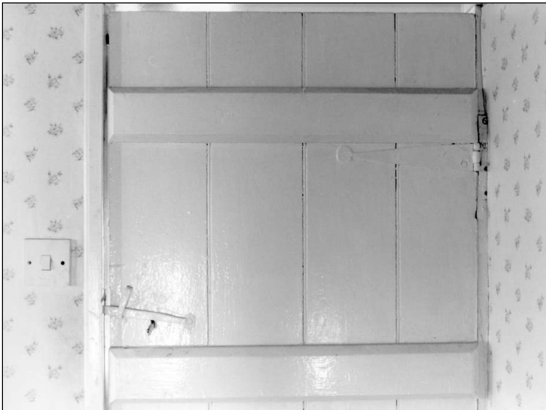
Photo 48: Detail of construction and furniture of 19th century door to main bedroom