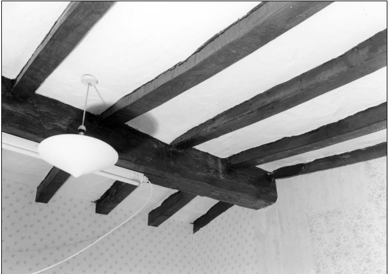
Photo 43: First floor: spine beam and ceiling joists over main room, from the south-east