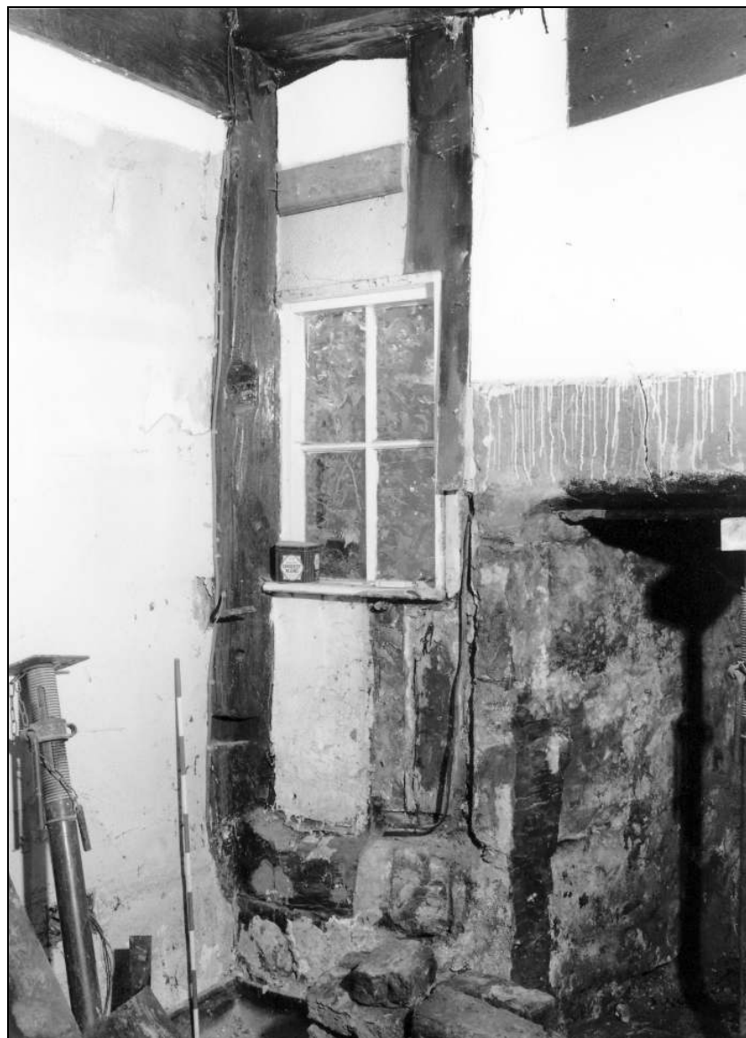
Photo 34: Detail of post and stud at north-east corner of ground floor