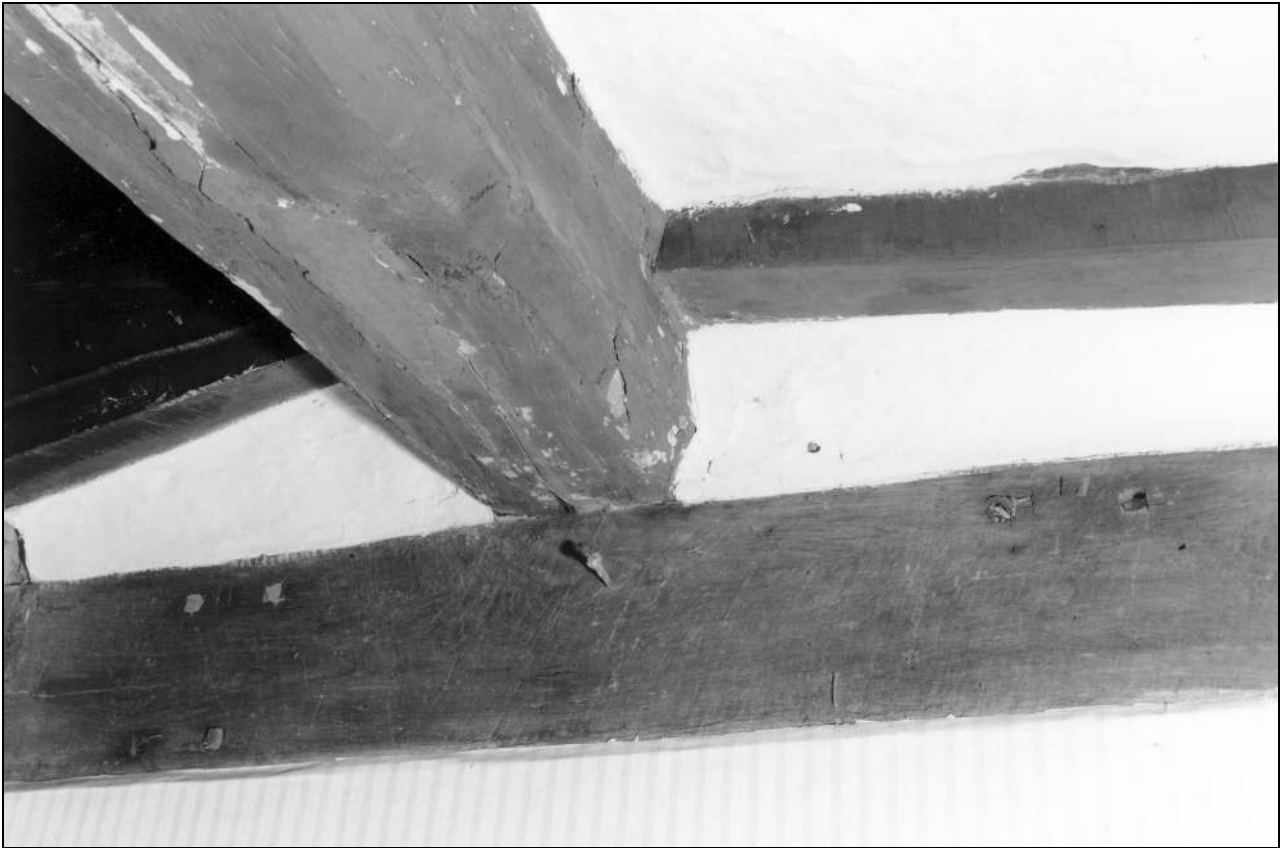
Photo 25: First floor: north end of spine beam, resting on tie beam of truss, with pegs and numbering of struts to each side