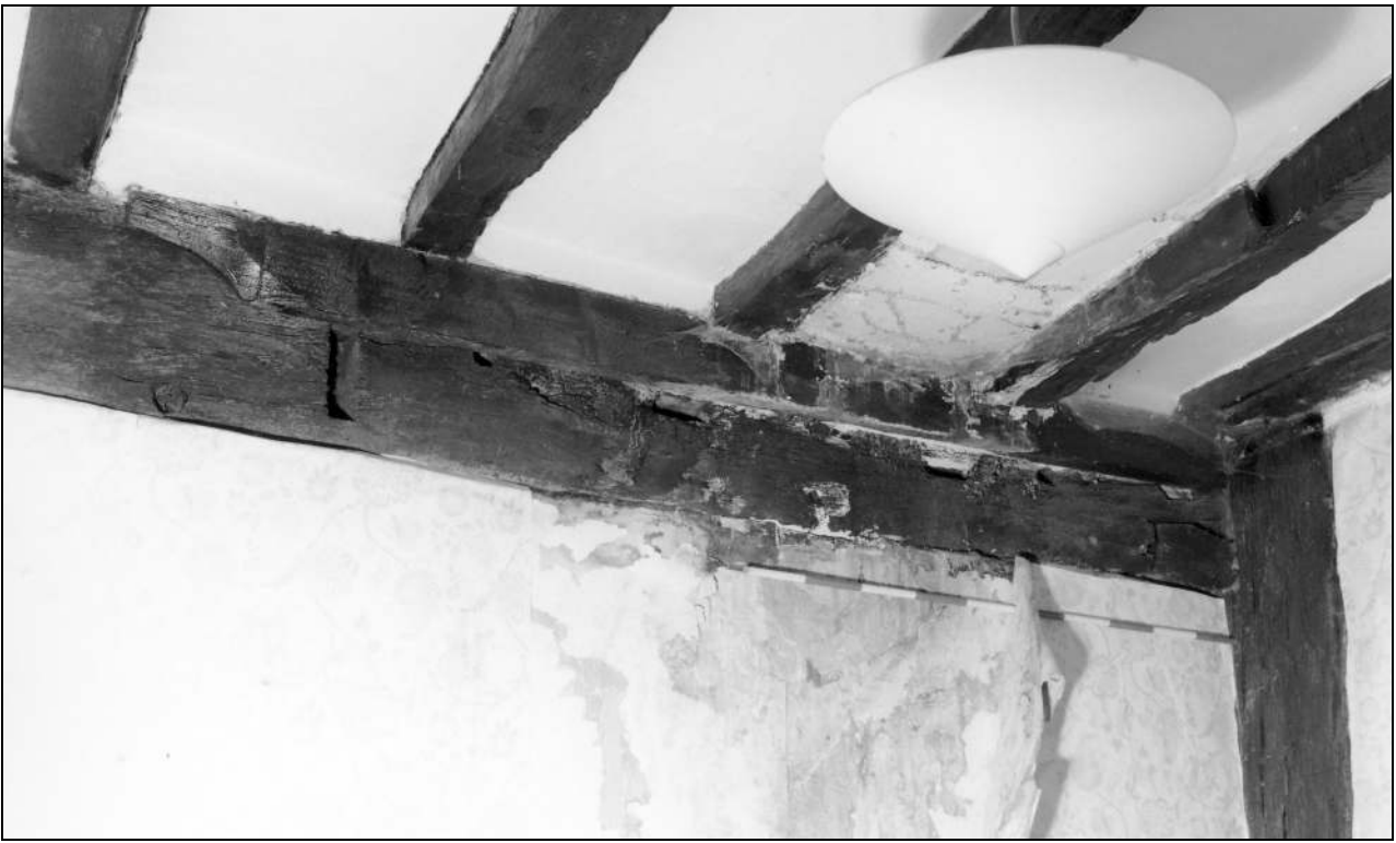
Photo 39: First floor: internal view of west wall plate, showing slot at left and joint with wall post at right