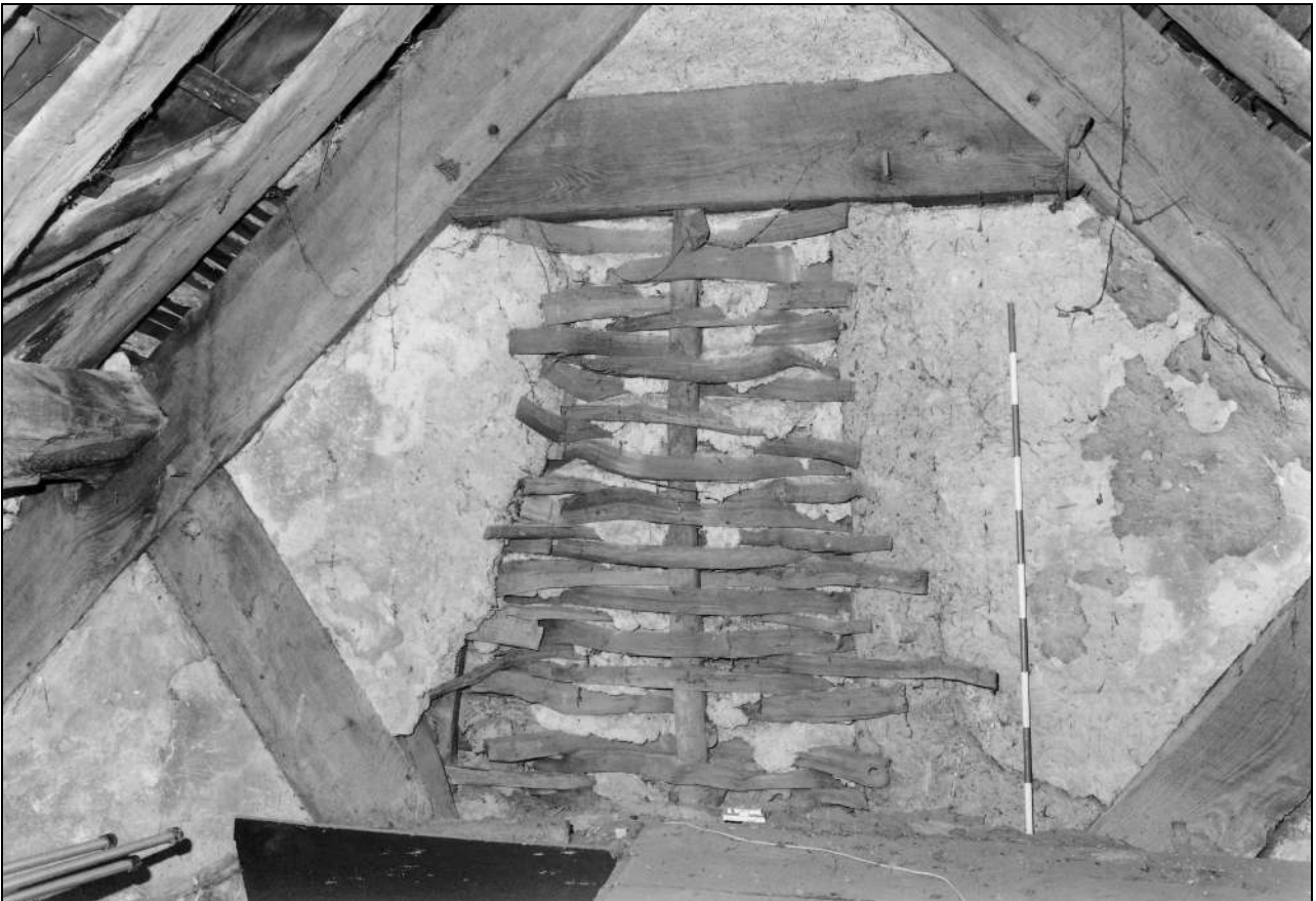
Photo 26: Wattle and daub infill, within truss forming north side of no.247