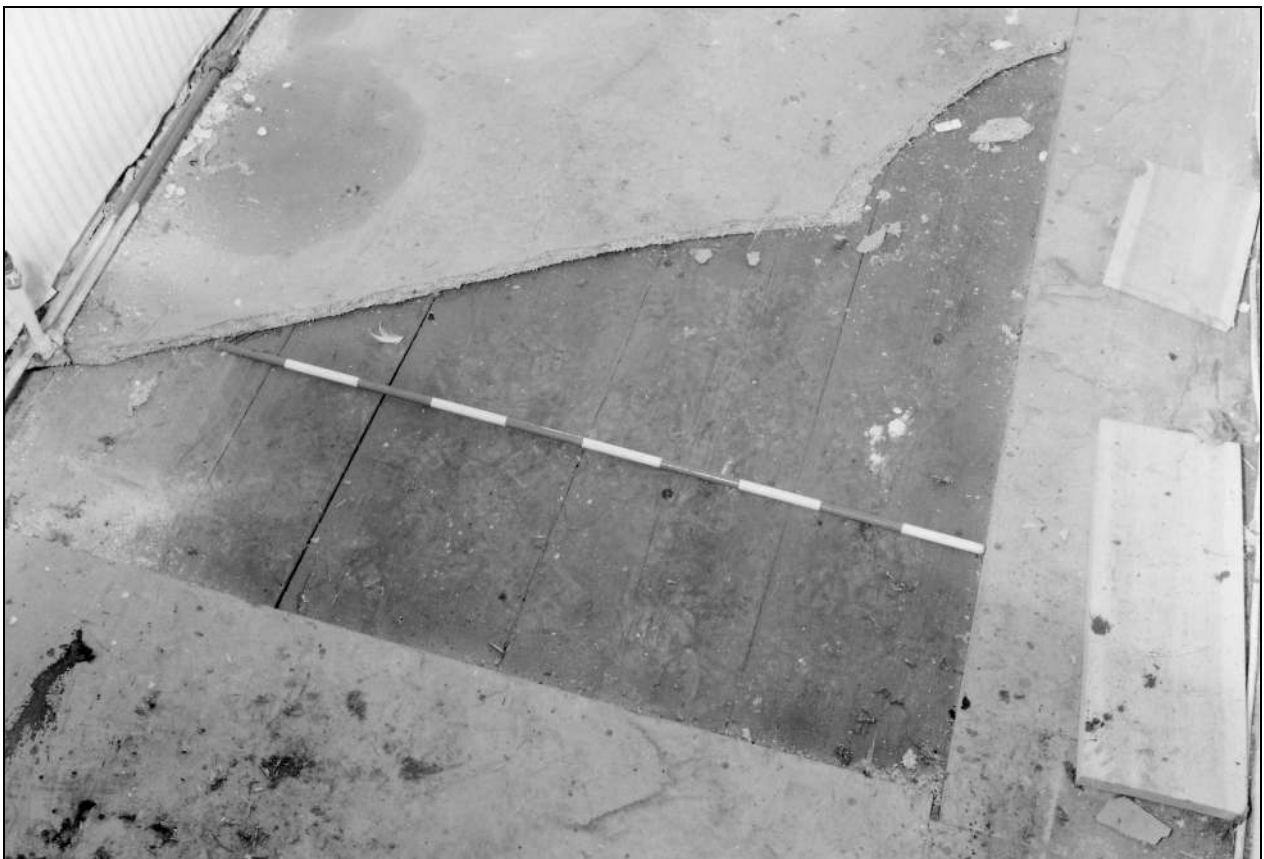
Photo 46: Detail of floor boards exposed in rear bedroom on first floor