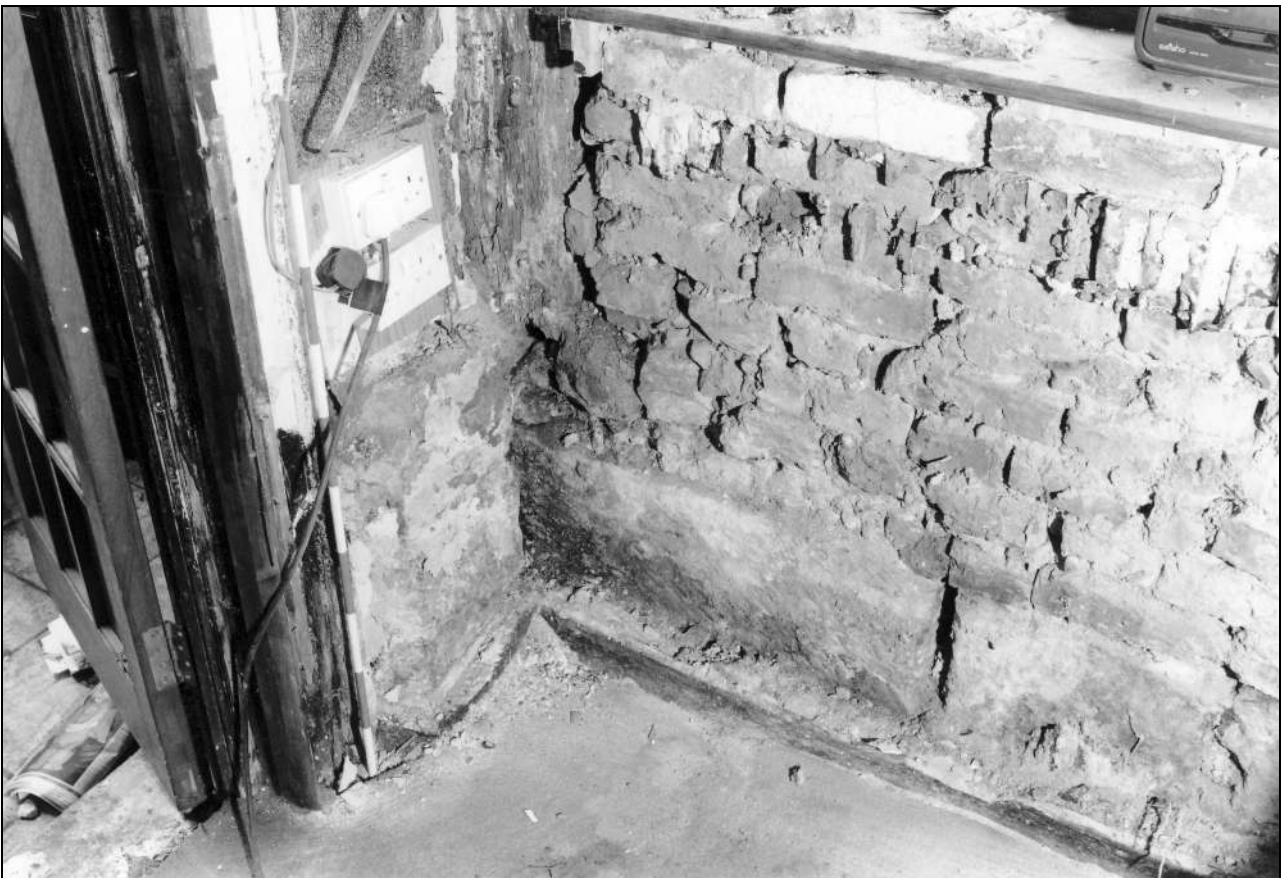
Photo 42: Detail of stone plinth and remnant of sill beam at south-east corner of ground floor