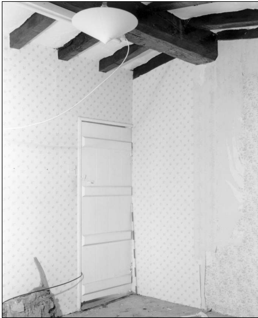
Photo 47: First floor: north-west corner of main room, showing spine beam and 19th century door