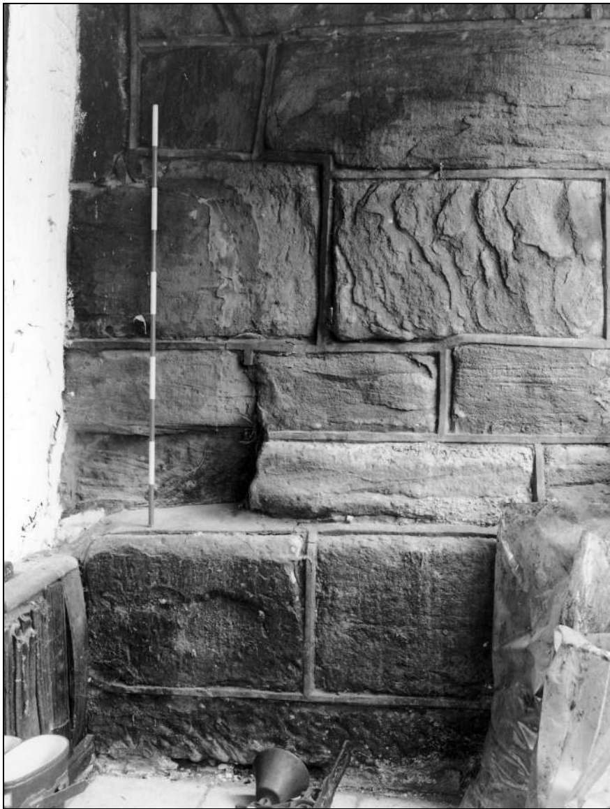
Photo 31: Detail of stonework forming the south side of the chimney to the east wing