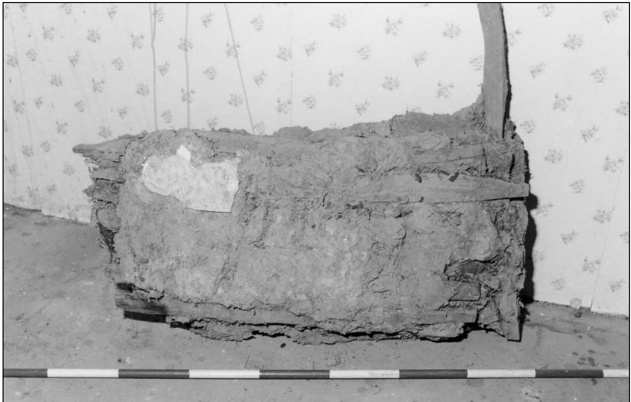
Photo 44: Portion of wattle and daub, removed from ceiling over first floor