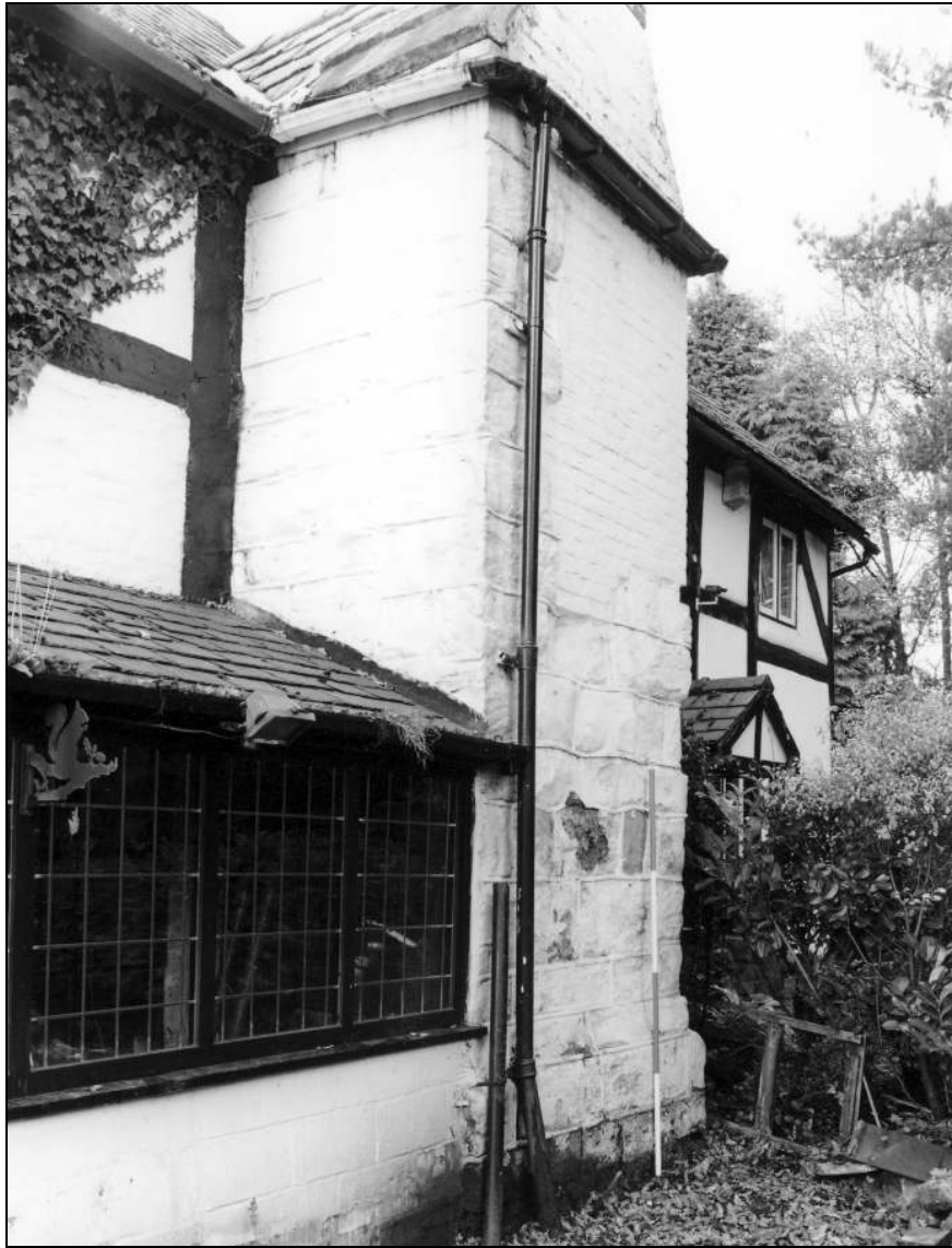
Photo 29: East wing: chimney stack and rear part (no.246), from the south-east