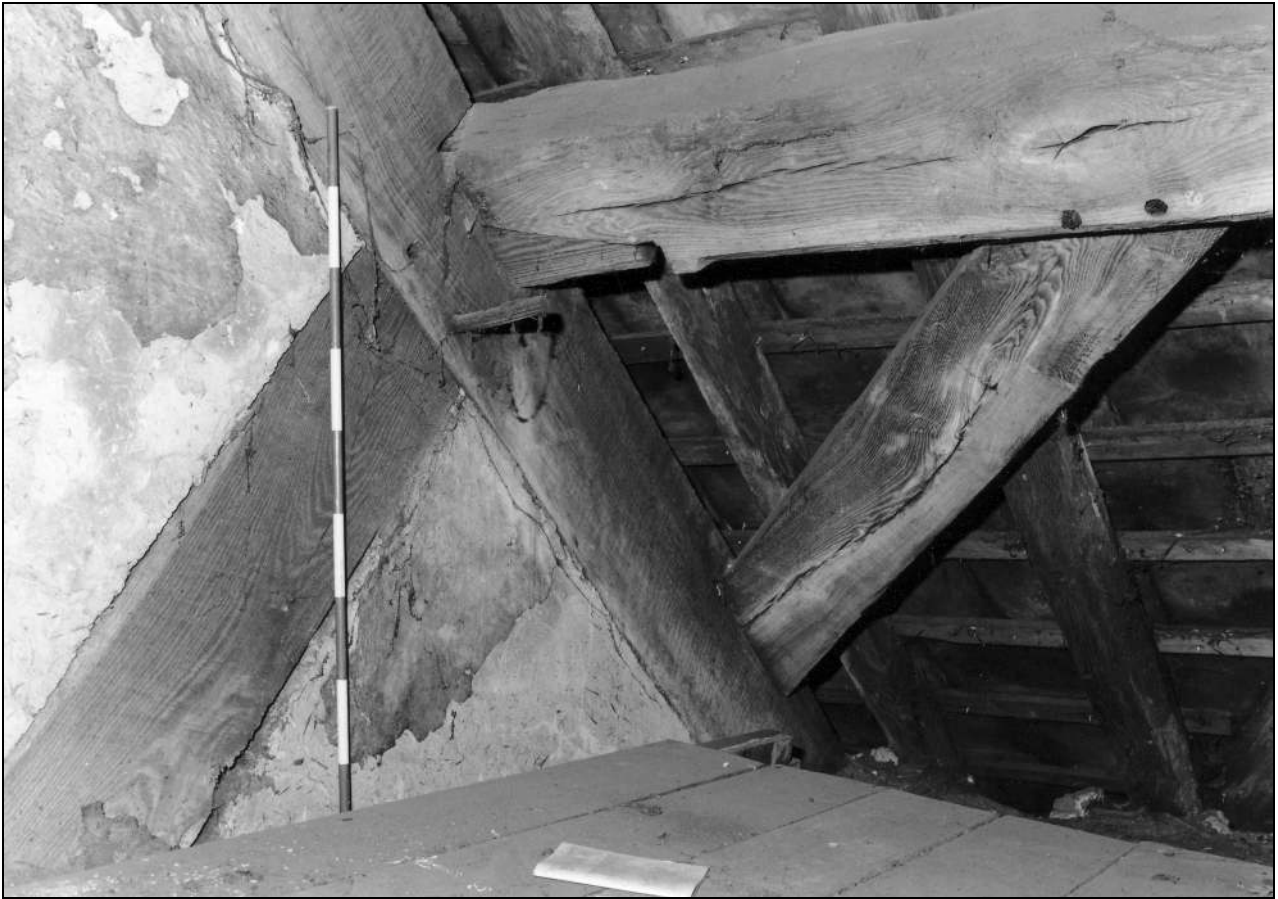
Photo 27: Detail of wind brace on east side of truss, and scarf joint in chamfered purlin