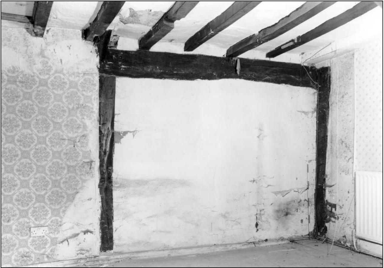
Photo 35: First floor: timber framing at south-east corner, the chimney stack to the left