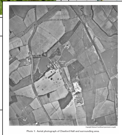
Photo 1: Aerial photograph of Chestford Hall and surrounding area.