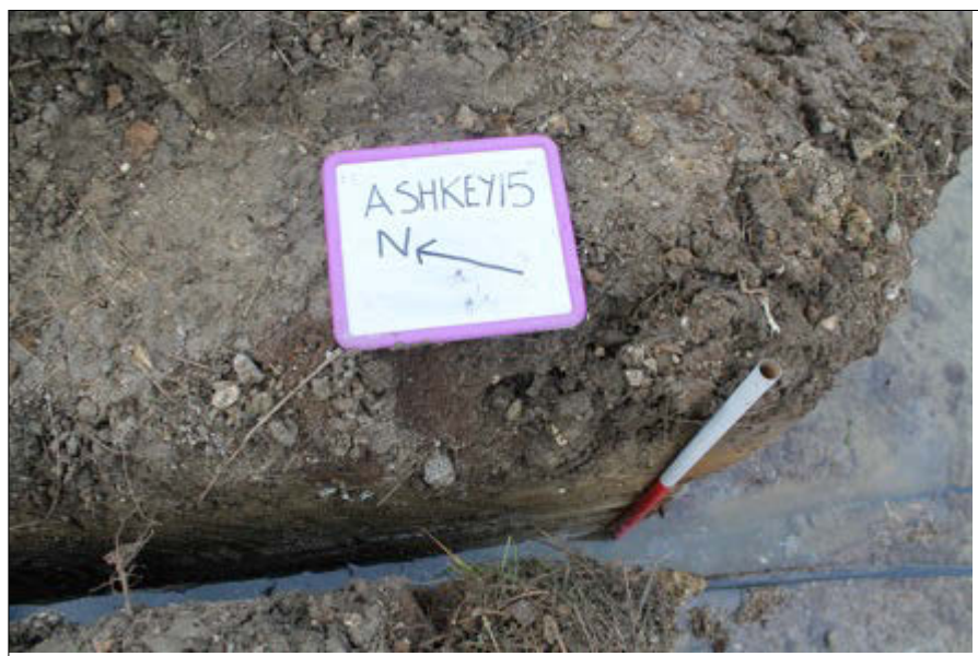
Figure 7: Layout of development area for proposed Wind Turbine facing South West