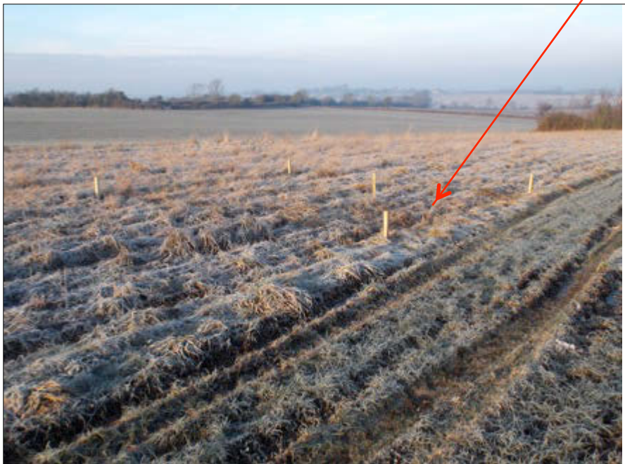
Figure 4: Layout of development area for proposed Wind Turbine