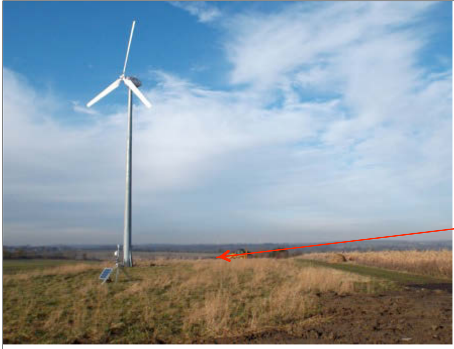
Figure 3: Proposed Development Area with current Wind Turbine in the foreground