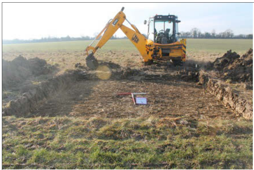
Figure 5: Site of open trench on site of proposed Wind Turbine facing North