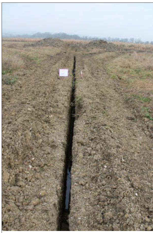
Figure 6: Cable trench for proposed Wind Turbine facing South West