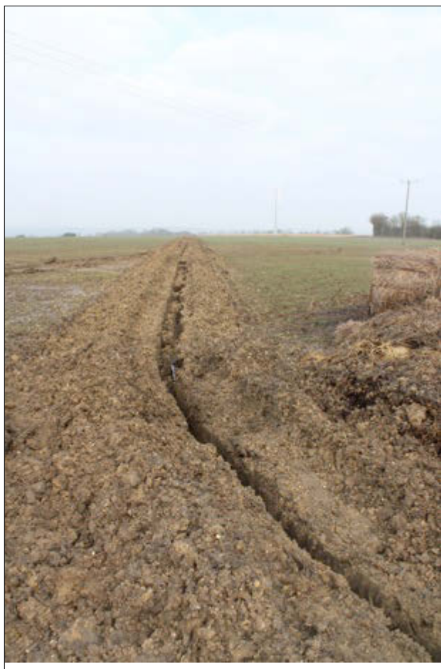
Figure 8: Layout of development area for proposed Wind Turbine facing South West