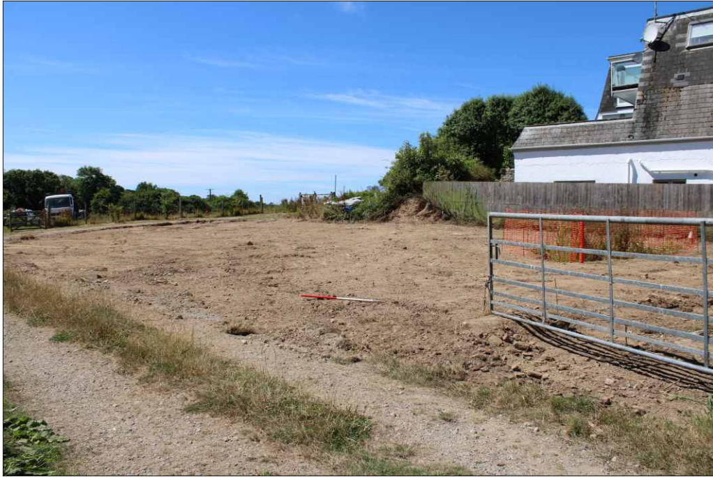
Plate 1: General view of the site following initial stripping of turf and topsoil, looking southwest (1m scale)