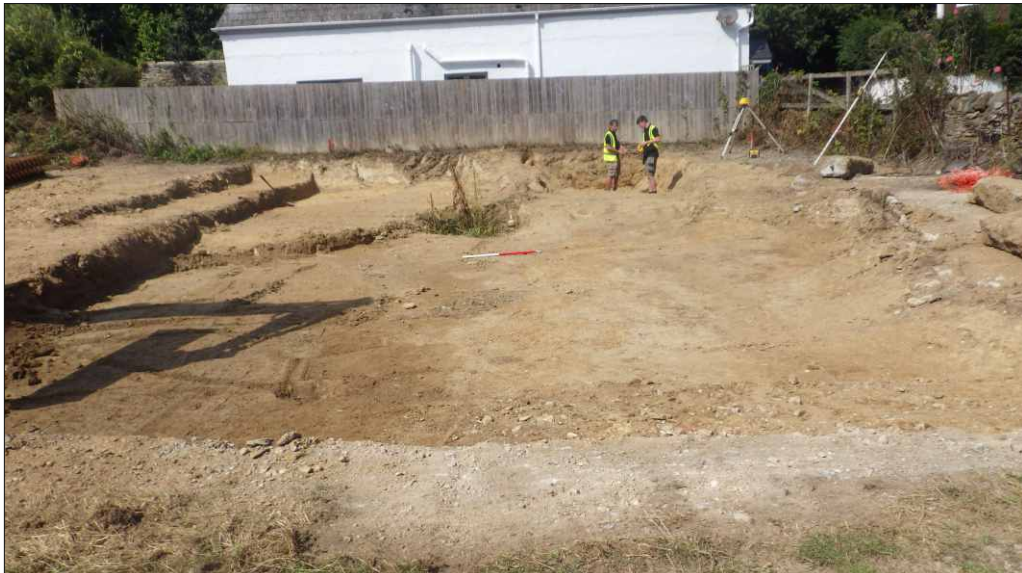
Plate 2: Building plot following bulk reduction, looking northwest (1m scale)