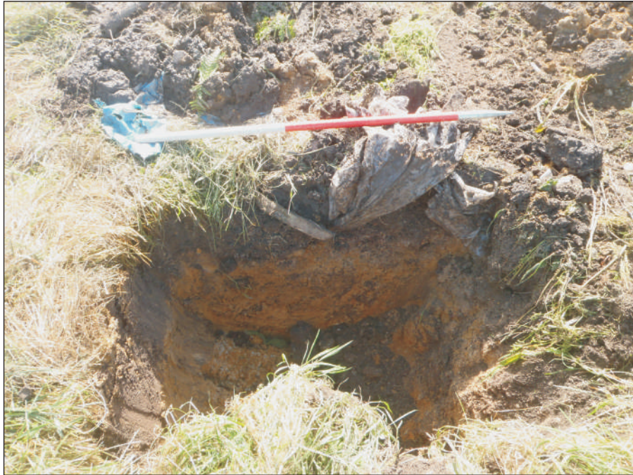
Plate 1: View of typical stanchion pit, looking from the west. Scale 1m