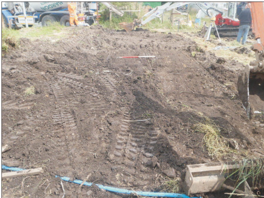
Plate 2: View from the west, of the ground following the removal of the spoil heap. Scale 1m