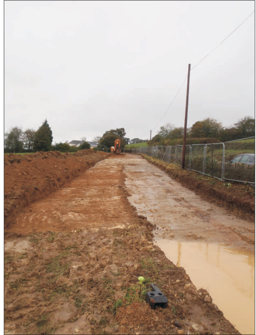
Plate 2: View of topsoil stripping along the north boundary, showing partially removed subsoil, viewed from the east