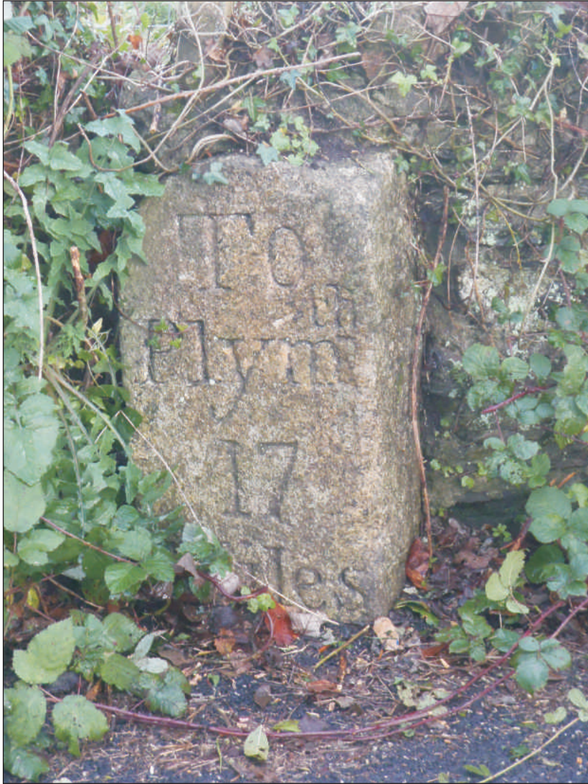
Plate 1: The milestone in situ , viewed from the north