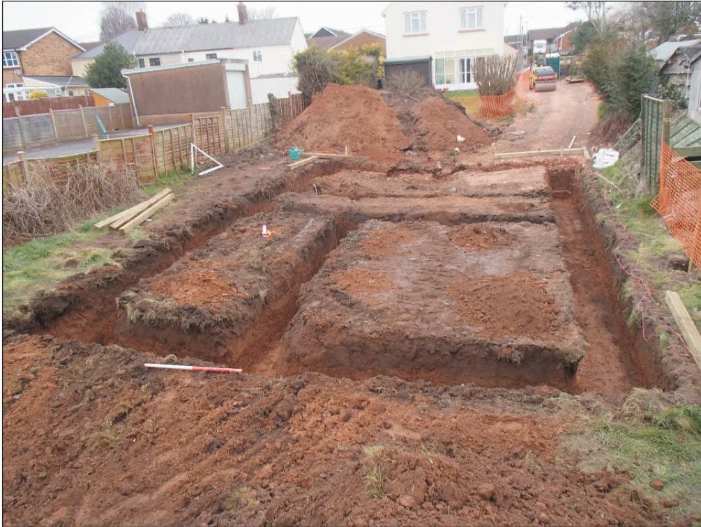
Plate 1: General view showing the excavated foundation trenches, looking northwest, 1m scale