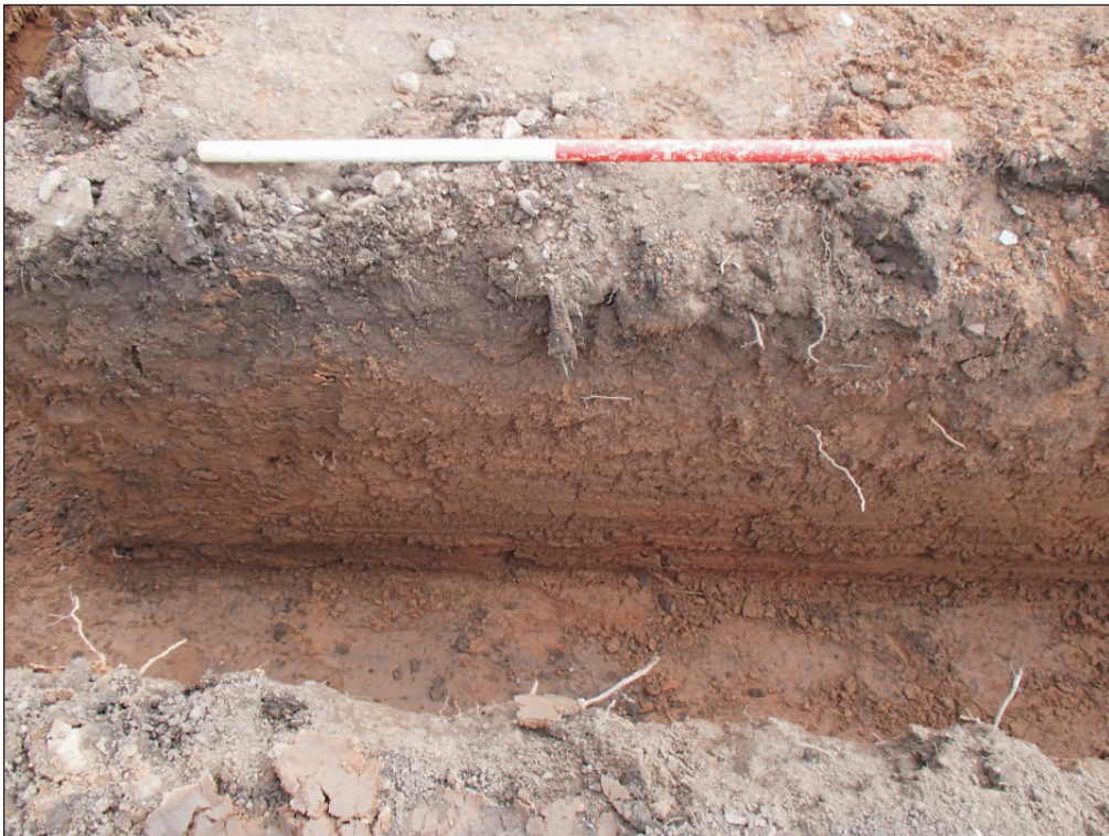
Plate 2: A typical section of the foundation trenches, looking northwest, 1m scale