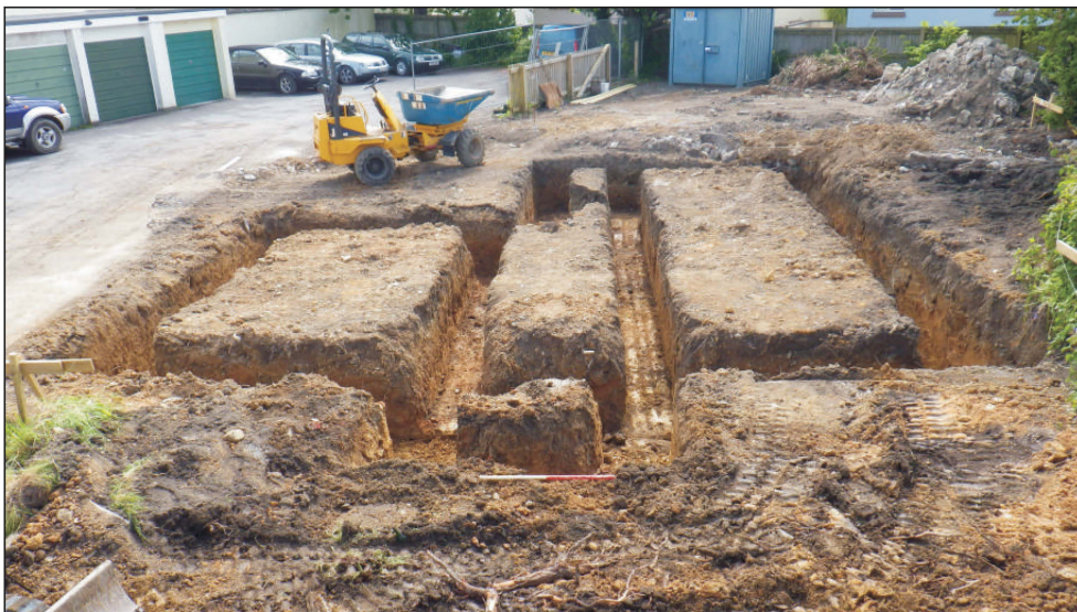
Plate 2: View of site following excavation of foundation trenches, looking southeast. 1m scale