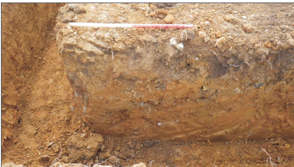
Plate 3: Typical deposit sequence, looking southeast. 1m scale