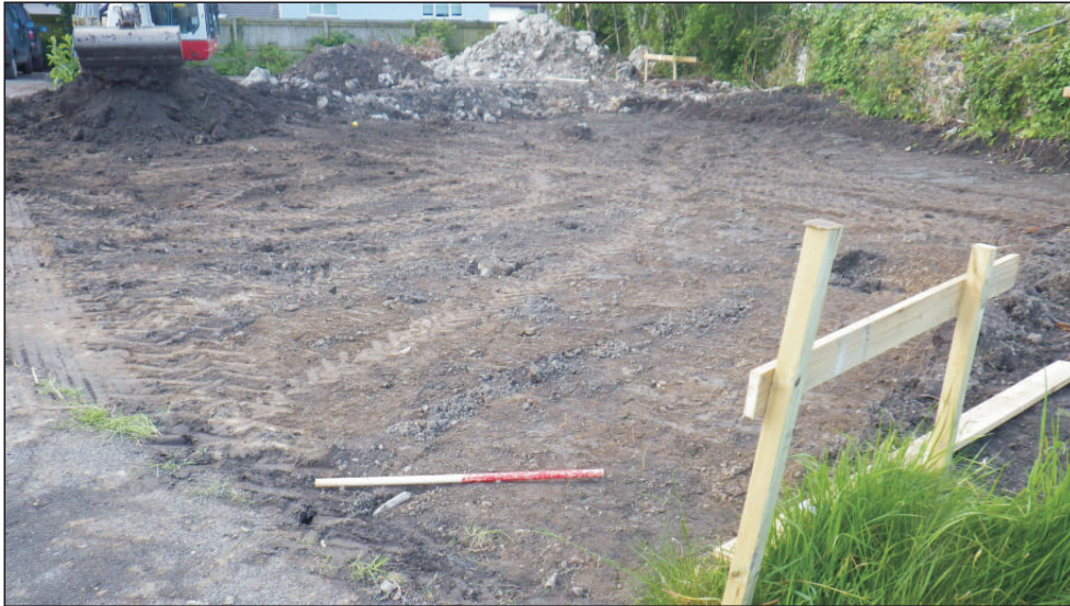
Plate 1: View of site following removal of topsoil, looking south. 1m scale