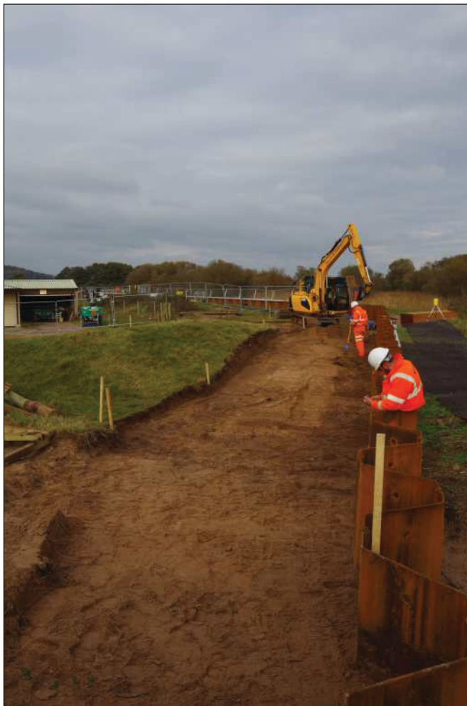
Plate 2: General view of works at the south end of site, from the south