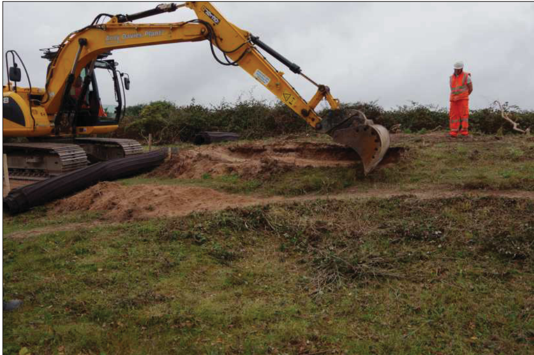
Plate 1: General view of works at the north end of site, from the south east