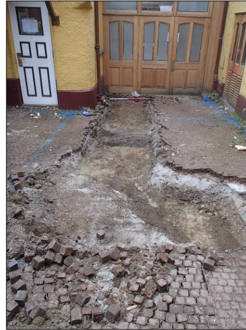
Plate 2: Trench 1, general view looking southeast, 1m scale