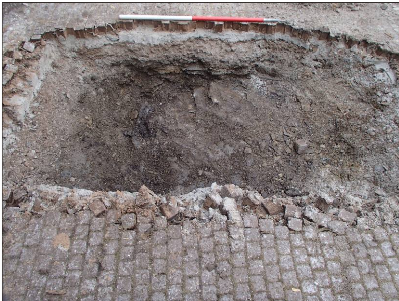
Plate 3: Test pit 1, east facing section showing modern deposits over bedrock. 1m scale