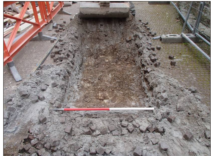
Plate 4: The middle of trench 3 showing exposed bedrock, looking north. 1m scale