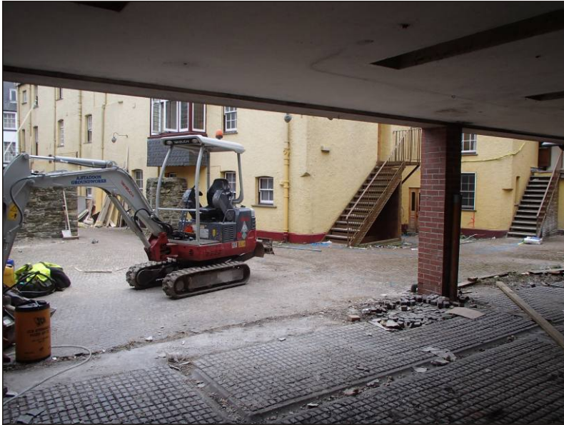
Plate 1: General view of site, looking southwest from the rear range. The location of Trench 1 is beyond the brick pier, with test pits 1-3 behind the machine.