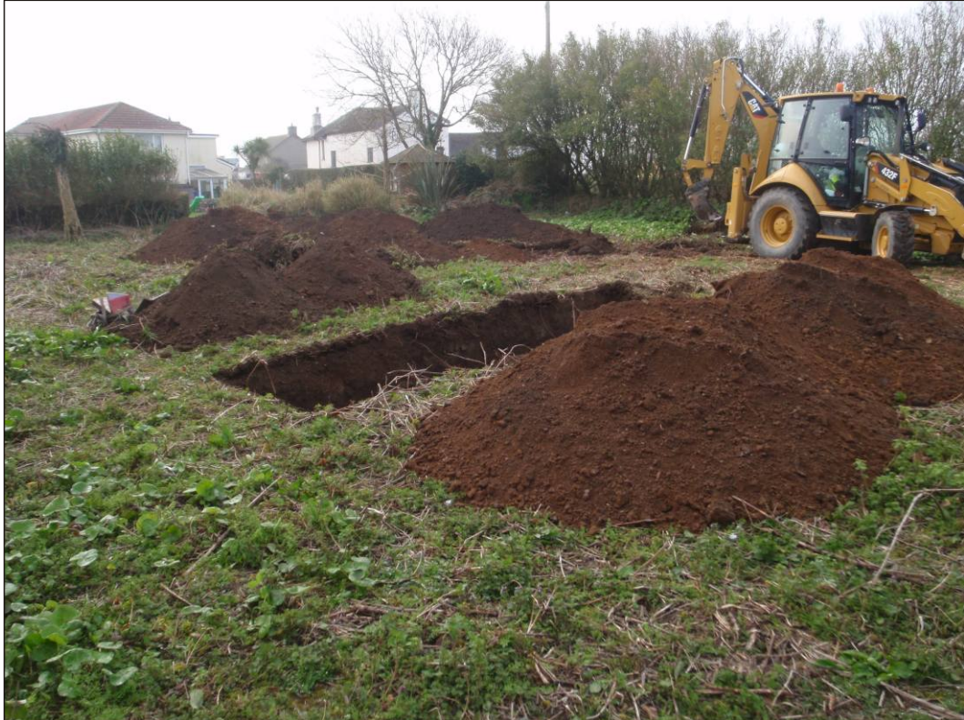
Plate 1: View of site looking southeast