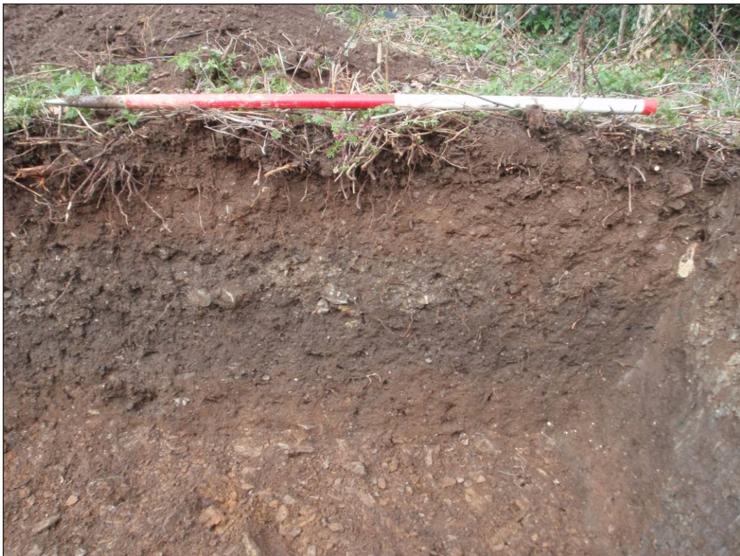
Plate 2: Trench 1, representative section. View to northwest (scale 1m)