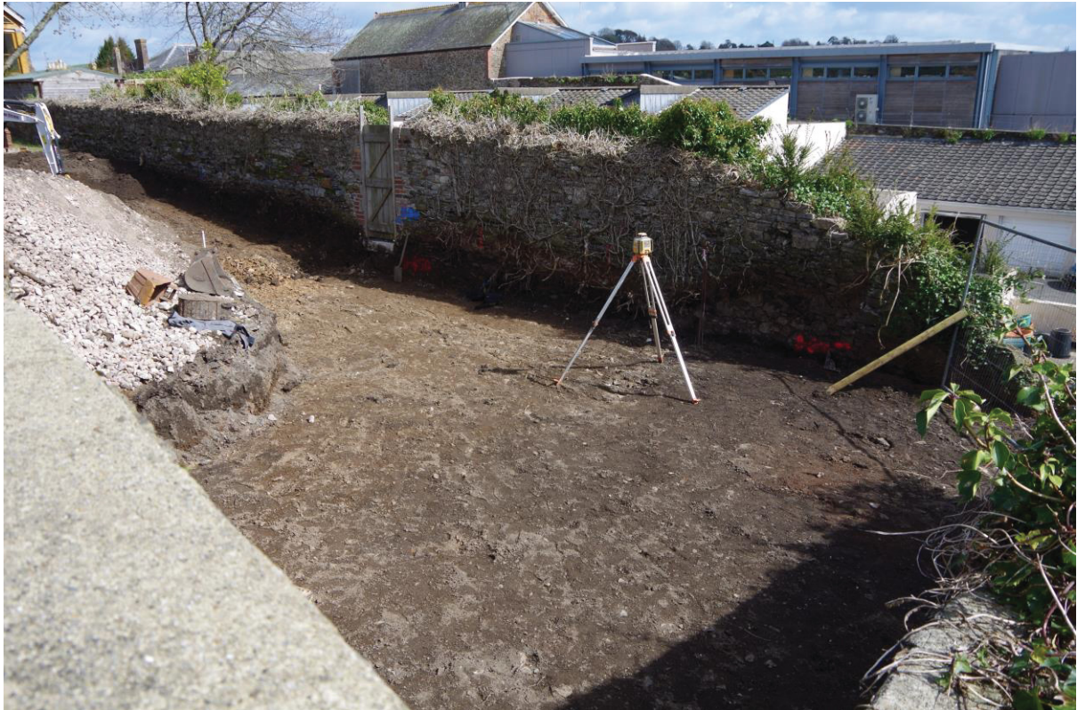
Plate 1: Southern part of parking area following machine stripping, looking northwest