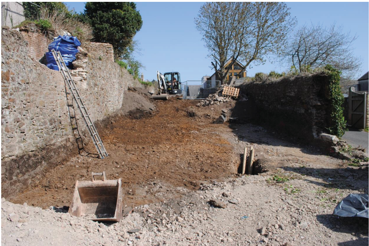
Plate 2: Northern part of parking area following stripping, looking north