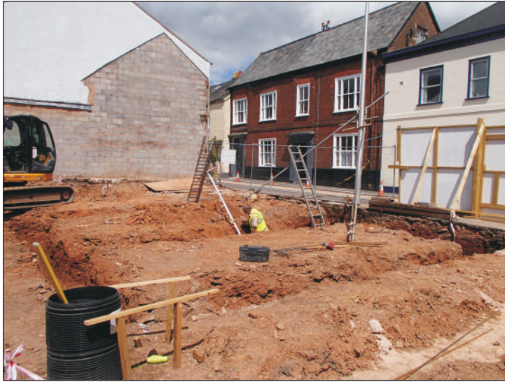
Plate 1: General view of the north end of the site during the excavation of foundation trenches, viewed from the south west.