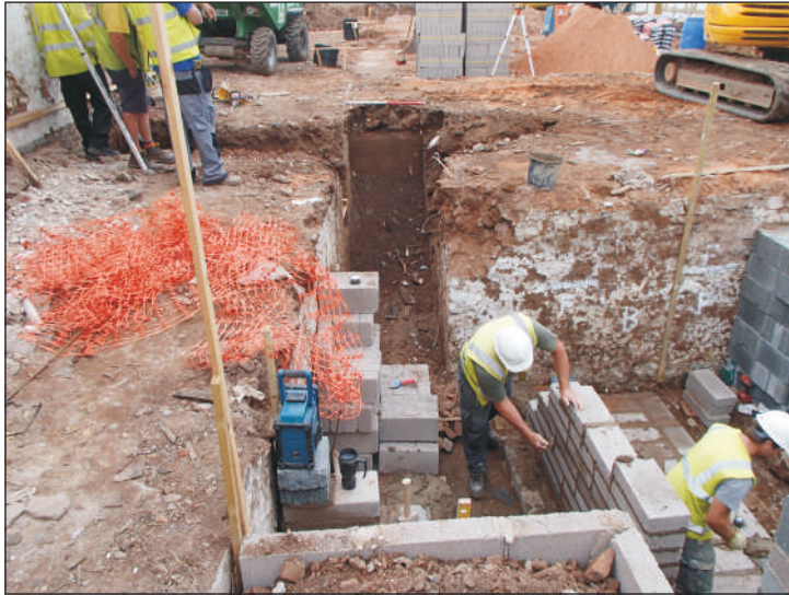
Plate 4: The west end of the cellar showing the short corridor at the northwest corner, viewed from the south. 1m scale