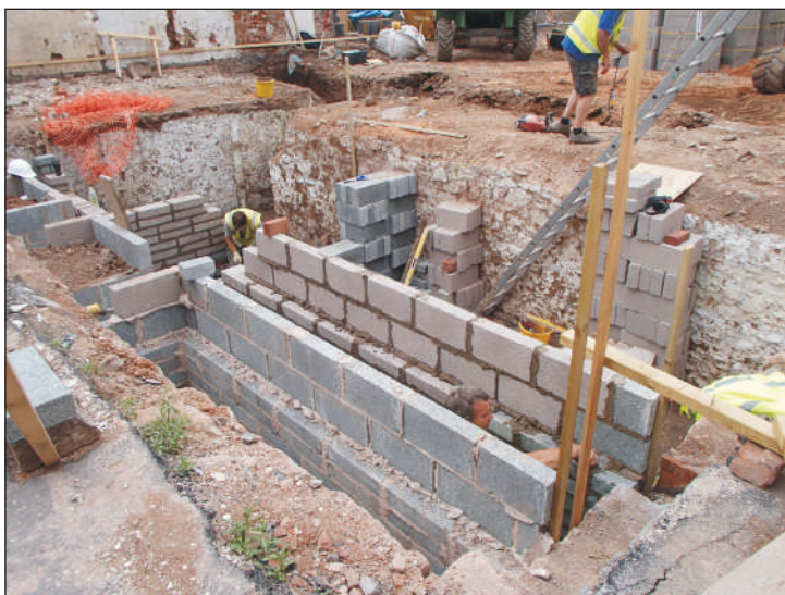
Plate 3: The cellar viewed from the southeast