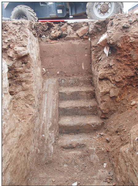
Plate 5: The steps down into the cellar viewed from the south. 1m scale