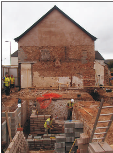
Plate 2: The cellar viewed from the east.