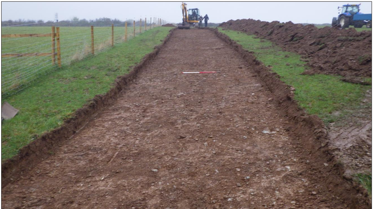
Plate 2: Showing stripped trackway route. View to northeast (scale 1m)