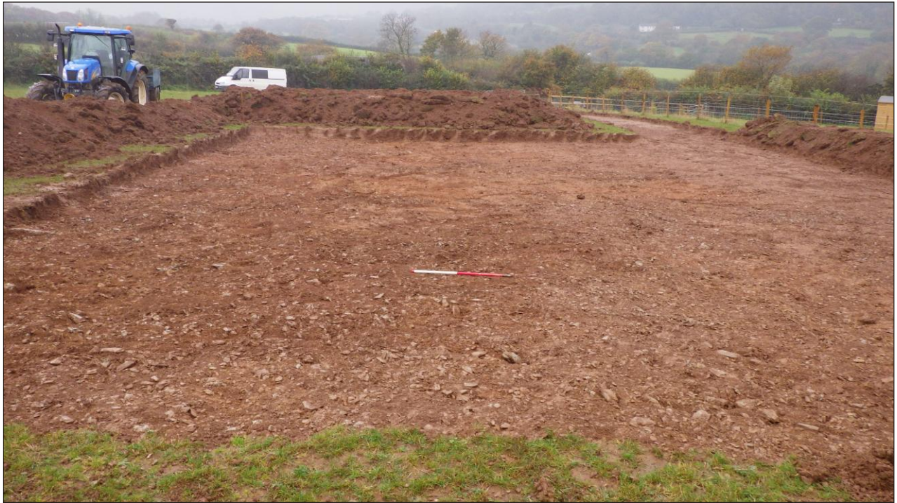
Plate 1: Showing area stripped for yard and stable block. View to southwest (scale 1m)