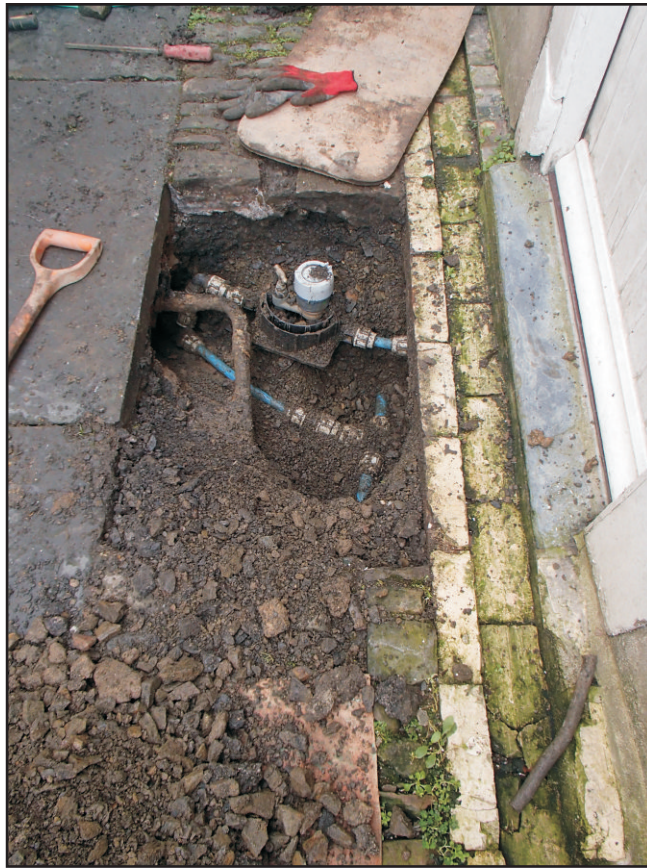
Plate 3: Working shot of trench, view to east