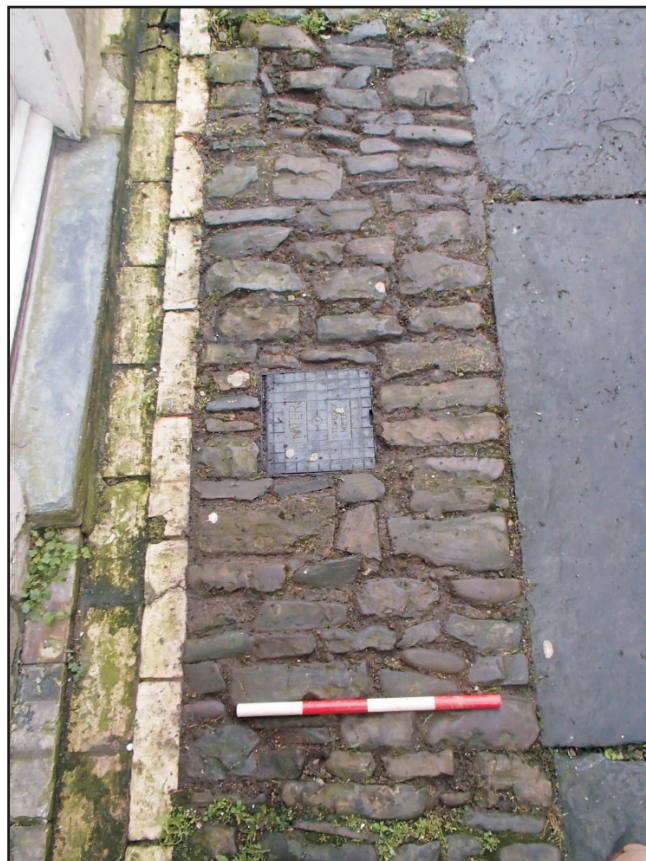
Plate 2: Pre-excavation view of cobble surface, looking west (scale 0.4m)