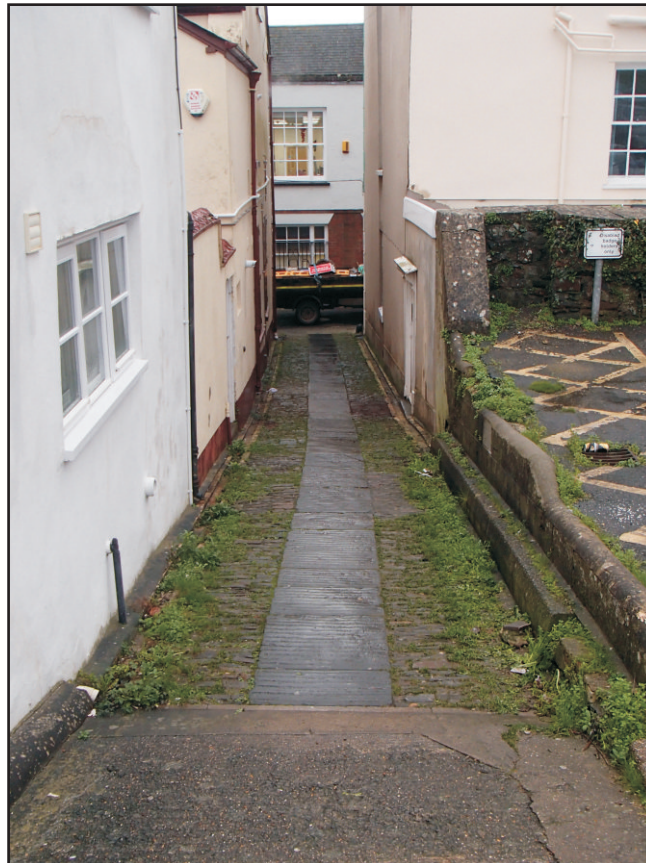
Plate 1: General view of site, looking east towards Allhalland Street from Bridge Street Car Park