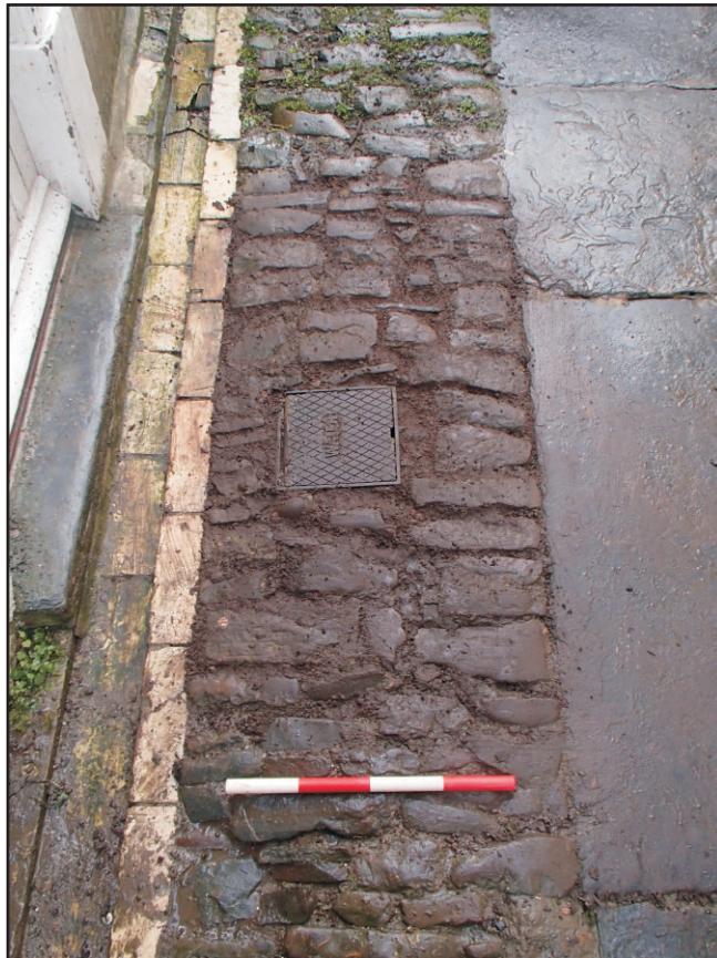
Plate 4: Post-excavation view of cobble surface, looking west (scale 0.4m)