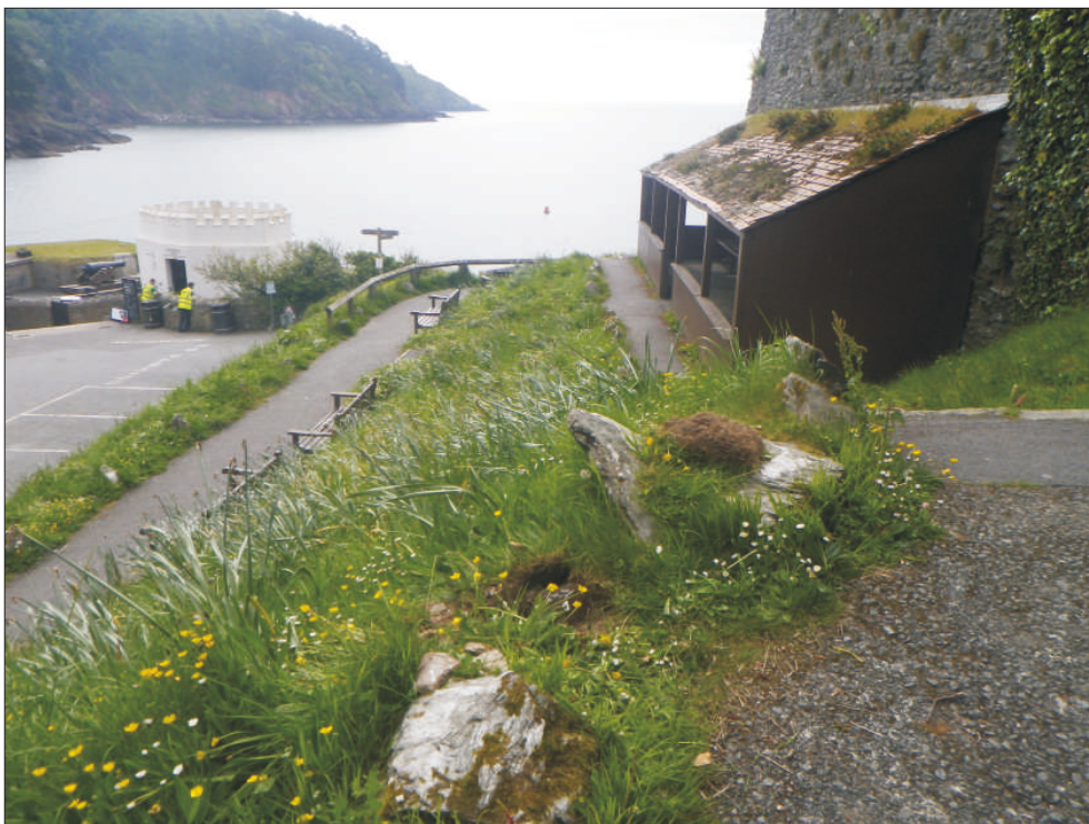
Plate 1: Location of signboard posthole, looking southeast