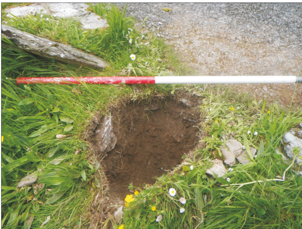
Plate 2: Completed posthole, looking southwest (scale 1m)