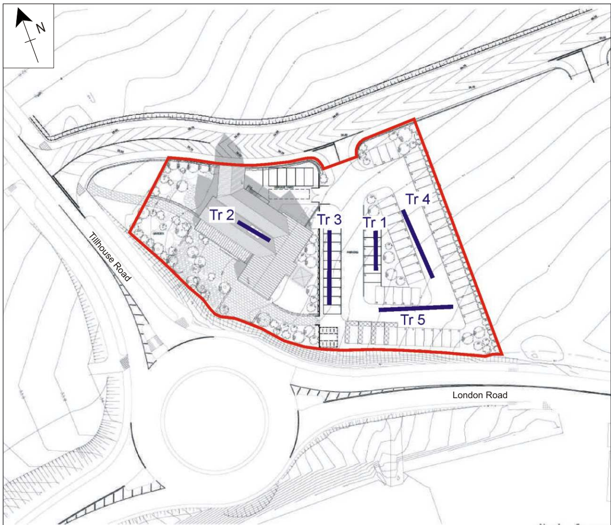
0 50m Scale 1:1000@A4