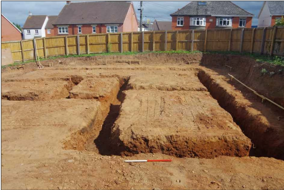
Plate 1: Unit 1 footings trenches, view to northeast (scale 1m)