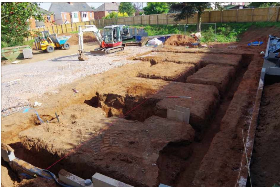
Plate 2: View of Unit 2 footings trenches. Looking southeast (scale 1m)