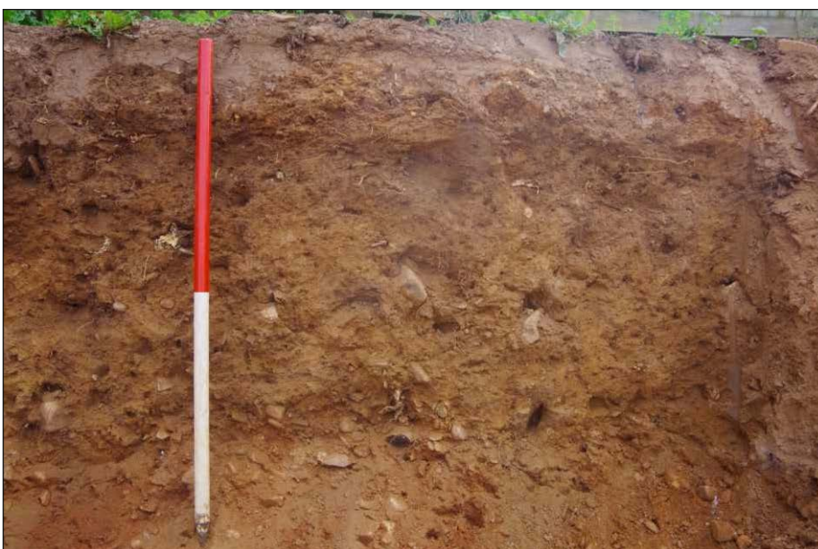
Plate 3: Representative section showing overlying soil layers. View to southeast (scale 1m)