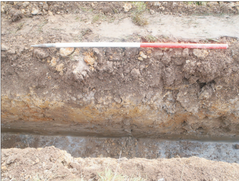
Plate 2: Representative section of cable trench (scale 1m)