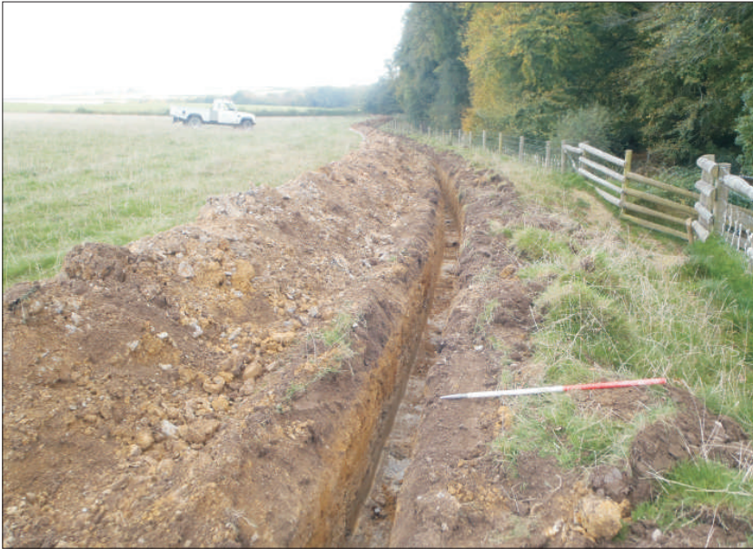
Plate 1: General view of cable trench in Plot 1, looking south (scale 1m)