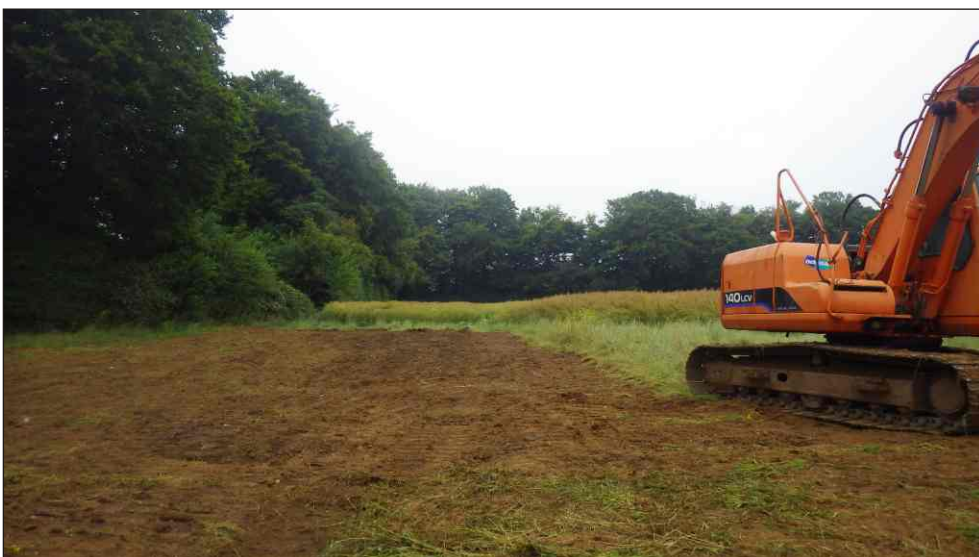
Plate 3: Showing completed reversal work to temporary platform, looking northeast