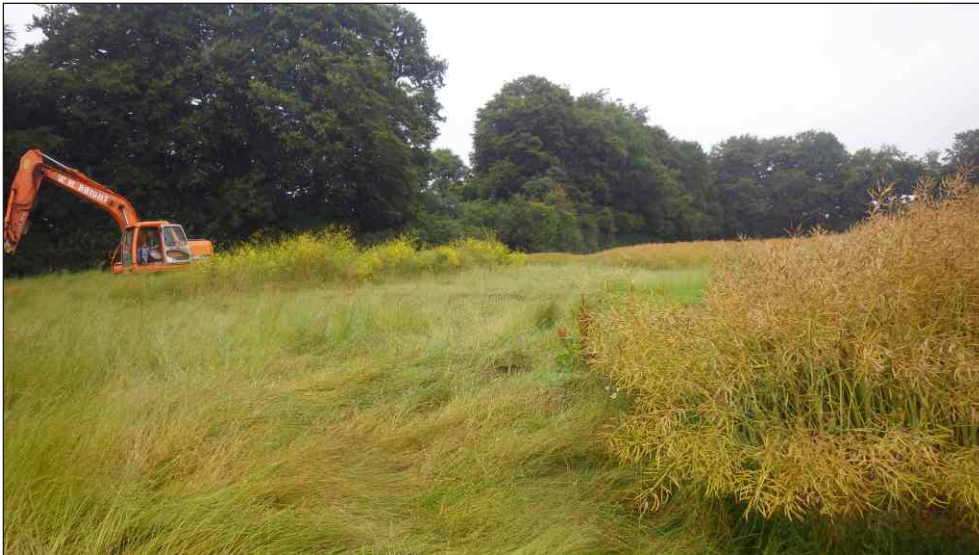
Plate 1: Pre-excavation view of temporary platform, looking northeast