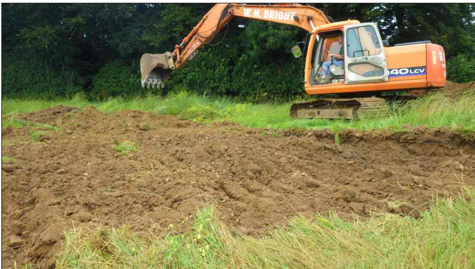
Plate 2: View of reversal works showing profile through temporary platform, looking northwest