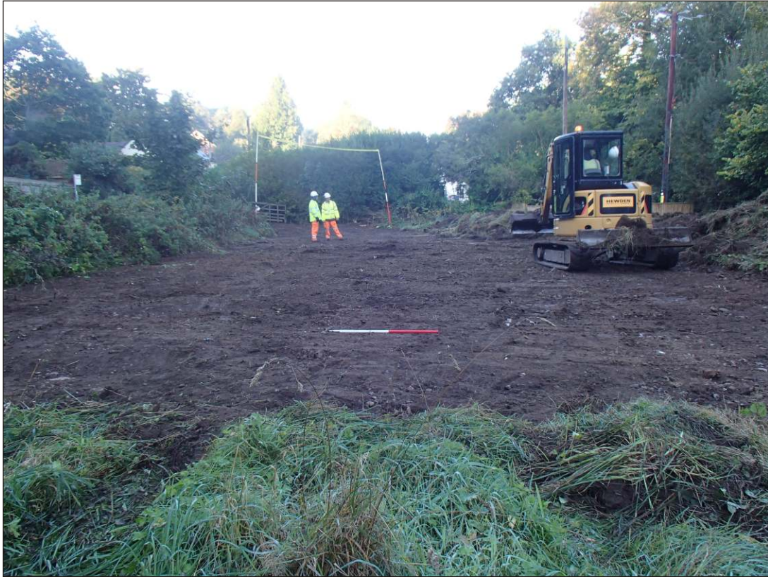
Plate 1: General view of stripped area. looking west (scale 1m)