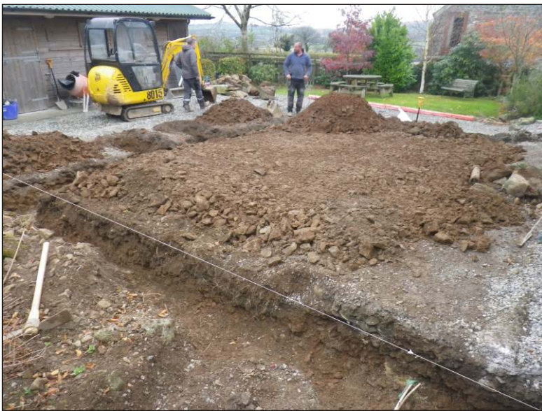
Plate 5: View of the site after excavation of the foundation trenches, view from the southeast