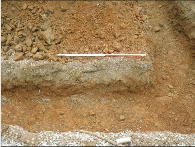
Plate 4: View of the section through the stable yard, view from the north. (1m scale)