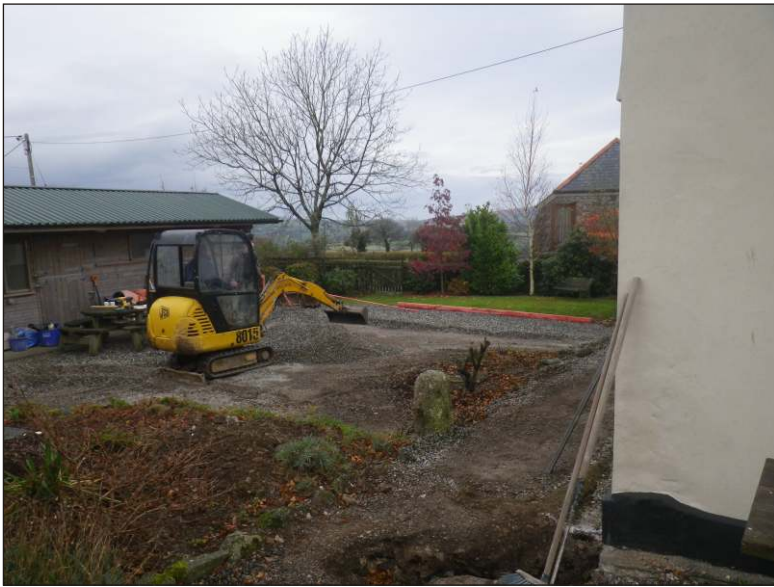
Plate 1: View of the stable yard before excavation of foundation trenches, view from the southeast