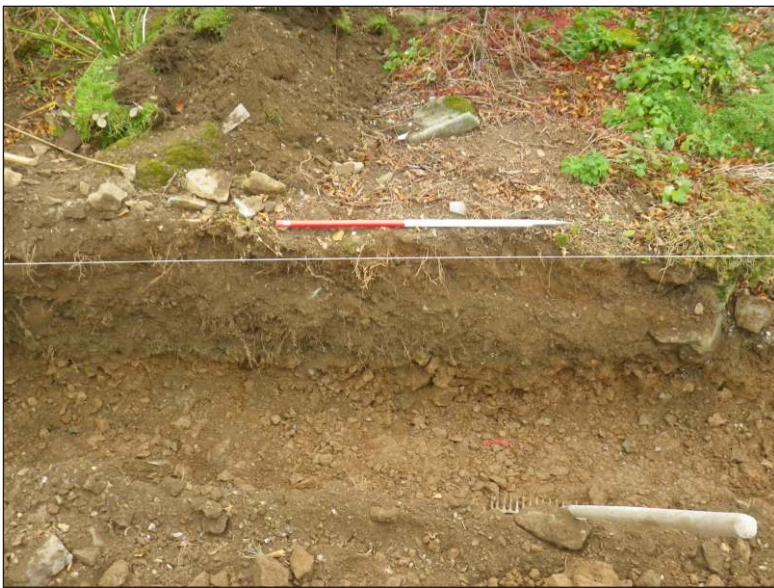
Plate 2: View of the flowerbed cutting into the subsoil, view from the north. (1m scale)