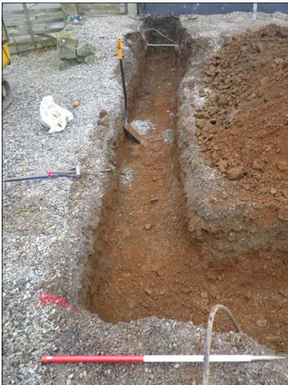
Plate 3: View along the northern foundation trench line, view from the west. (1m scale)