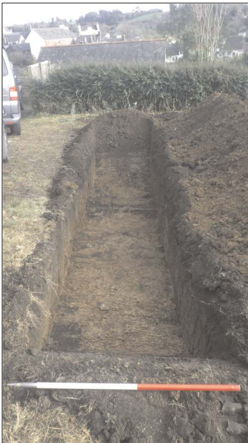
Plate 2: Trench 1, view to east (scale 1m)