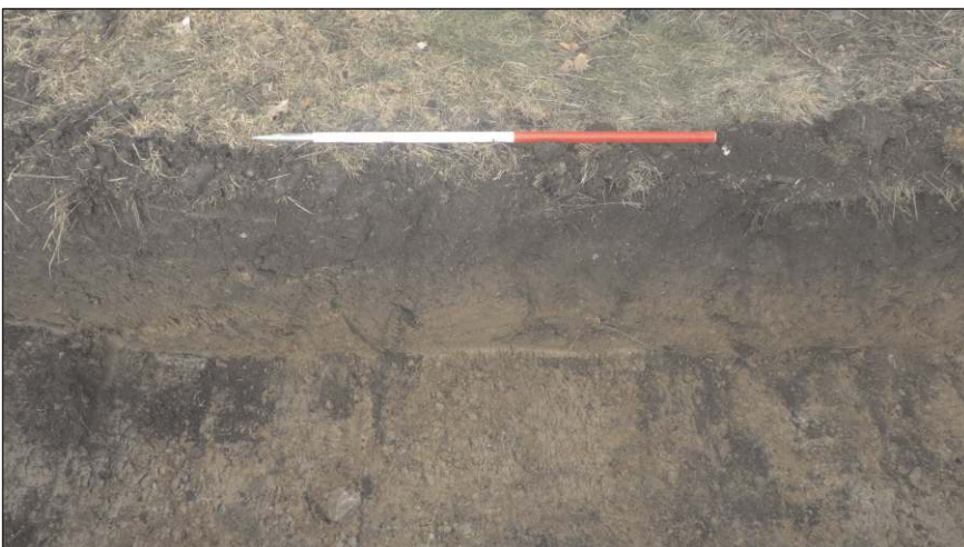
Plate 3: Trench 1 showing overlying layer sequence, view to north (scale 1m)