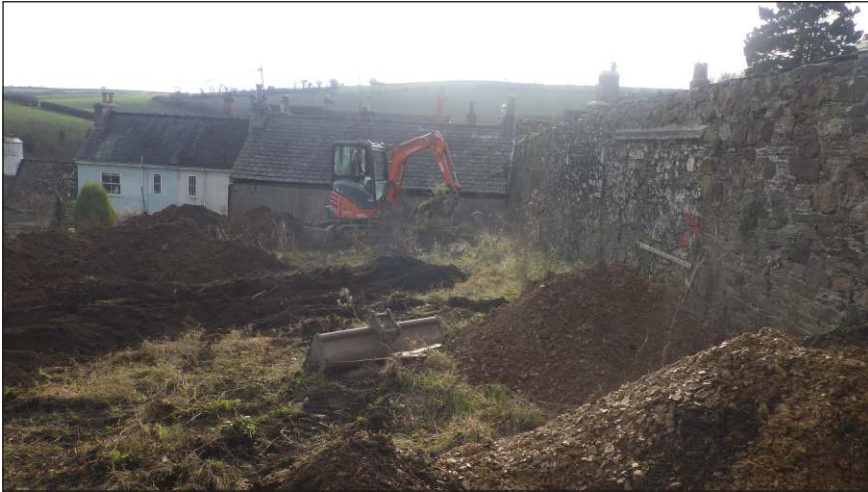
Plate 1: View of site, looking south