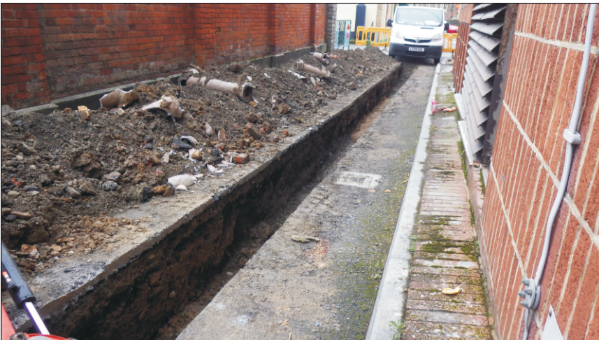
Plate 3: Showing cable trench. View to south