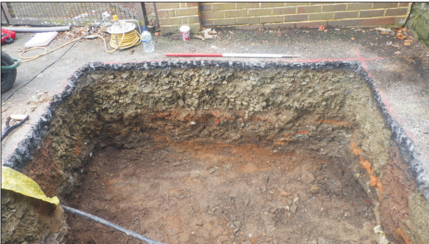
Plate 2: Showing substation trench. View to west (scale 1m)