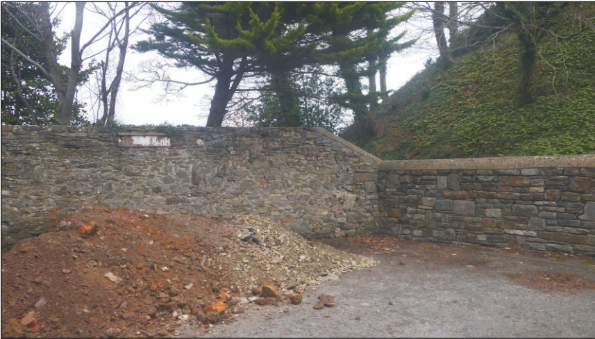
Plate 1: General view of site looking north towards Barnstaple Castle