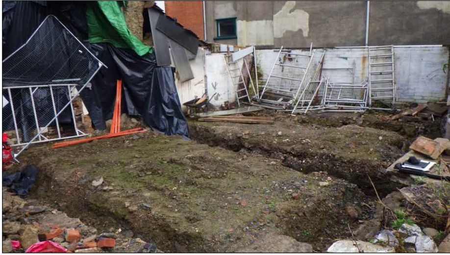
Plate 1: General site view looking northwest