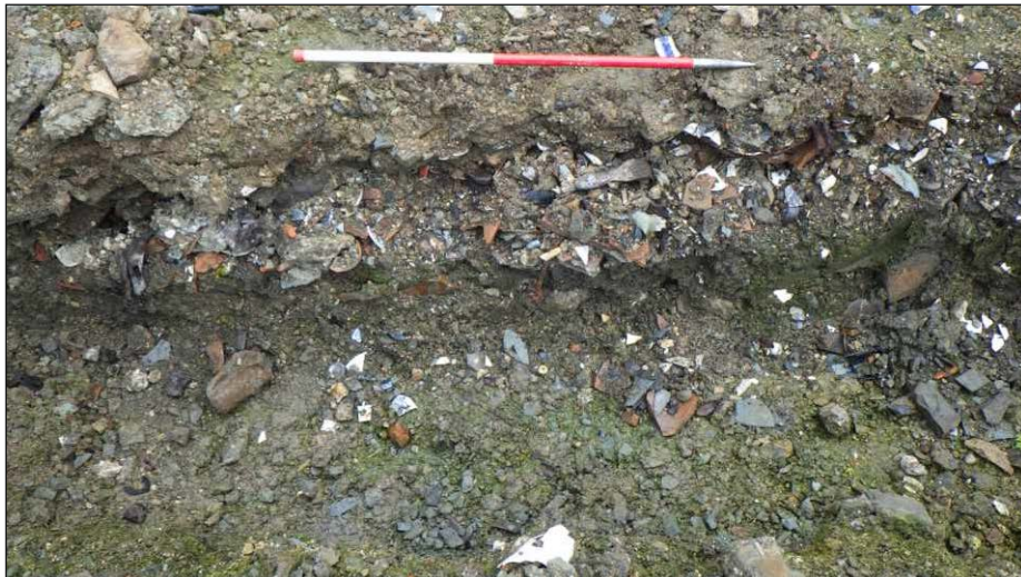
Plate 2: Representative section showing dumped modern pottery in levelling layer 101, view to the north. (1m scale)