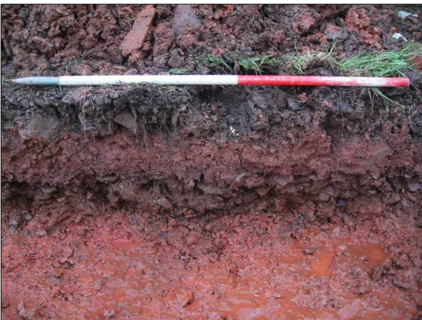
Plate 3: Trench 1, showing representative section of overlying layers. View to northeast (scale 1m)