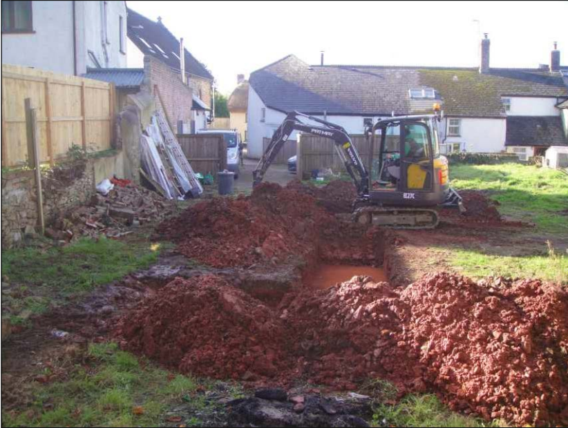
Plate 1: View of site looking south with Trench 1 in foreground