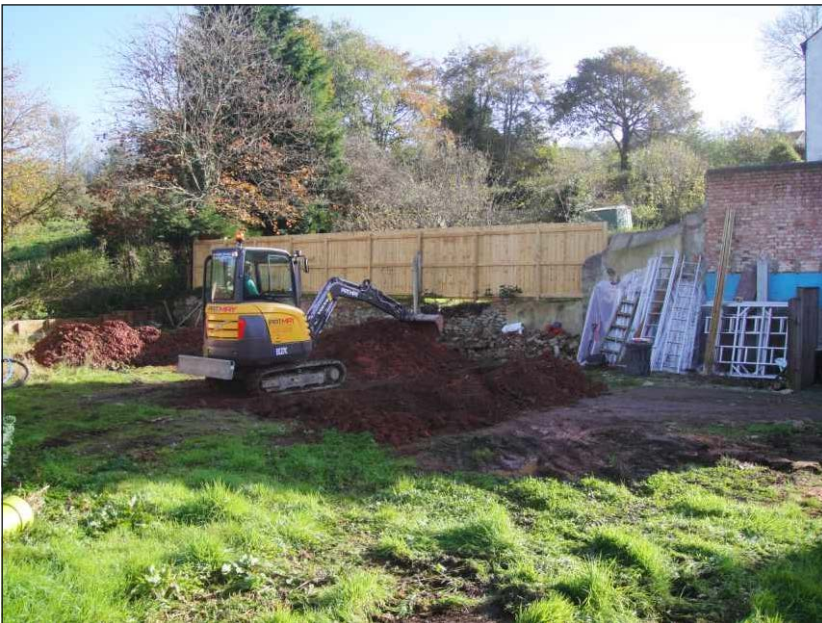
Plate 2: View of site looking east