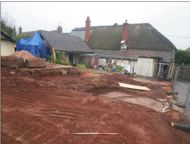
Plate 2: Showing monitored area. View to northeast (scale 1m)