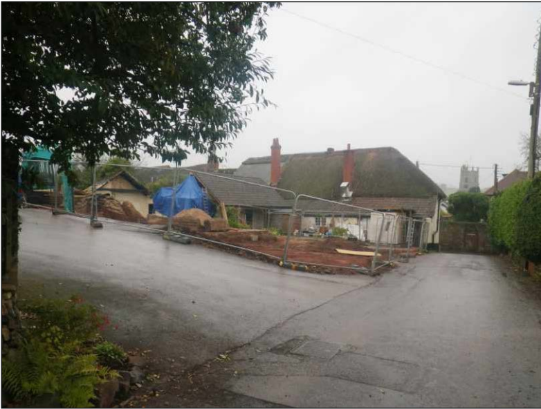
Plate 1: View of site looking northeast from Tuns Lane