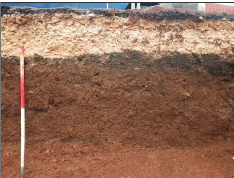
Plate 3: Showing overlying layer sequence. View to west (scale 1m)