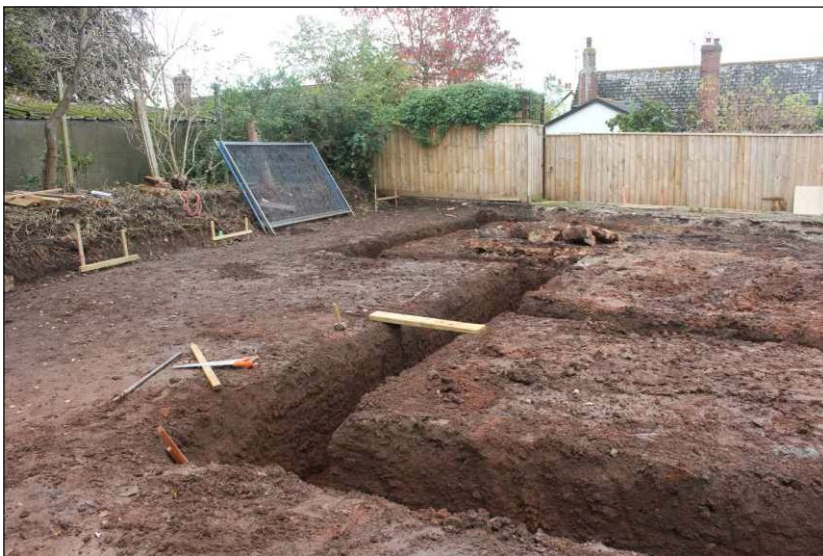
Plate 2: View of footings trenches looking northeast