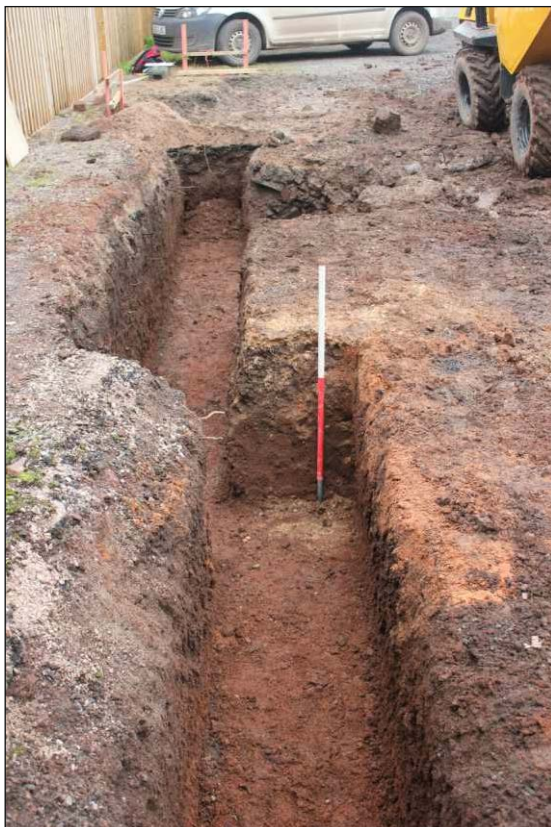
Plate 3: Showing buried soils beneath made ground deposit. View to south (scale 1m)