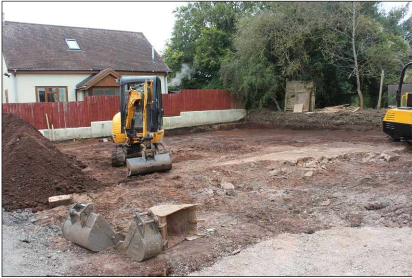
Plate 1: View of site following area strip, looking northwest