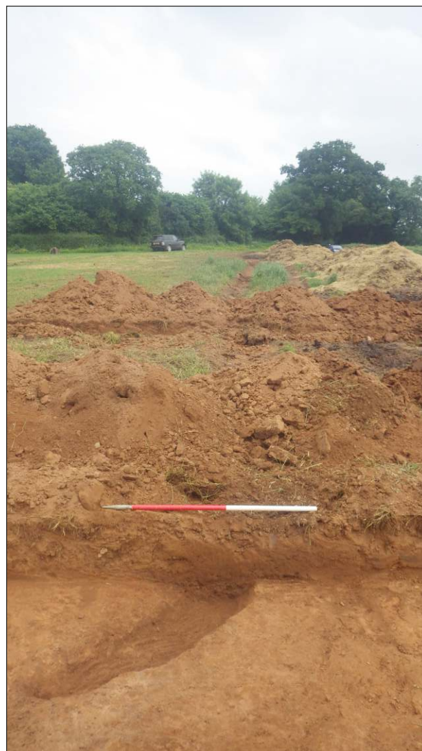
Plate 2: Linear feature F203, looking northeast (scale 1m)