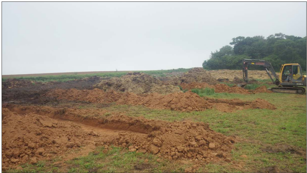
Plate 1: View of site and trenches, looking south