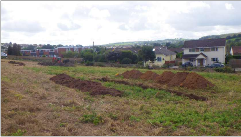
Plate 1: General view of site looking southeast with Trench 1 in foreground