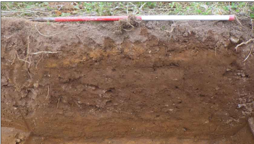
Plate 2: Trench 1, representative section with made ground deposit (scale 1m)