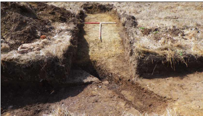
Plate 3: Trench 4, ditch F402 with ceramic drains. View to southwest (scales 2 x 1m)