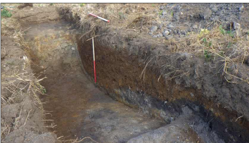
Plate 4: Trench 5 showing modern intrusion F501. View to northwest (scales 2 x 1m)