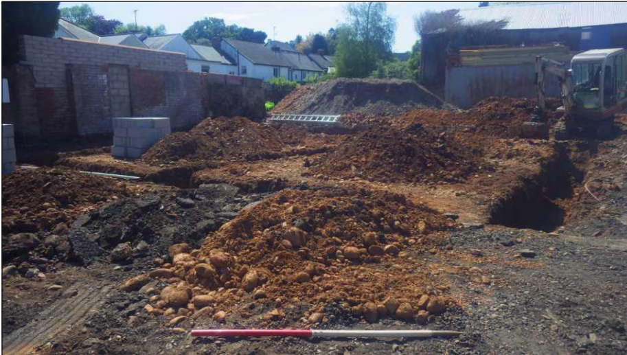
Plate 1: General view of Unit 1 footings trenches, looking southwest (scale 1m)