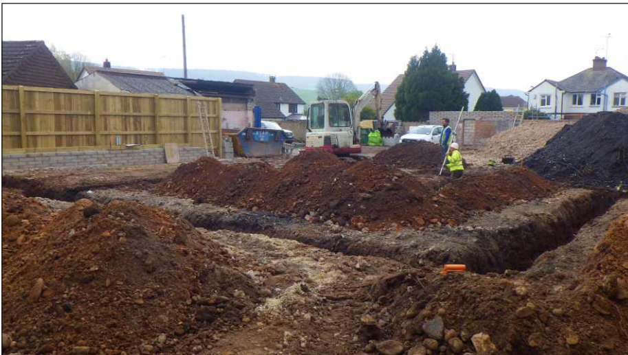
Plate 2: General working view of Unit 2 groundworks, looking southeast