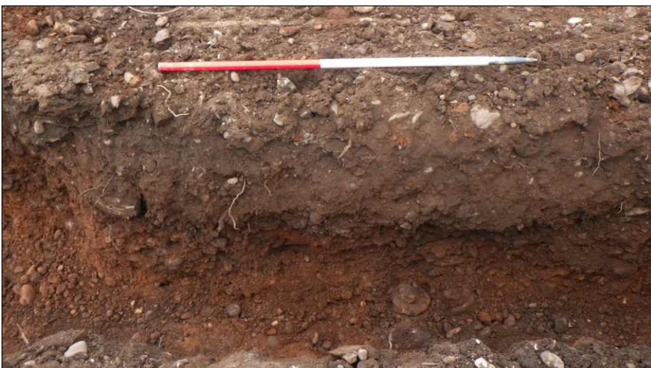
Plate 3: Representative section of Unit 2 footings trench (scale 1m)