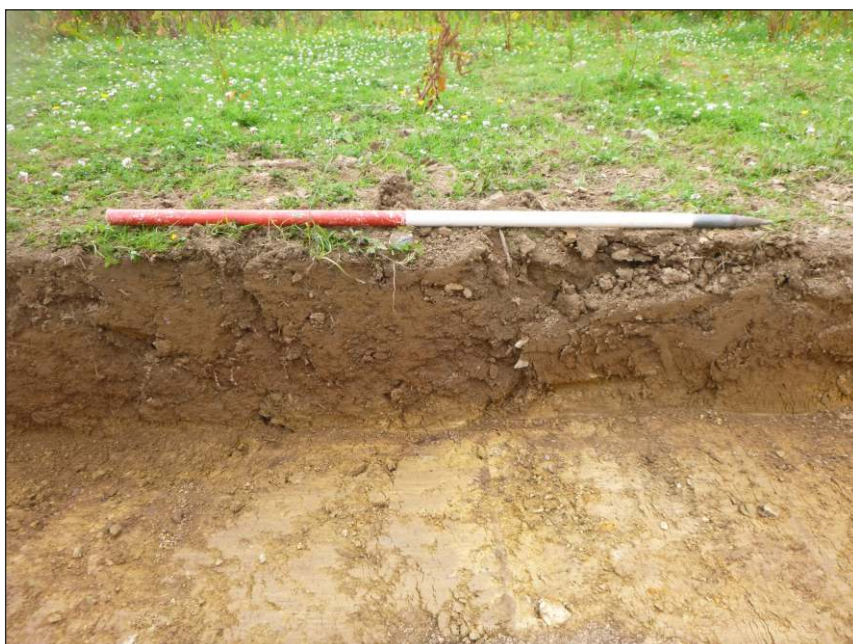
Plate 3: Representative section of stripped track. View to east (scale 1m)