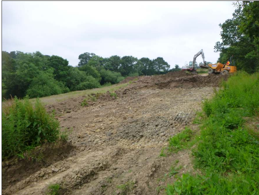
Plate 1: General working view of stable block groundworks. View to west