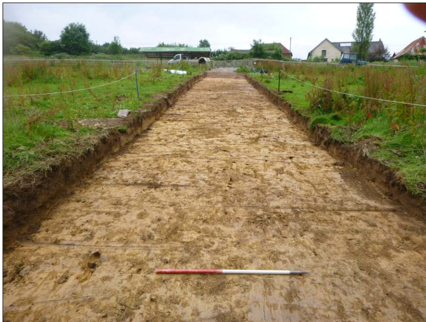
Plate 2: Showing stripped track. View to north (scale 1m)