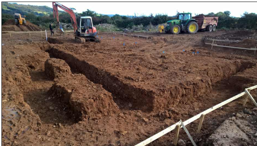
Plate 2: General working view of excavated footings trenches, looking southeast