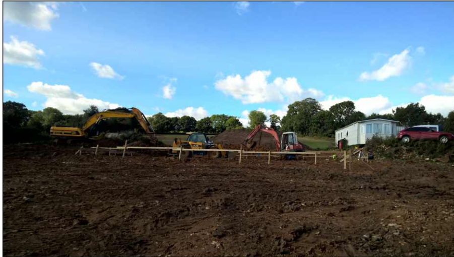
Plate 1: General view of site, looking west