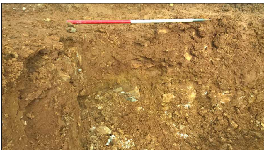
Plate 3: Representative section of footings trench, view to north (scale 1m)