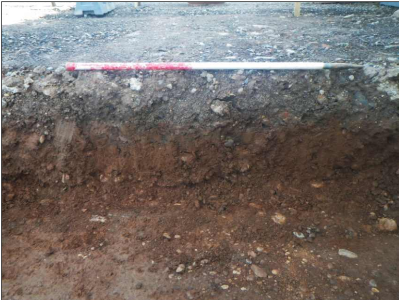
Plate 2: Representative section of stripped area. View to northwest (scale 1m)