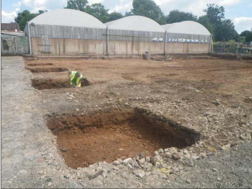
Plate 1: General view of site, looking east