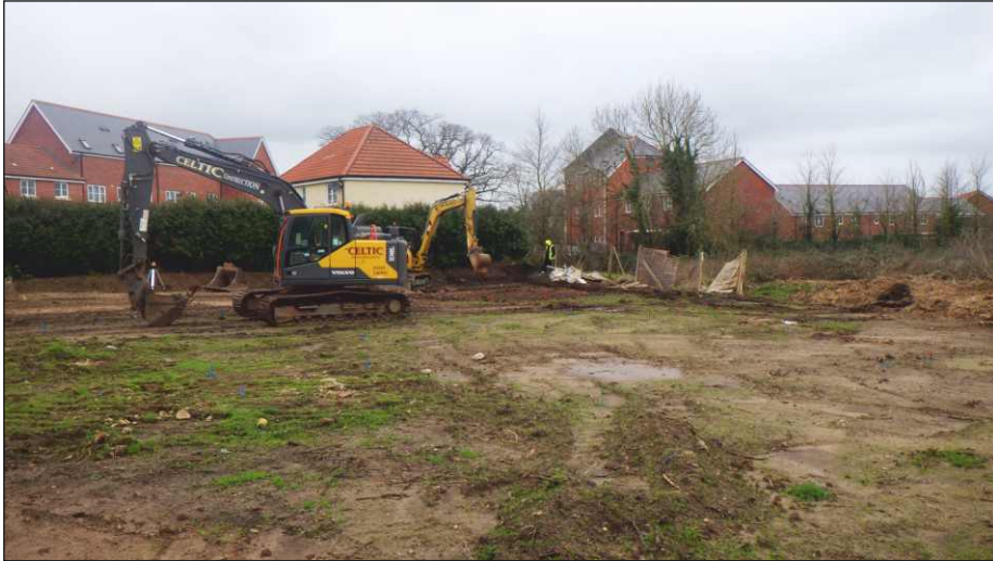
Plate 1: General view of site looking northwest