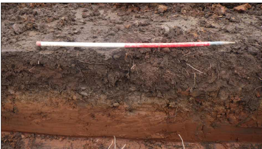
Plate 3: Representative section of excavated footings trench (scale 1m)