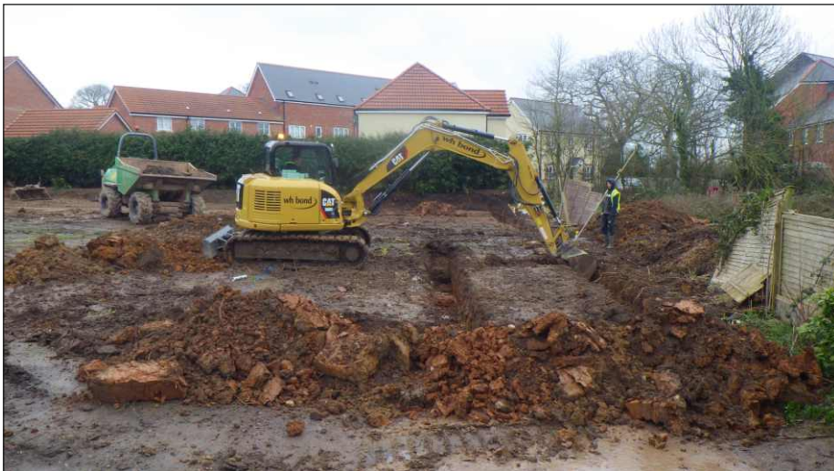
Plate 2: General working view during excavation of footings trench. Looking west from Plot 4