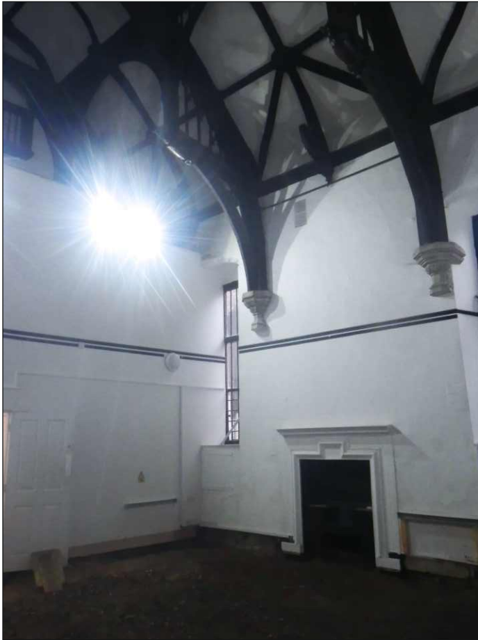
Plate 1: General view of former Law Library, looking east