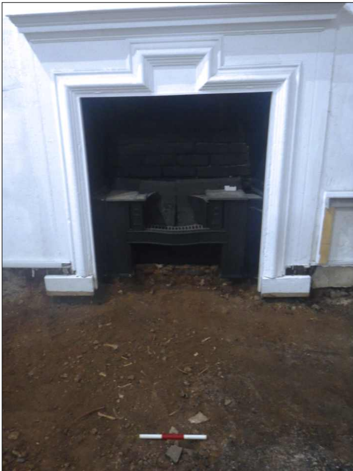
Plate 2: Showing animal bone scatter adjacent to fireplace. View to southeast (scale 0.3m)